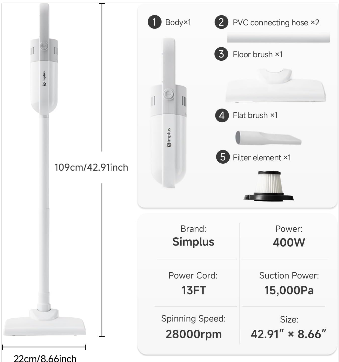
Figure 1: Product Components and Dimensions. This image illustrates the main body, two PVC connecting hoses, a floor brush, a flat brush, and a filter element. Key dimensions are also provided.