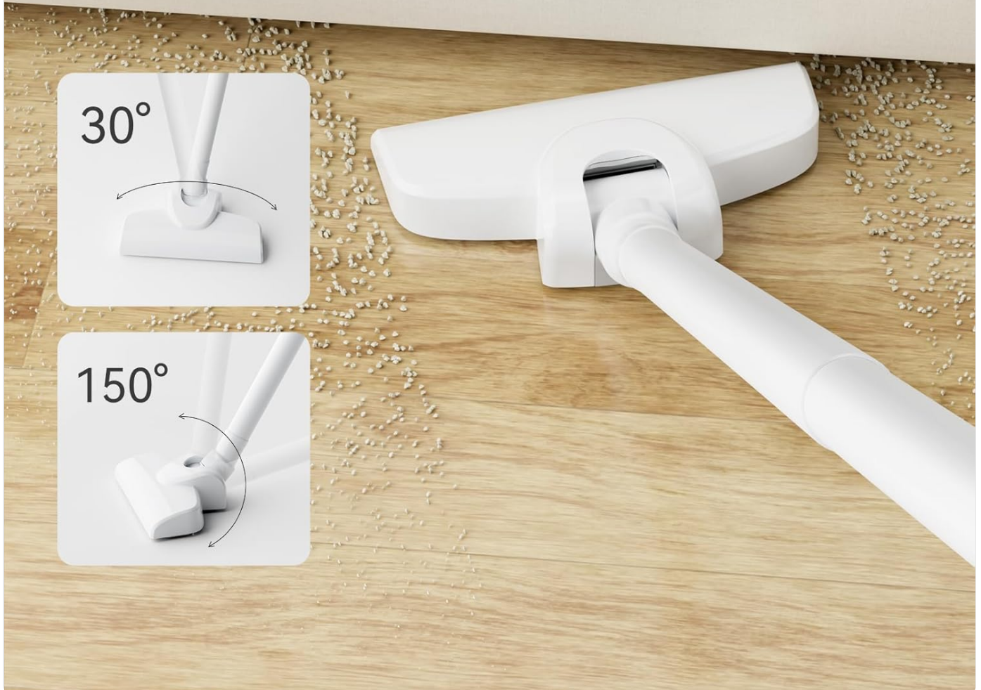
Figure 2: Flexible Brush Head. The brush head's swivel steering allows for easy cleaning under sofas, beds, and other low-clearance areas.