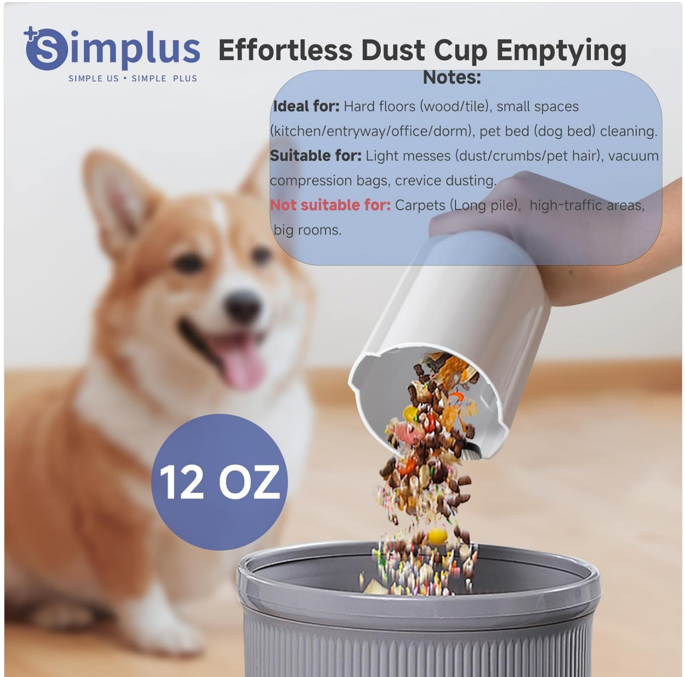
Figure 4: Effortless Dust Cup Emptying. The dust cup is designed for easy removal and emptying.