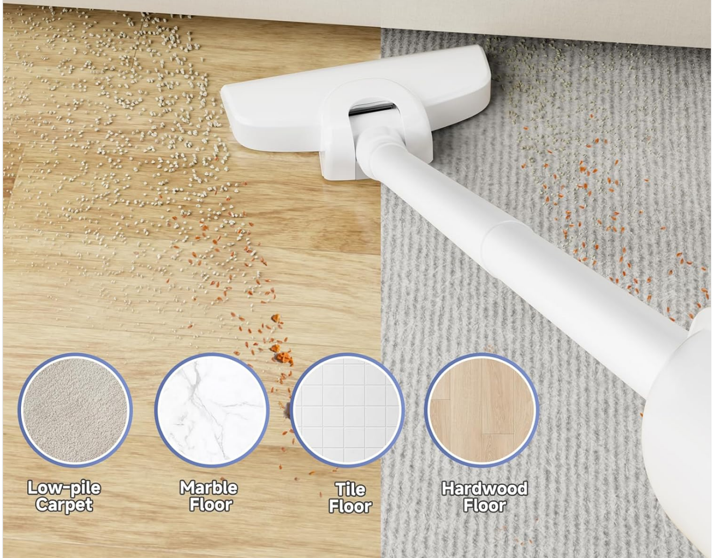
Figure 3: Suitable for Different Floor Surfaces. The vacuum is effective on various hard floor types and low-pile carpets.