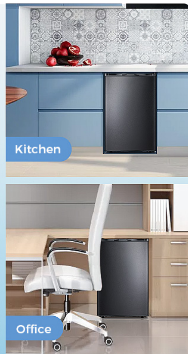
Image: The compact design of the Electactic Mini Upright Freezer allows for versatile placement in various rooms.