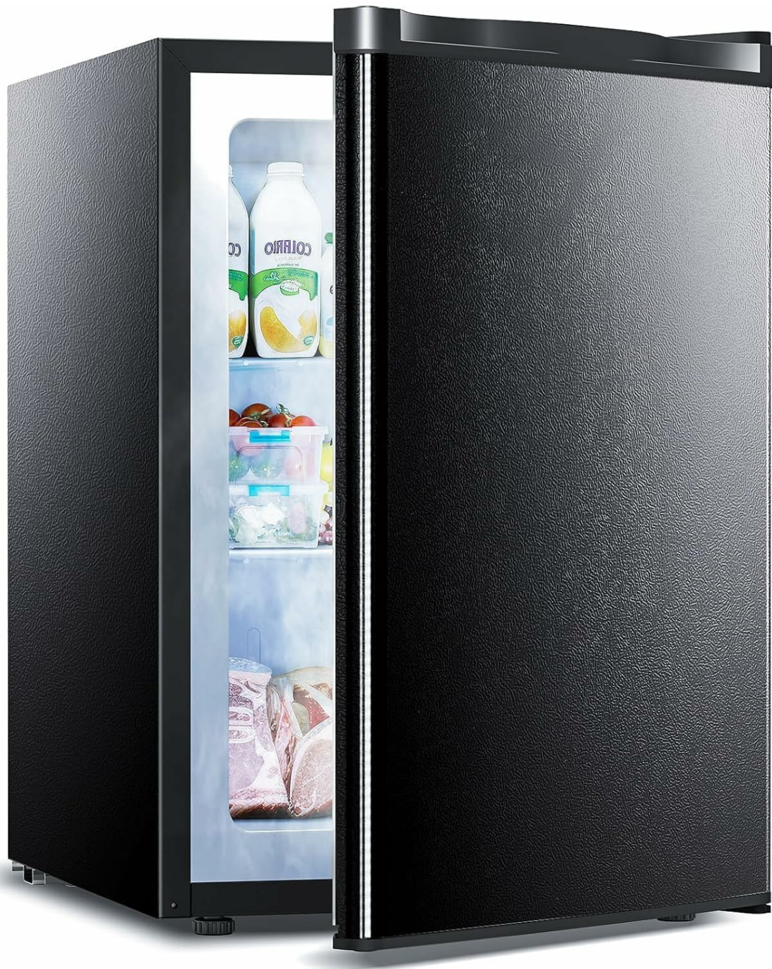
Image: Electactic 3.2 Cu.ft Mini Upright Freezer in Black.