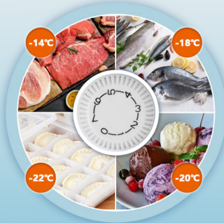
Image: Illustration of the 7-grade adjustable thermostat and optimal temperature zones for different food items.

Keep foods and beverages at their optimum temperature from