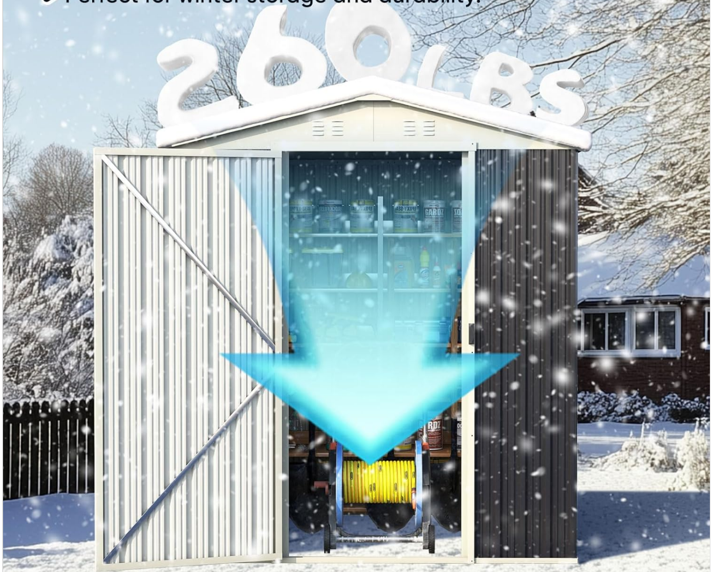
Image: The Quicent metal storage shed is designed to withstand various weather conditions, including snow, providing heavy-duty protection for stored items.