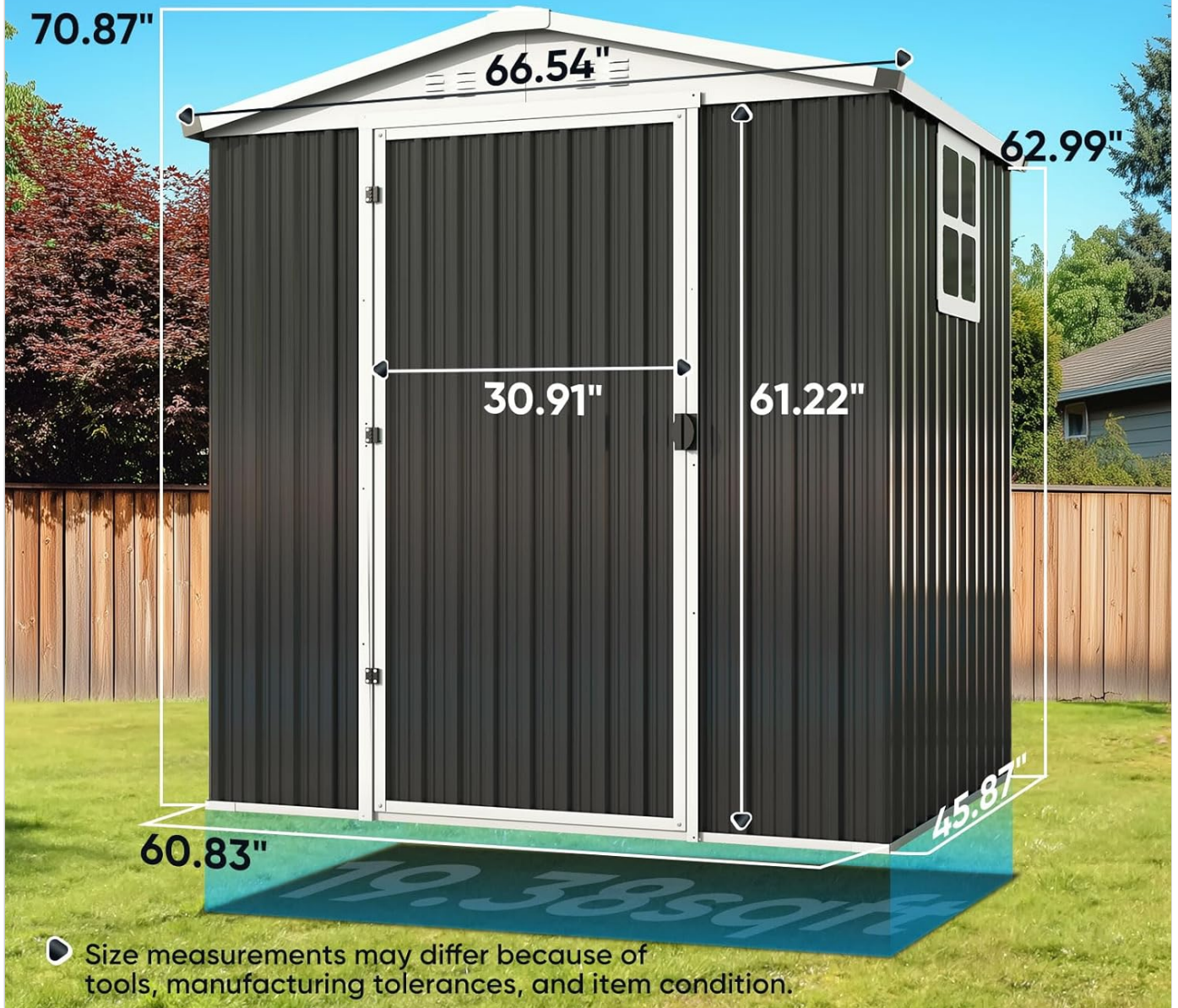
Image: Visual representation of the shed's dimensions, providing key measurements for planning and placement.