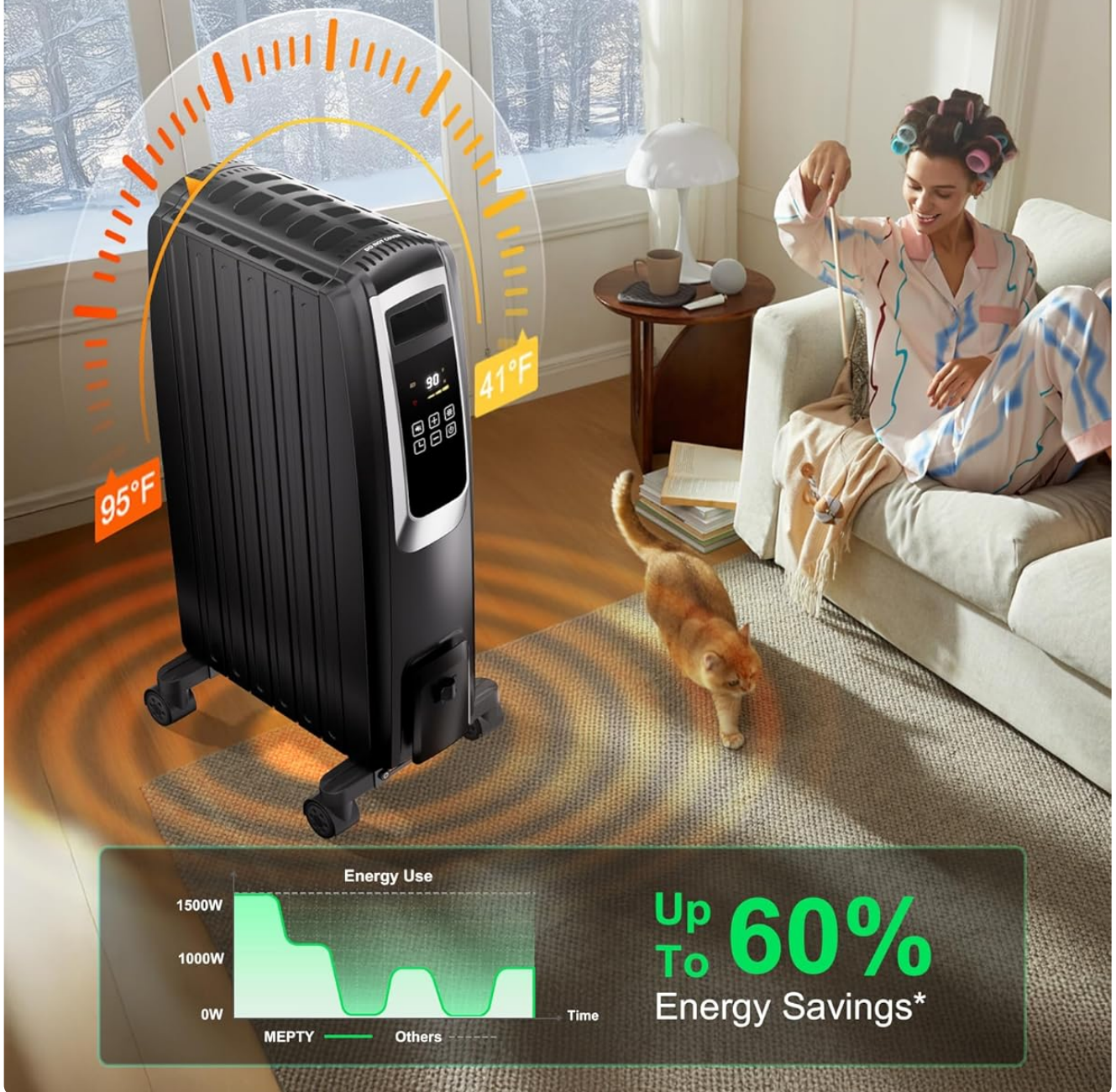
Figure 4: Digital display showing temperature control and an illustration of energy savings with ECO mode.