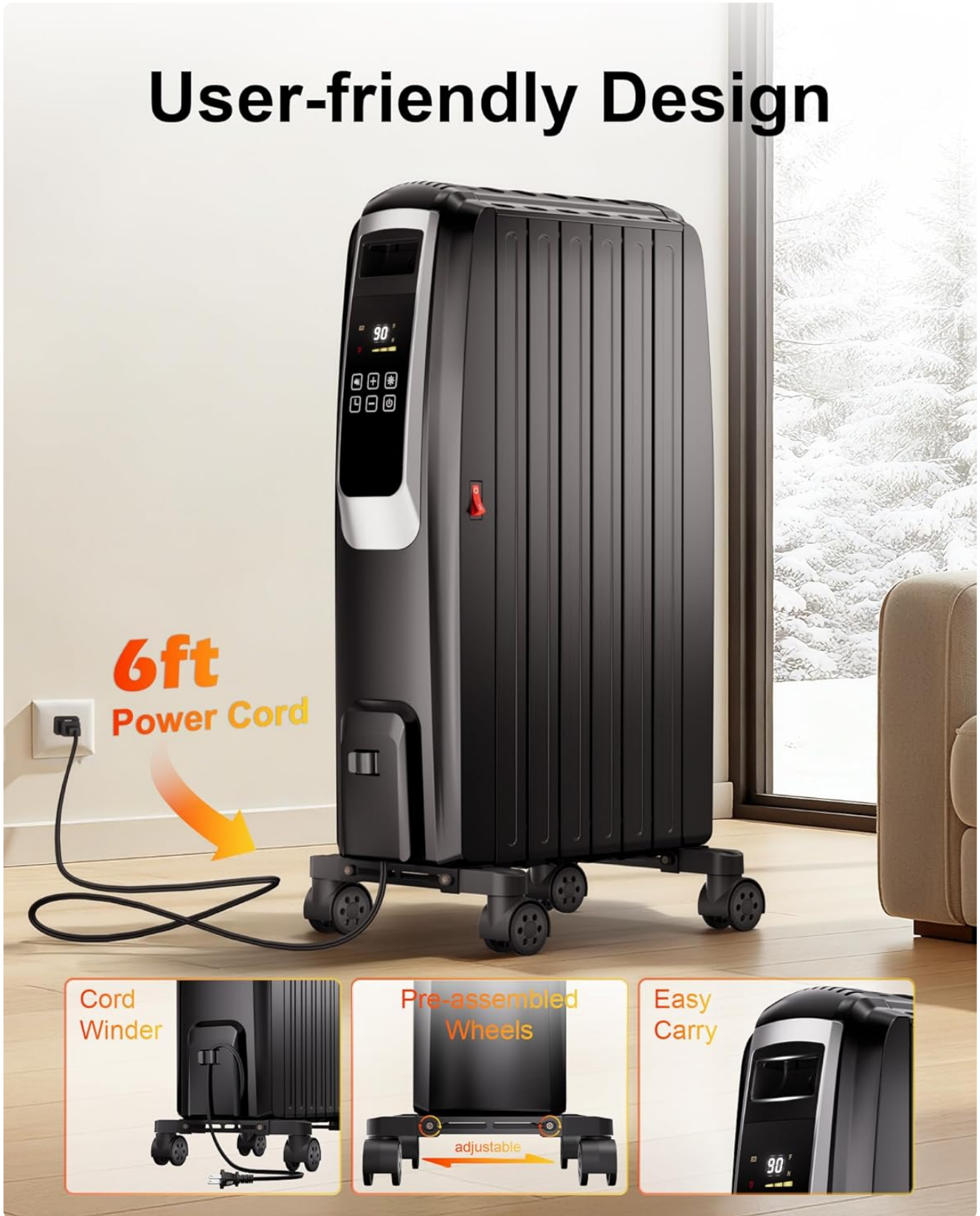
Figure 3: Detail of the pre-assembled wheels and integrated cord winder for convenient storage.

The wheels are pre-assembled and designed for easy deployment. Simply pull them out from the base of the heater until they lock into position. This allows for smooth movement of the unit.