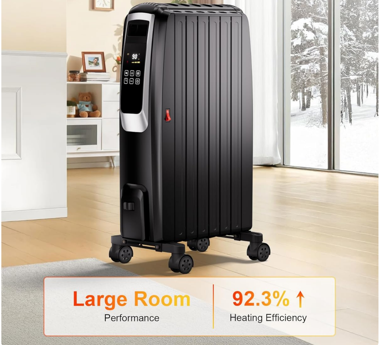
Figure 2: The heater providing warmth in a large room, demonstrating its heating efficiency.