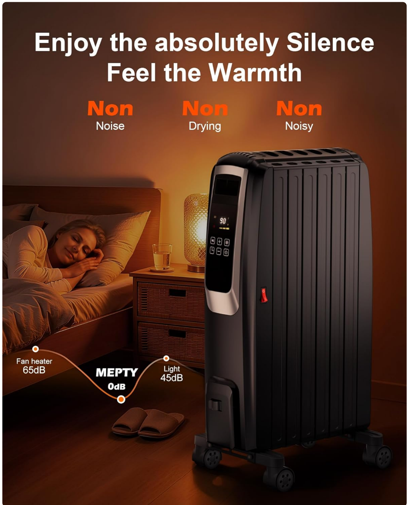
Figure 5: The heater operating silently in a bedroom, ensuring undisturbed sleep.

Press the Silent Mode button (often represented by a speaker icon) to mute button press sounds and dim the display lights, ideal for nighttime use in bedrooms.