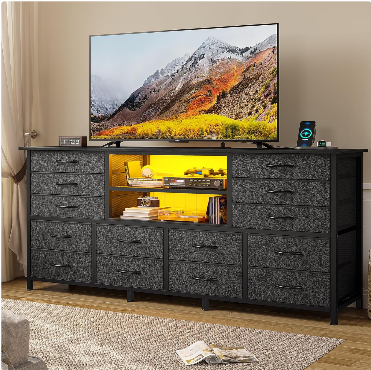
Image 1.1: BTHFST TV Stand with a television and illuminated LED shelves.