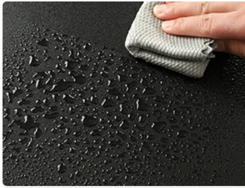
Image 6.1: Demonstrating the waterproof and easy-to-clean surface.