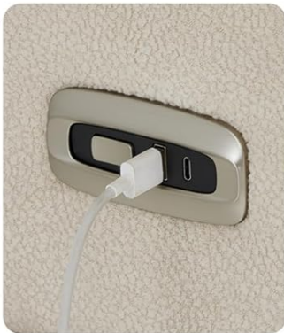
USB & Type-C Ports