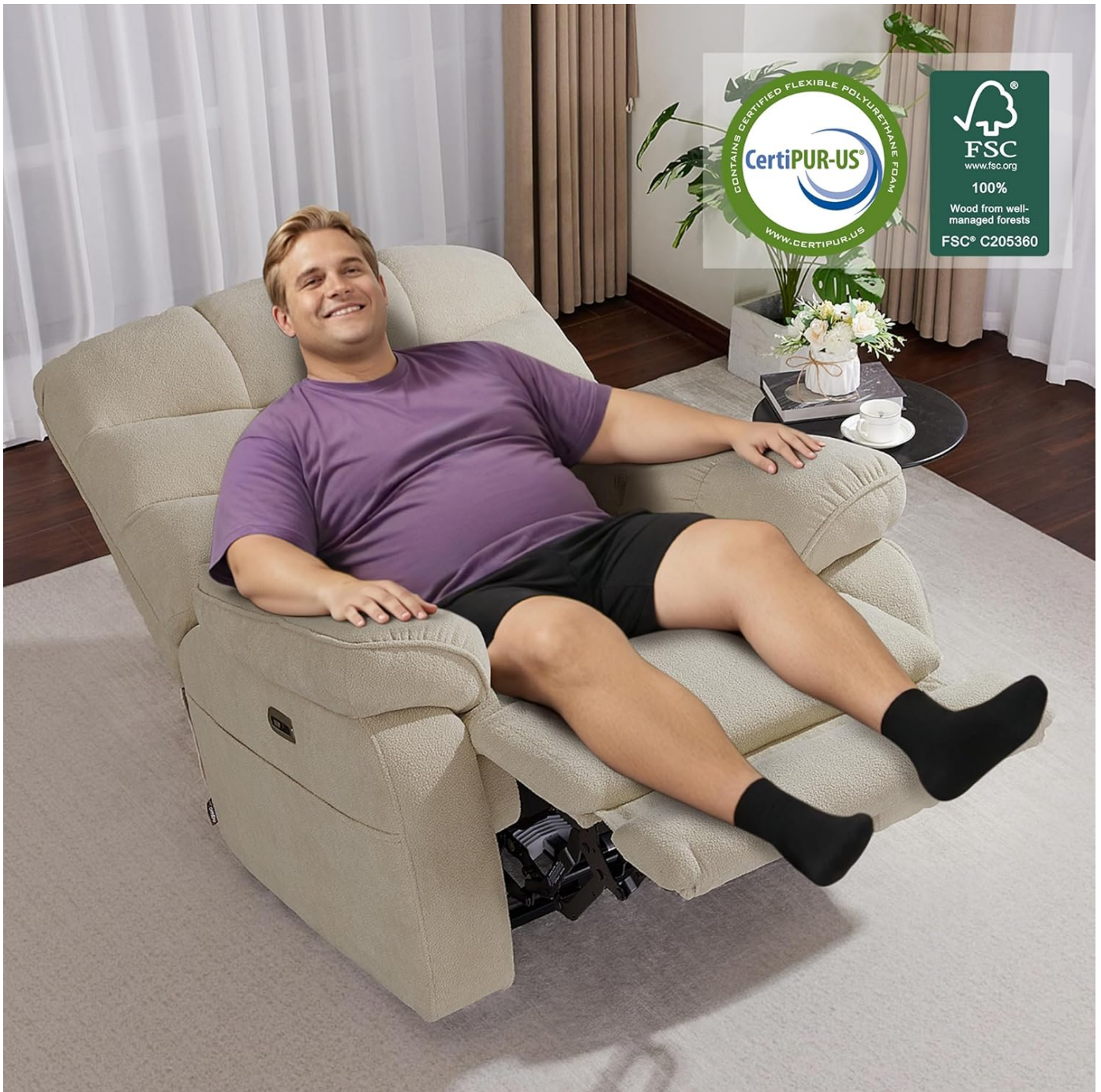
Image Description: A man sitting comfortably in the MCombo PR677 recliner, highlighting the chair's spacious design. CertiPUR-US and FSC certifications are visible in the background, indicating certified foam and wood materials.