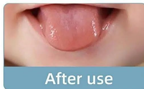
Image 5.1: The finger toothbrush effectively cleans the tongue, as shown in before and after images.

Your browser does not support the video tag.