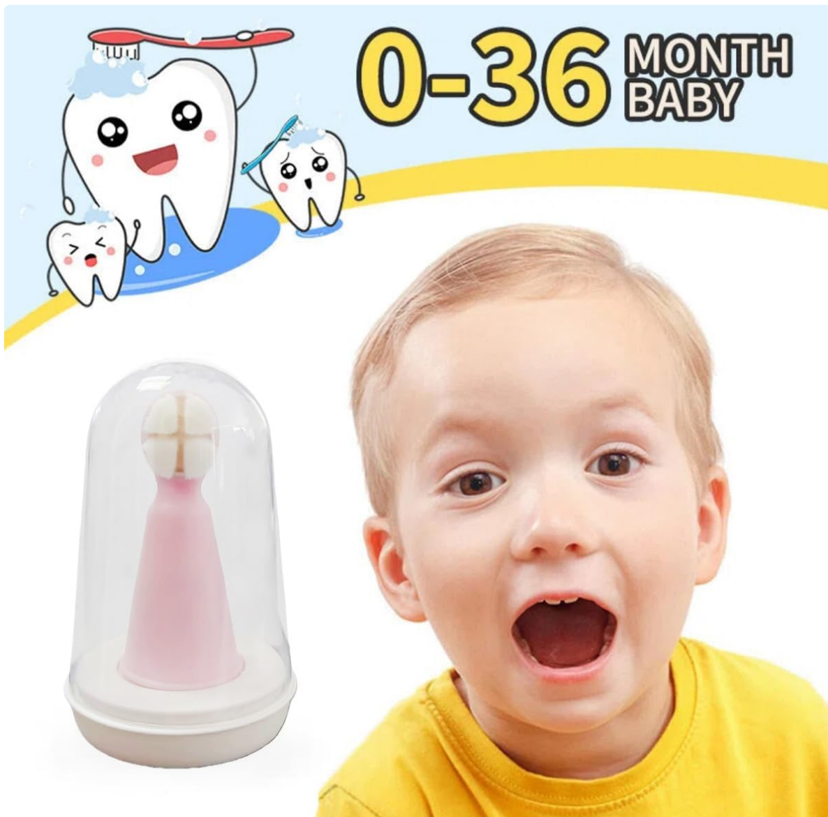
Image 1.1: The FOREVIVE Baby Finger Toothbrush, designed for young children.