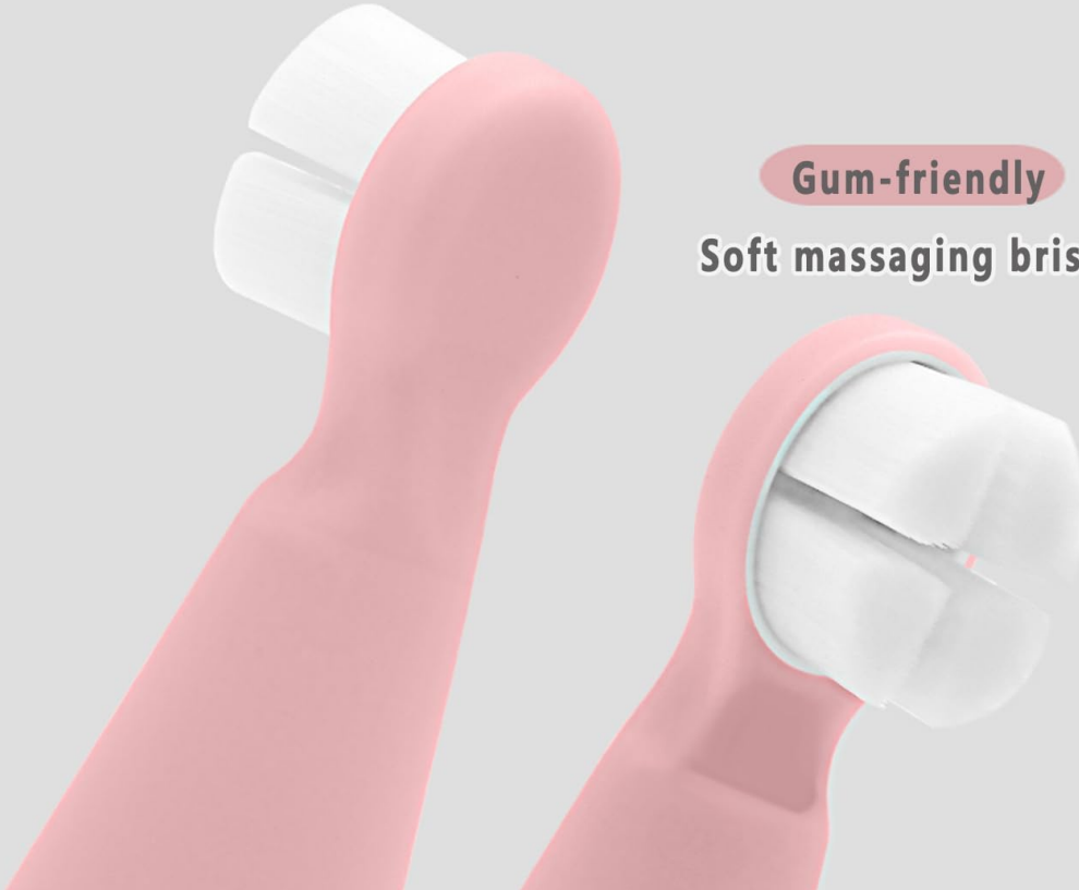
Image 3.2: Innovative silicone design with gum-friendly, soft massaging bristles.