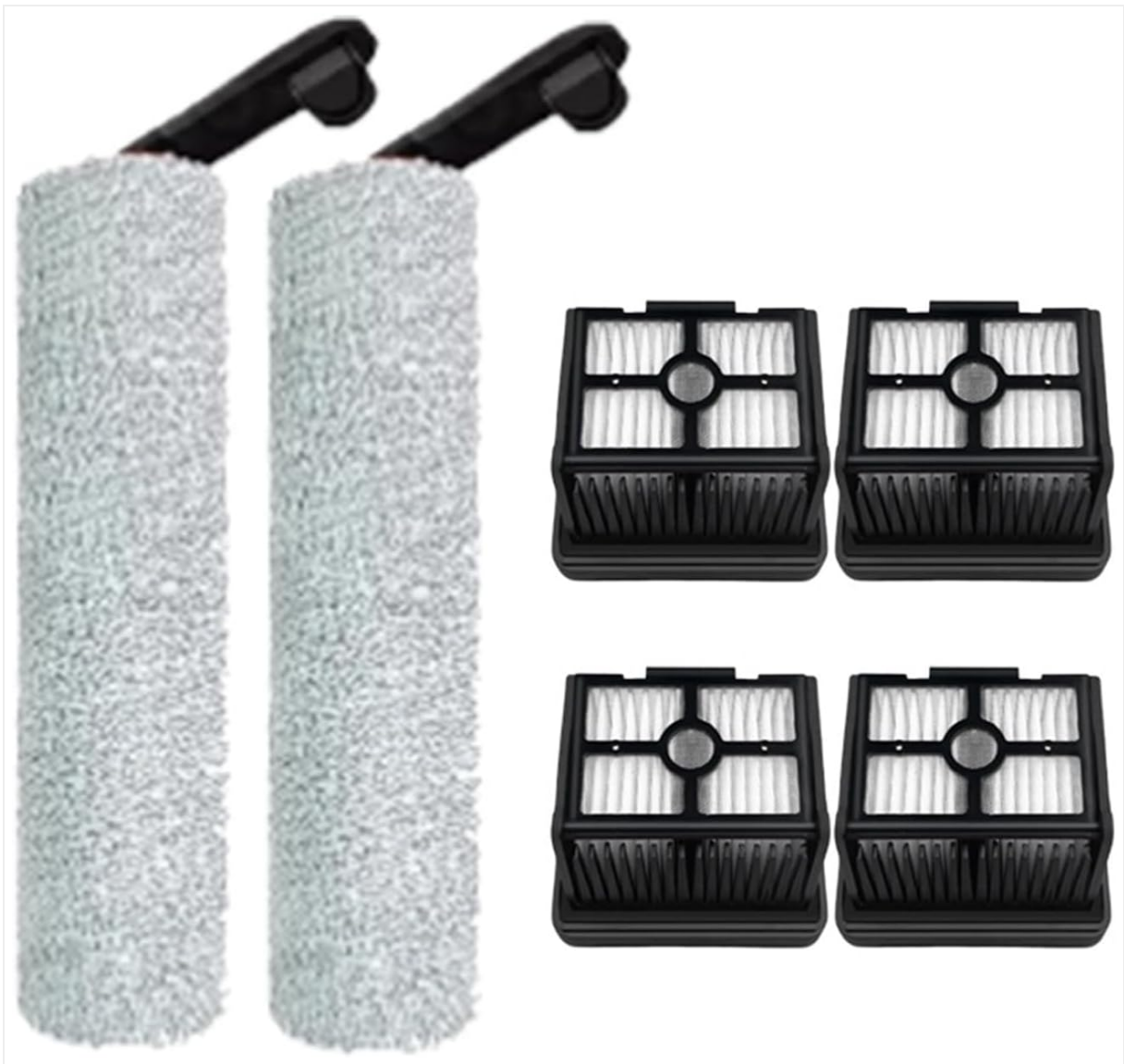
Figure 1: TNFMJSRXE Soft Brush Rollers and Filters. This image displays two soft brush rollers and four compatible HEPA filters, essential components for maintaining the cleaning efficiency of Dreame H12 Pro and H12 Plus wet and dry vacuum cleaners.