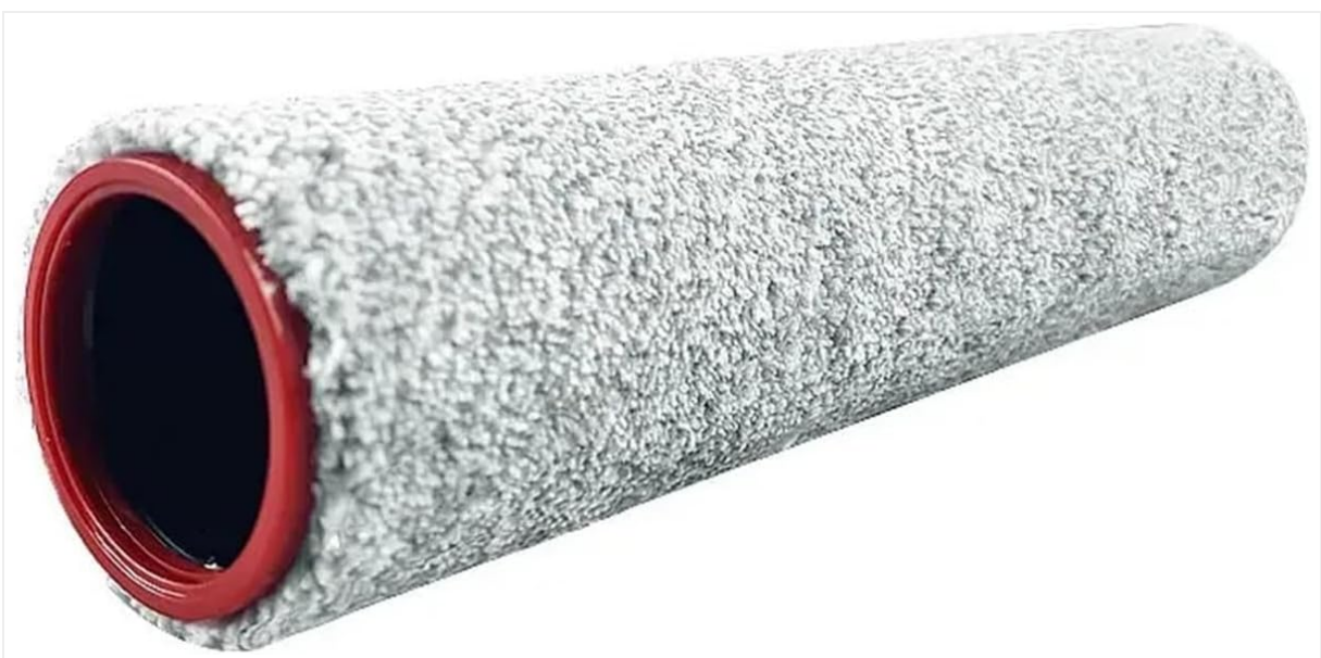
Figure 4: Brush Roller End. A close-up of the brush roller's end, showing the red sealing ring and connection point, crucial for proper fit and function within the vacuum cleaner's brush head.