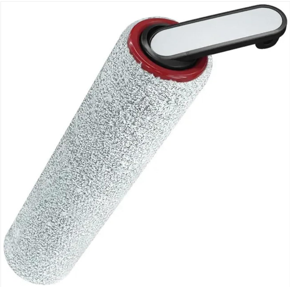
Figure 3: Soft Brush Roller. This image provides a detailed view of the soft brush roller, highlighting its texture and design, which is optimized for effective scrubbing and dust collection on various floor types.