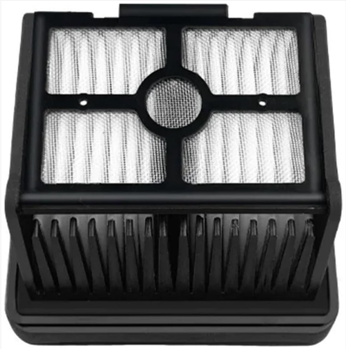
Figure 5: HEPA Filter. This image shows a detailed view of the HEPA filter, illustrating its pleated design and mesh screen, which are engineered to capture fine dust and allergens, ensuring cleaner air output.