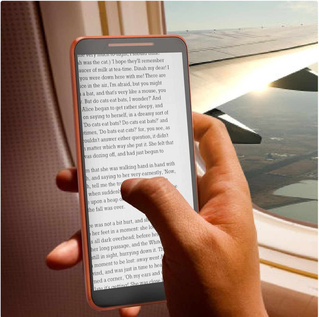
Image: Reading an e-book on the device.