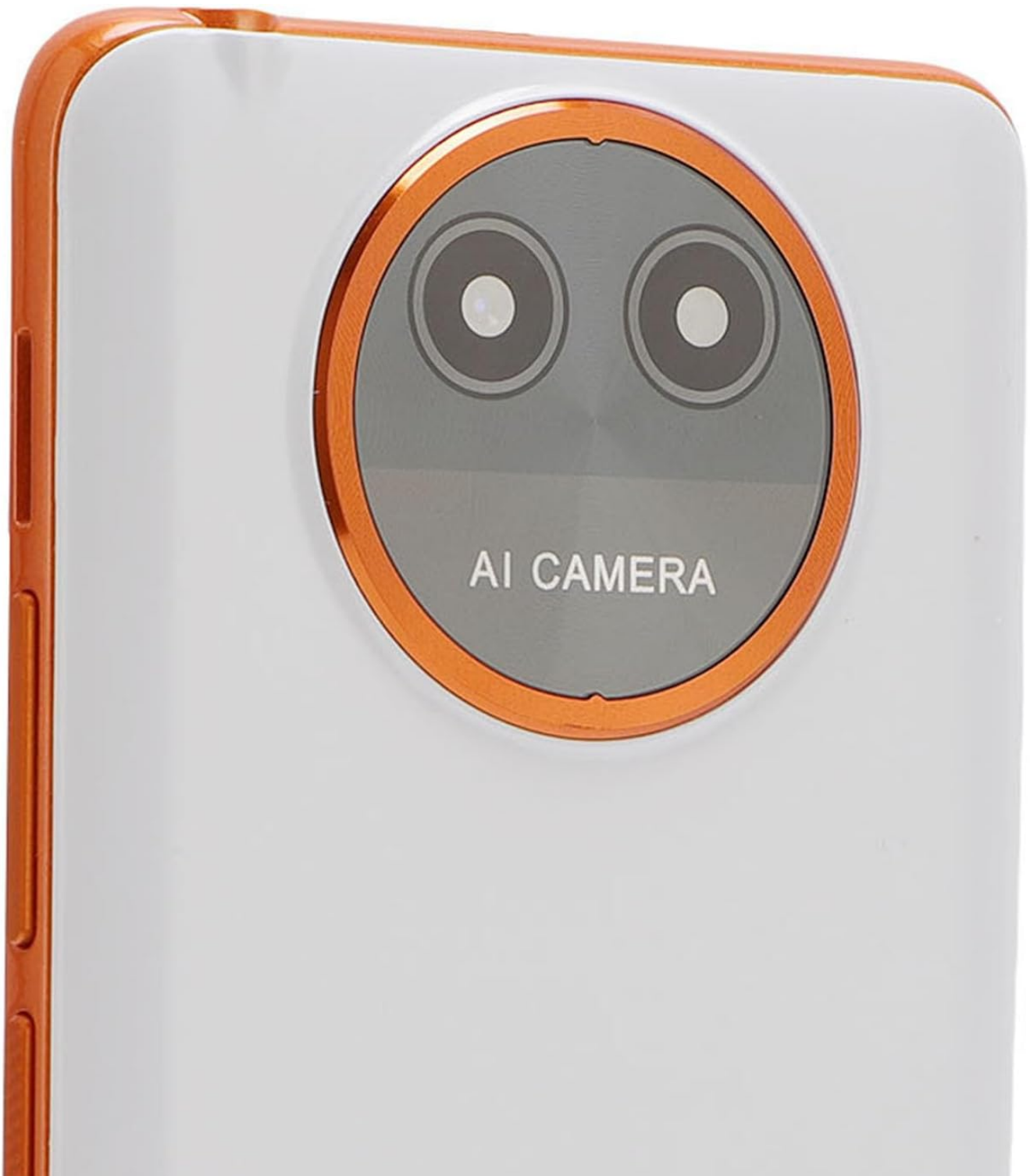
Image: Rear camera module of the device.

The device includes an 8MP camera. Access the camera application to capture photos or engage in video calls.