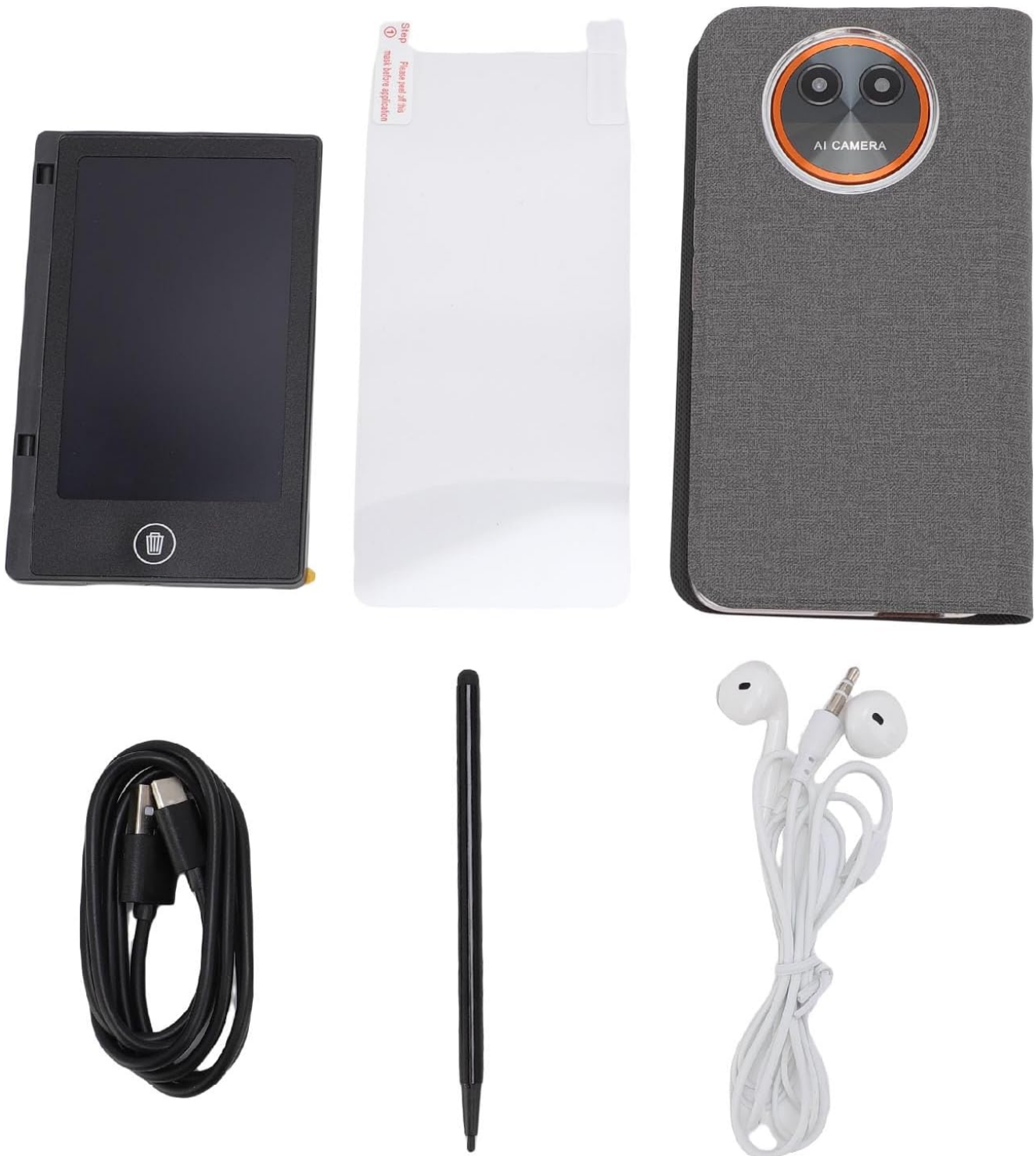
Image: All components included with the Zunate E-Book Reader.