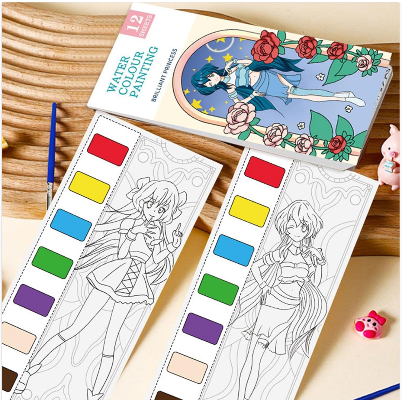
Image: Two open watercolor painting books displaying various coloring pages and the integrated watercolor paint strips, ready for use.