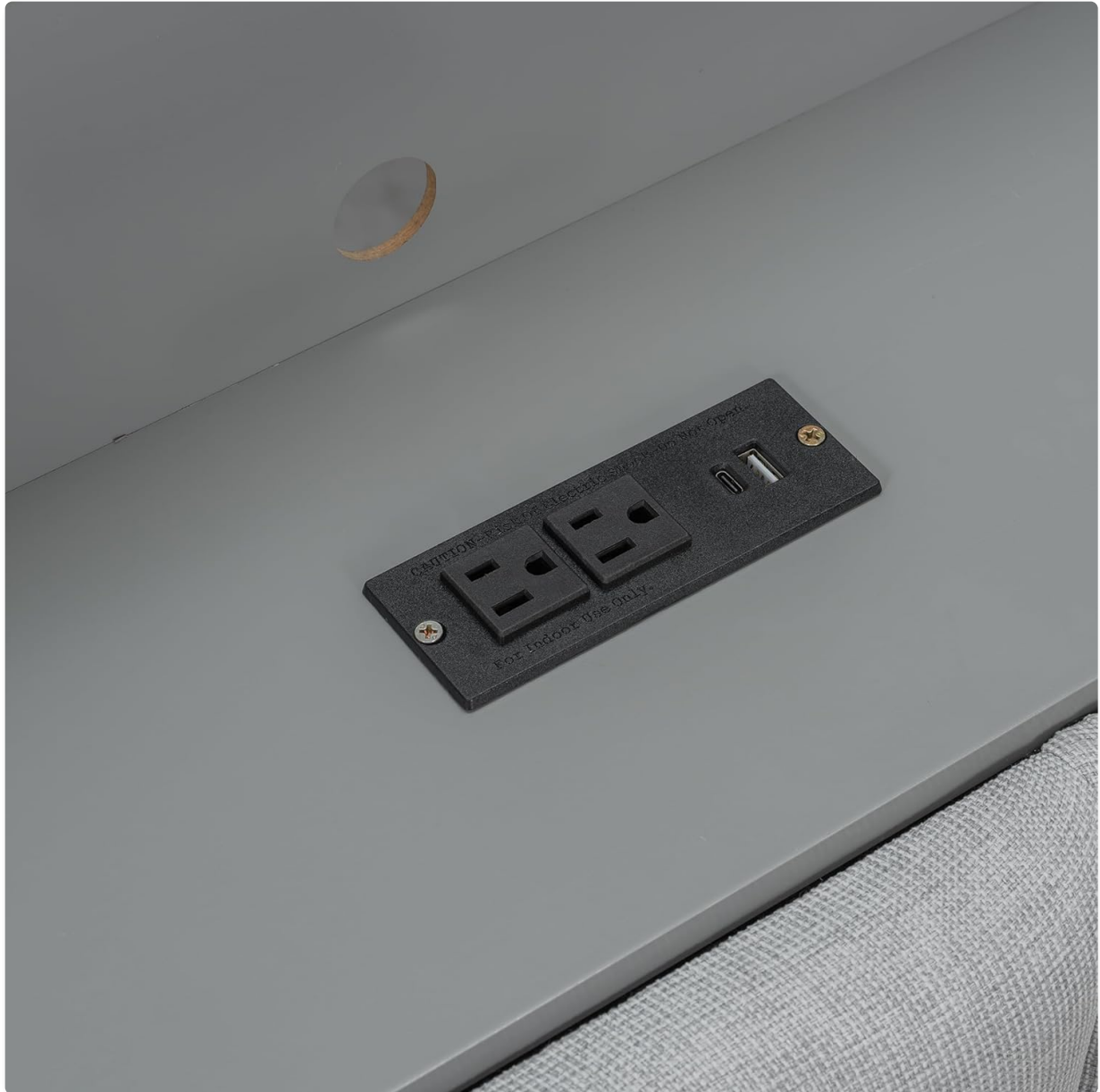
Image 3: The charging station provides convenient power access for electronic devices.

The built-in charging station includes 2 standard plug outlets and 2 USB ports. To use, simply plug the bed's power cord into a wall outlet. You can then charge your electronic devices conveniently from your bed.