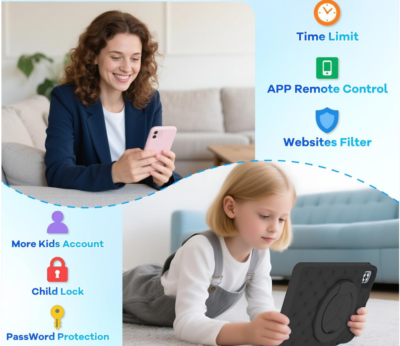
Image: Visual guide to the tablet's parental control interface and features.