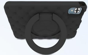
Image: The DMOAO D7 Kids Tablet with its protective EVA case, power adapter, Type-C cable, and user manual.