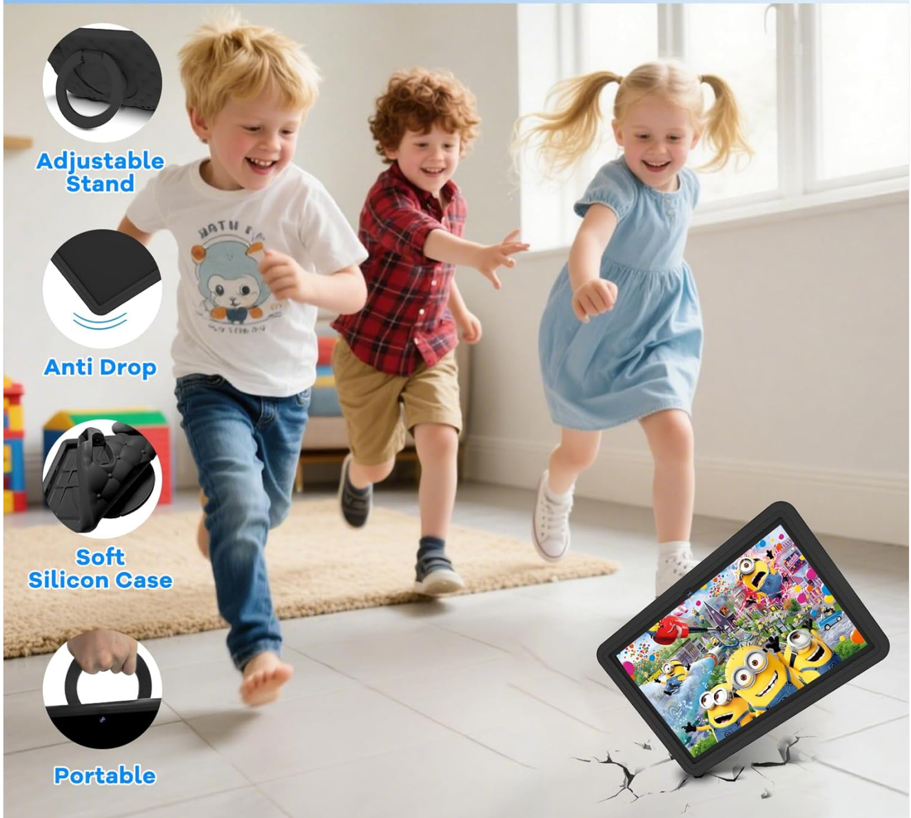
Image: The tablet's kid-proof EVA case, highlighting its adjustable stand and protective qualities.