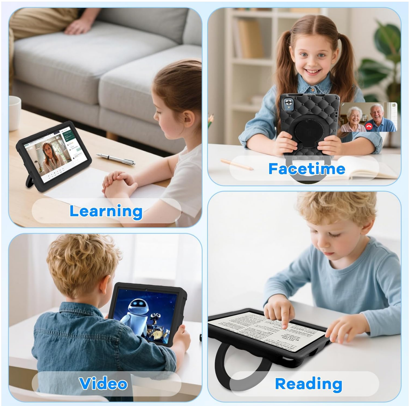
Image: Examples of children using the DMOAO D7 Kids Tablet for various activities like learning, video calls, and entertainment.