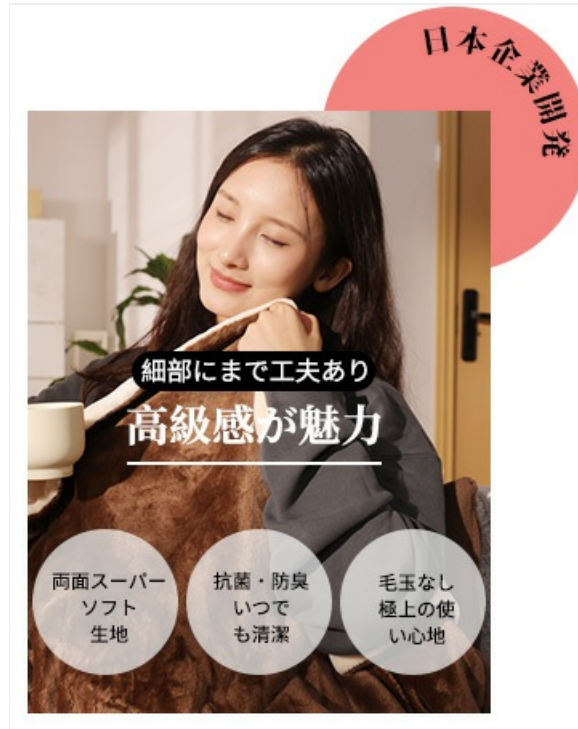
Image 6.1: The electric blanket is machine washable for easy cleaning.