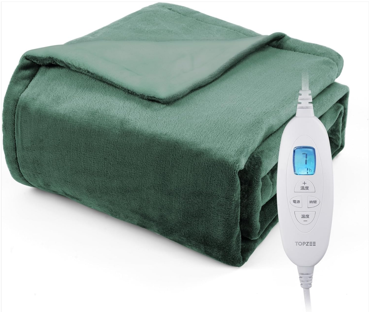
Image 1.1: The TOPZEE Electric Blanket, showcasing its size and soft texture.