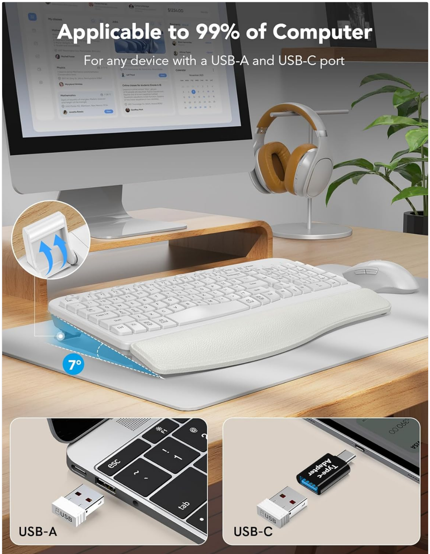
Figure 2: USB-A receiver and USB-C adapter for versatile connectivity.