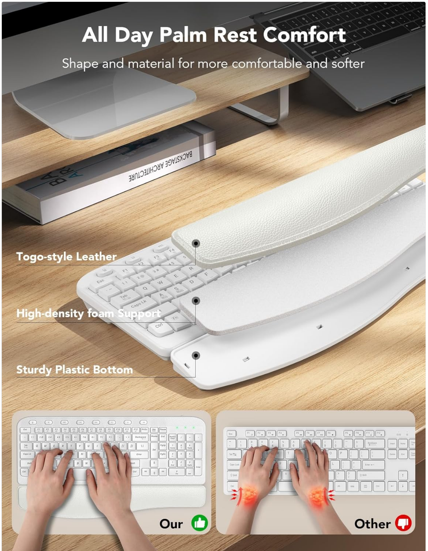
Figure 4: Detailed view of the cushioned palm rest construction.