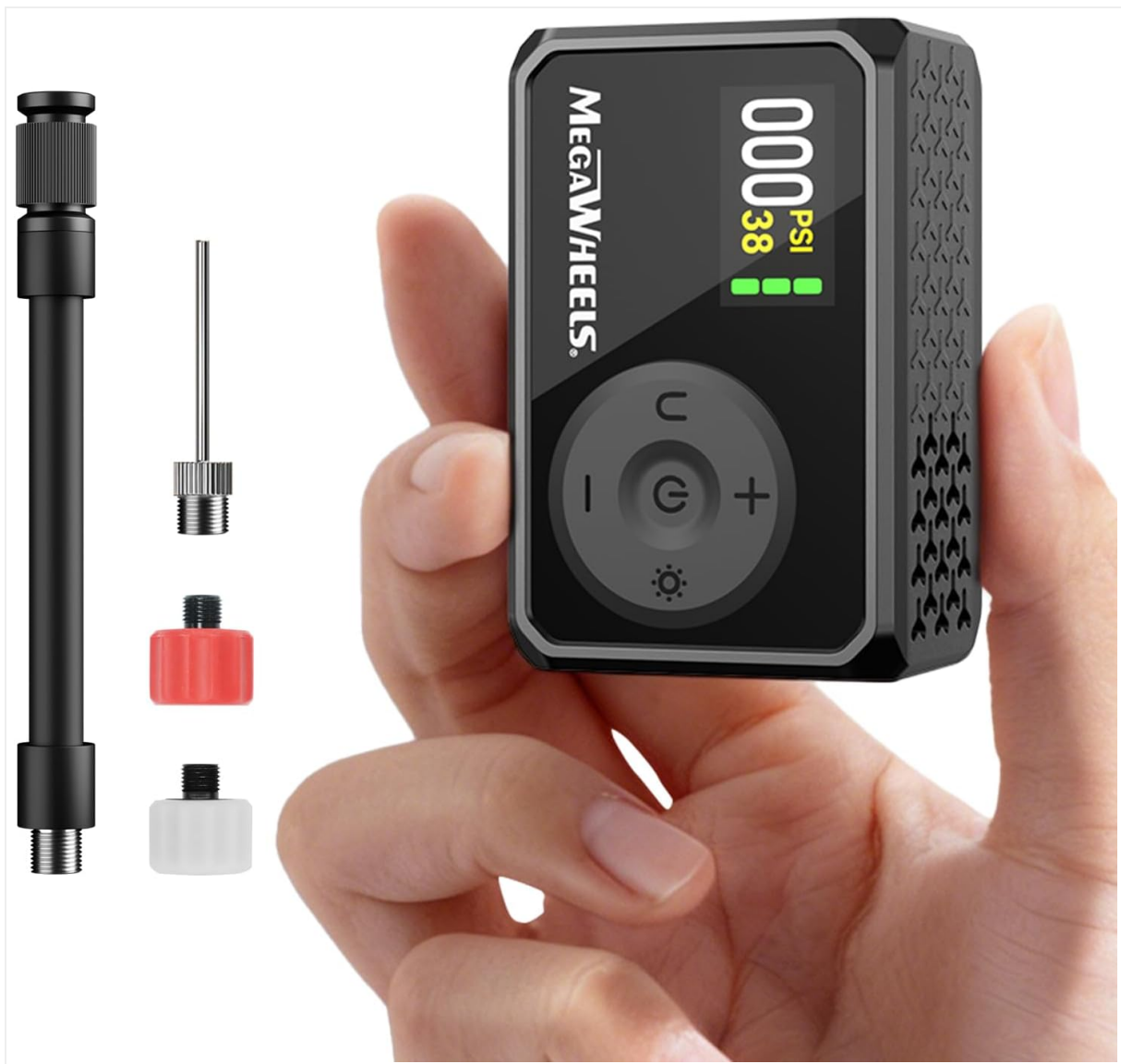
Image 1: MEGAWHEELS BL06-C Mini Bike Pump with included accessories.