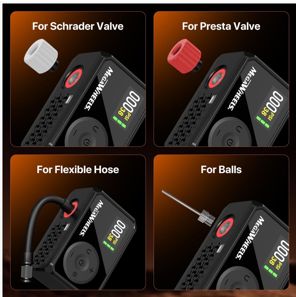
Image 8: Step-by-step visual guide for attaching different valve adapters.