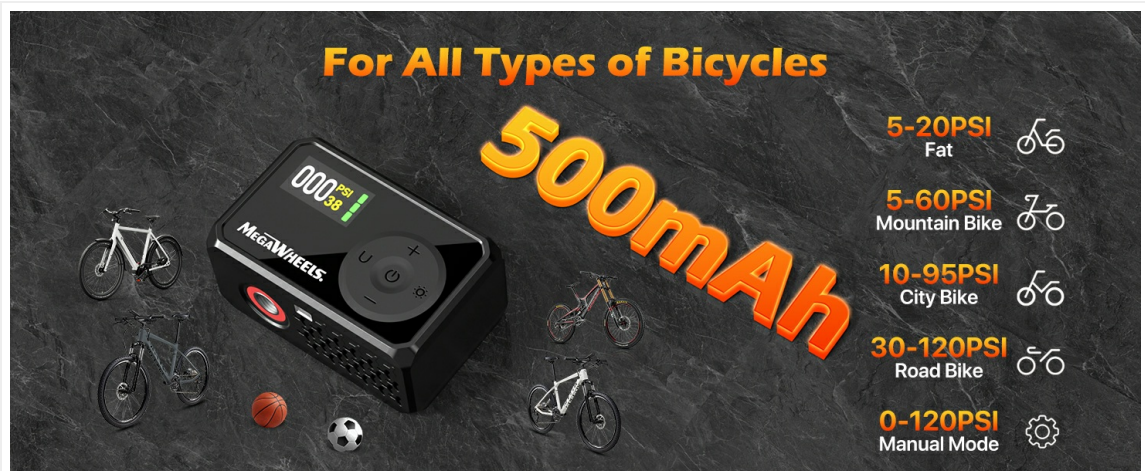
Image 4: The pump's LED display showing real-time pressure readings.