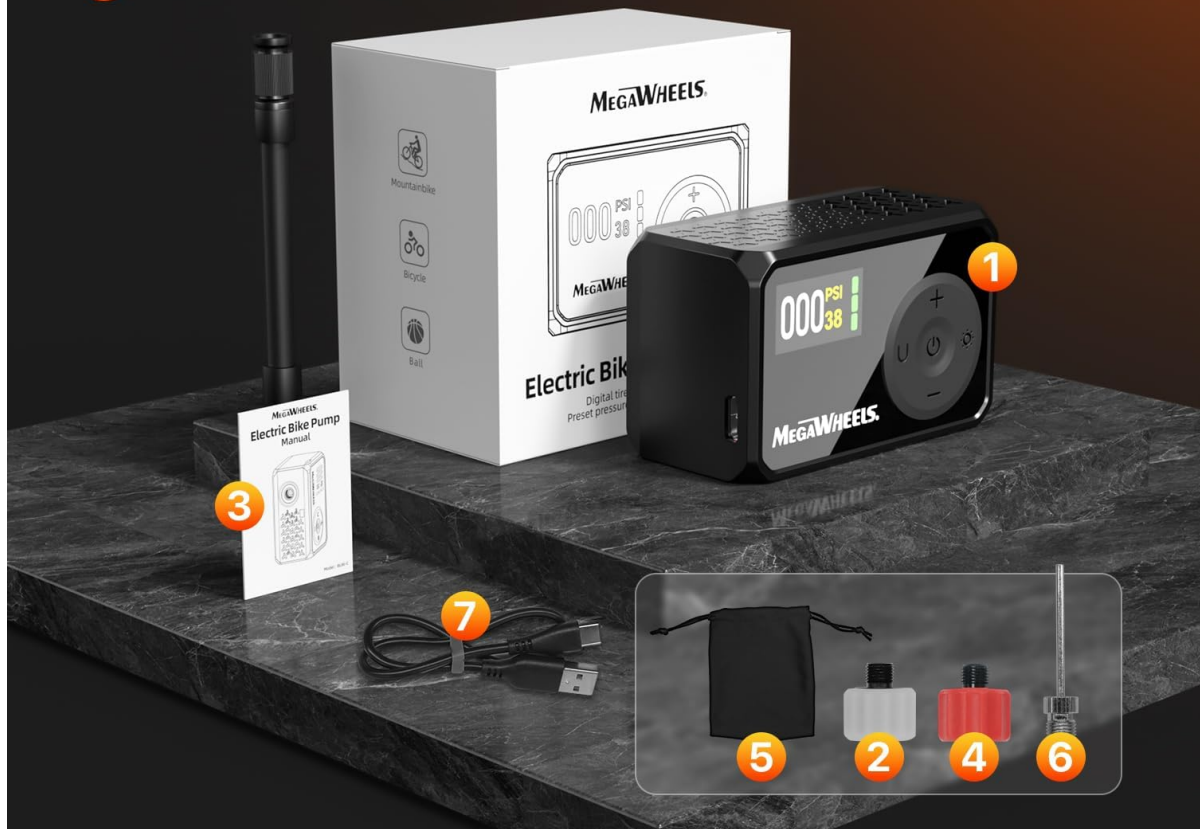
Image 2: Visual representation of all components included in the package.