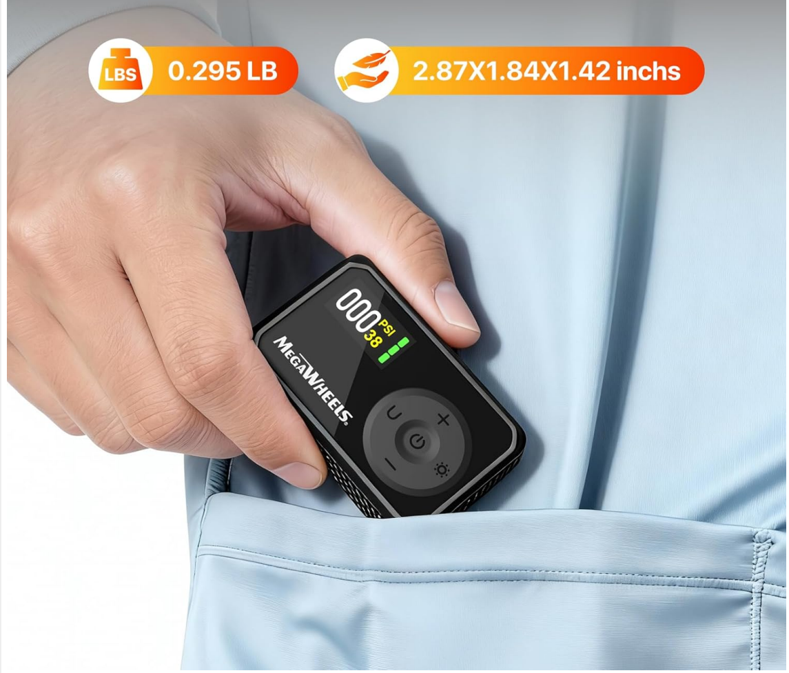
Image 3: The compact design of the pump, easily fitting into a pocket.