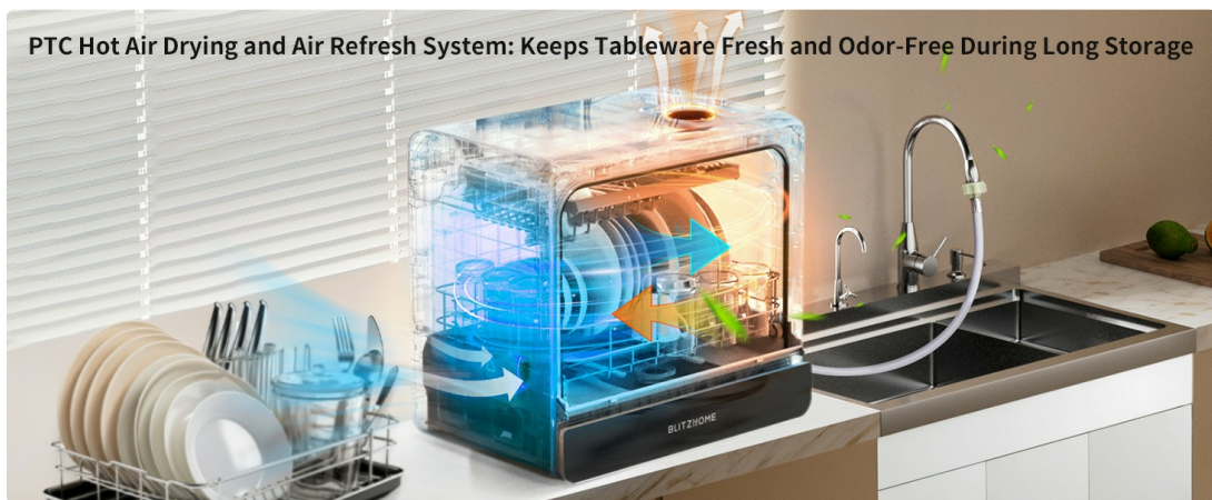
Image: Visual representation of the PTC hot air drying and air refresh system in action within the dishwasher.