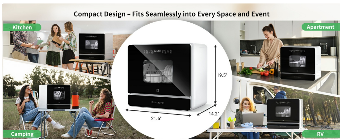
Image: The dishwasher shown in different environments (kitchen, RV, camping) to illustrate its compact and versatile design.