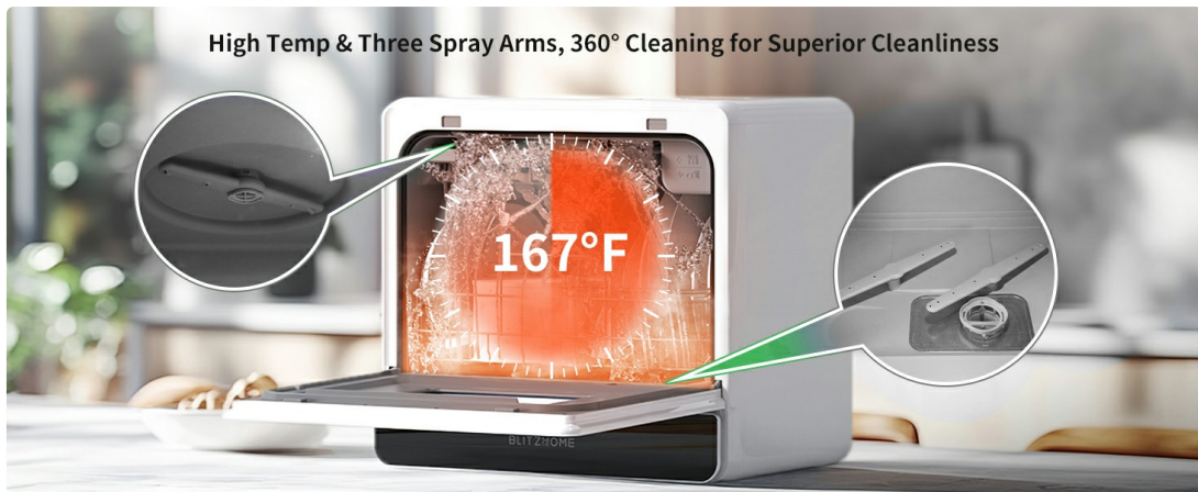
Image: Close-up of the dishwasher interior with water spraying at 167°F, illustrating the powerful cleaning action.