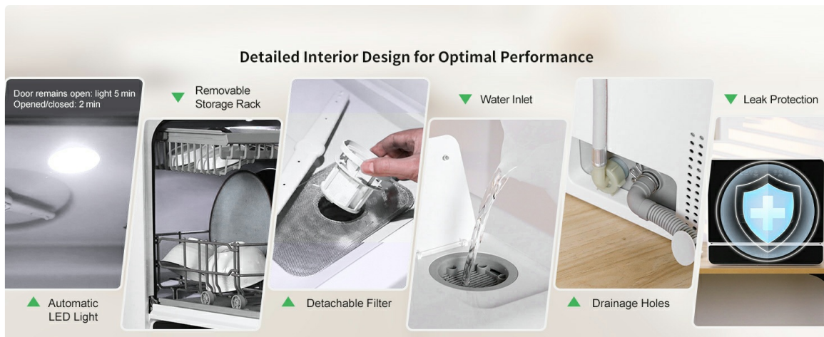
Image: Detailed view of the dishwasher's interior, highlighting the removable filter and drainage system for maintenance.

Regularly check and clean the filter located at the bottom of the dishwasher to remove any food debris. Rinse the filter under running water. If storing the dishwasher, ensure the filter area is completely dry to prevent mold growth.