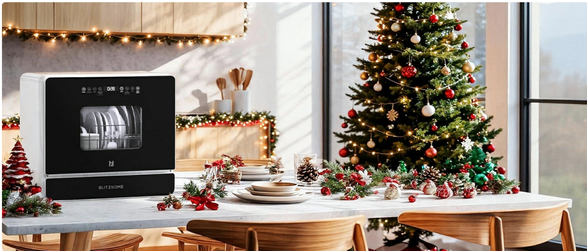
Image: BLITZHOME Countertop Portable Dishwasher on a kitchen counter, highlighting its compact design.

This manual provides essential information for the safe and efficient operation of your BLITZHOME WiFi Countertop Portable Dishwasher. Designed for convenience and powerful cleaning, this compact appliance is ideal for various living spaces, including apartments, RVs, and dorms. Please read these instructions thoroughly before first use and retain them for future reference.