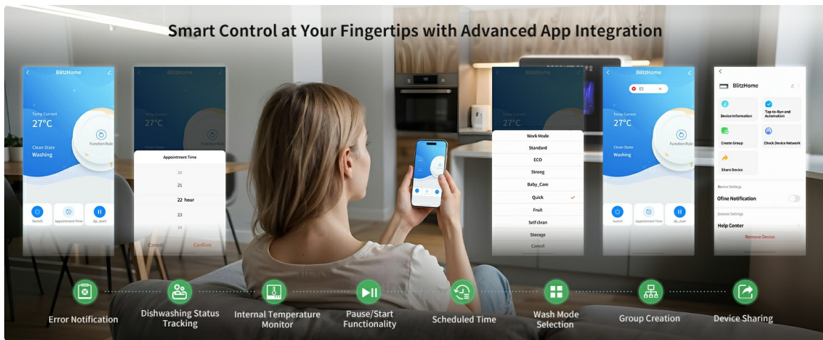
Image: The BLITZHOME app interface on a smartphone, demonstrating remote control and monitoring features.