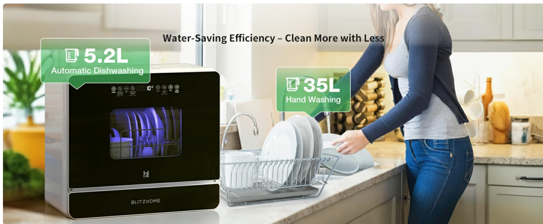
Image: A visual comparison demonstrating the water efficiency of the dishwasher (5.2L) versus handwashing (35L).