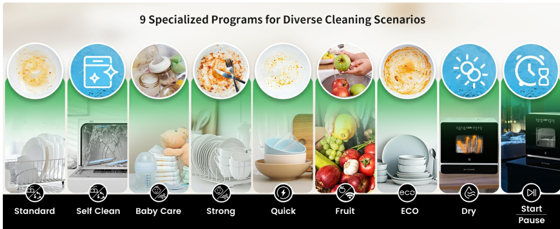
Image: The dishwasher's control panel with icons for different wash programs and functions.

The dishwasher features a touch control panel on the front. Icons include Power, Standard/Self-clean, ECO, Baby Care/Strong, Quick, Fruit/WiFi, Dry, and Start/Pause.