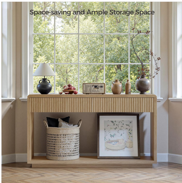
Figure 6: Entryway Placement Example