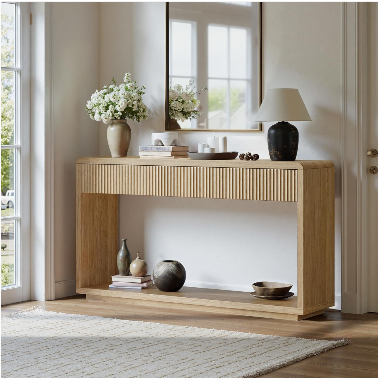
Figure 3: Fully Assembled Entryway Table