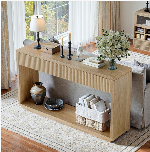
Figure 7: Sofa Table Placement Example