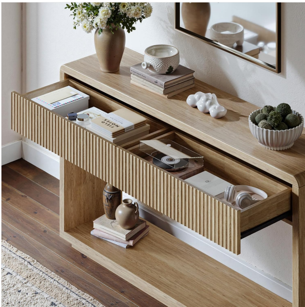
Figure 5: Drawer Interior View