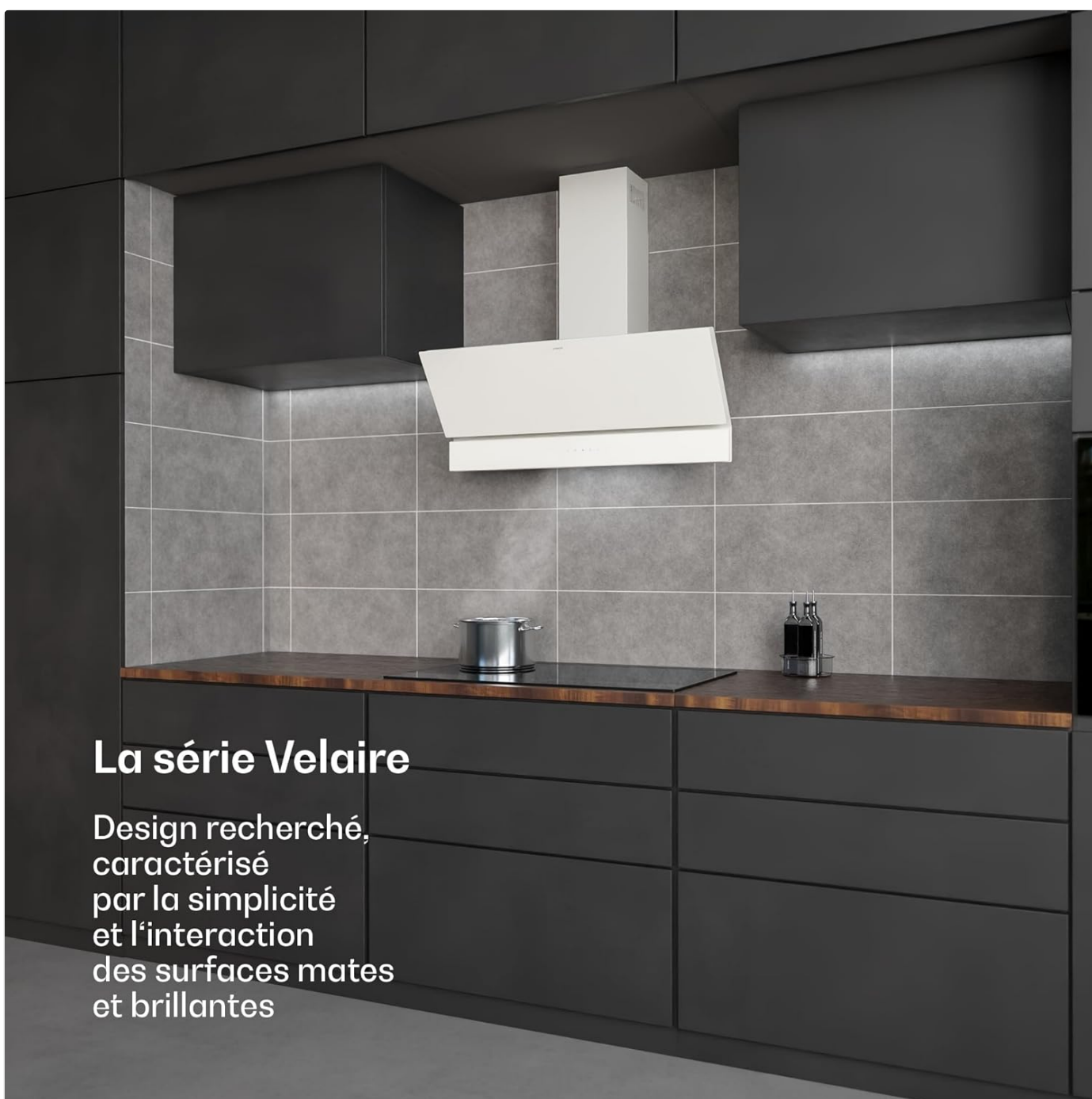
Image: A white Klarstein Velaire 90cm range hood mounted above a cooking hob with a pot, demonstrating its presence in a kitchen