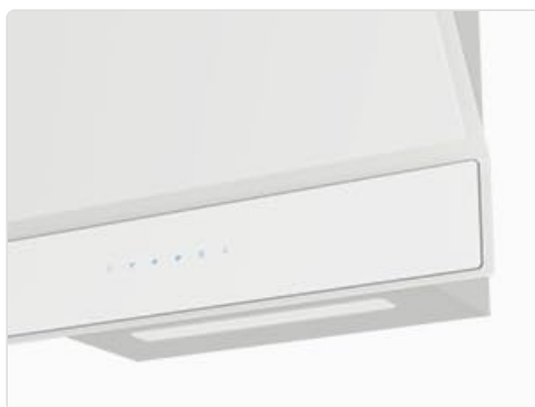
Image: A detailed view of the LED lighting strip on the underside of the range hood, providing bright illumination.

Activate the integrated LED lighting for optimal visibility over your cooking area. The LED lights are energy-efficient.