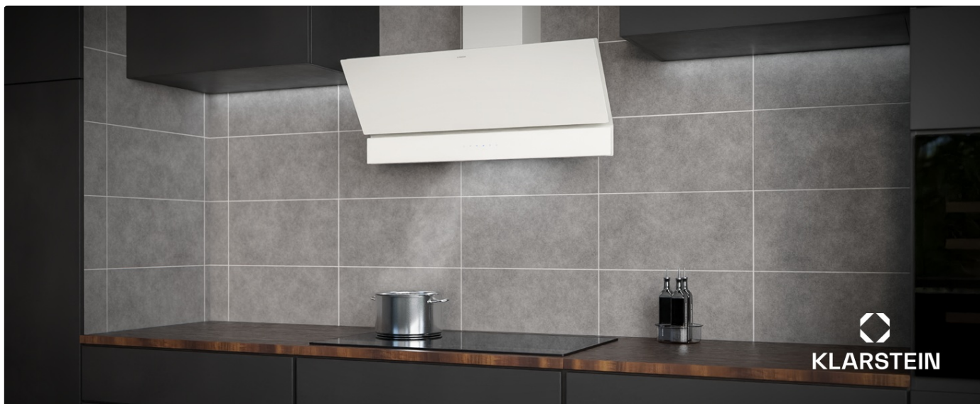
Image: The Klarstein Velaire 90cm range hood installed in a modern kitchen, showcasing its sleek design.