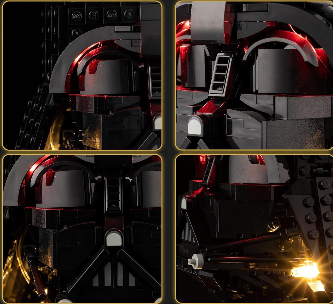
Figure 3.1: Detailed views of the LED lights integrated into the Lego Darth Vader Helmet, highlighting the precise placement and illumination of various sections.

Model is for Display Use Only and NOT INCLUDED