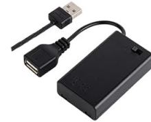
Battery Box AAA not included