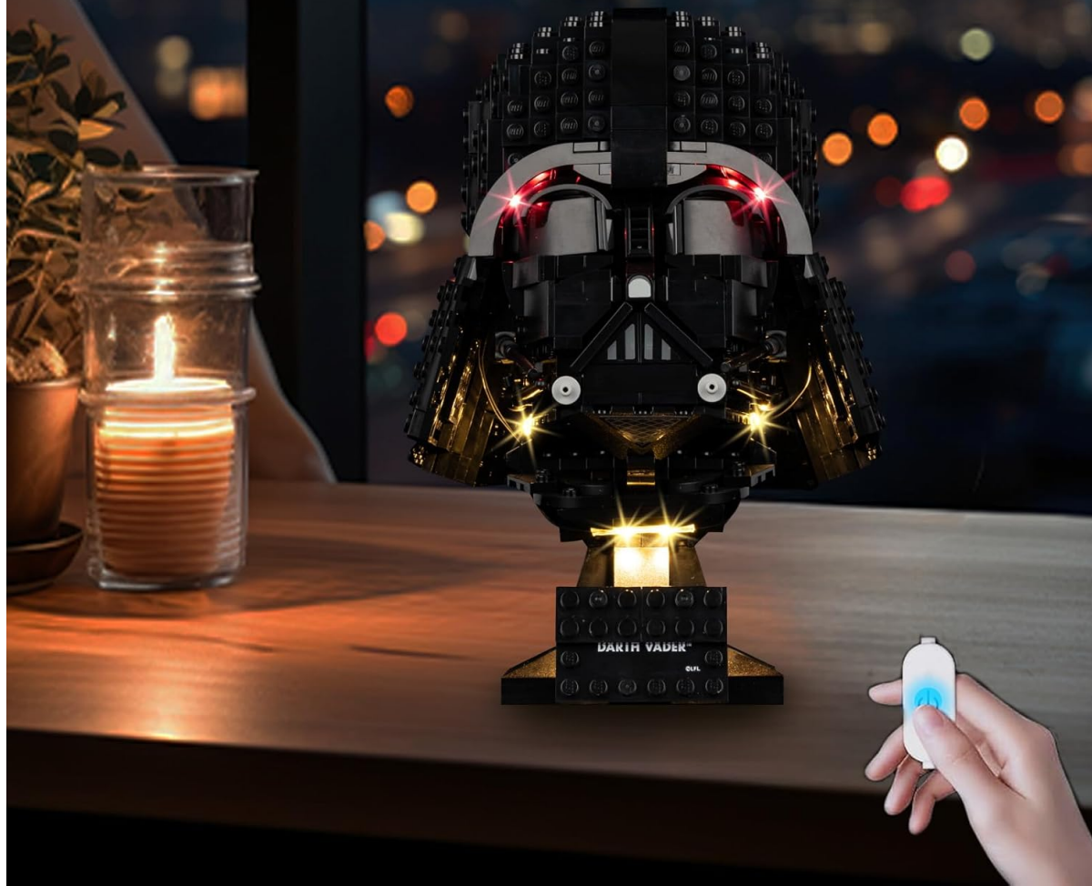
Figure 3.2: The Lego Darth Vader Helmet model illuminated by the BrickSoul LED light kit, displayed in a room at night, demonstrating its visual impact.