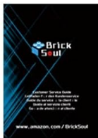
Instructions for Use