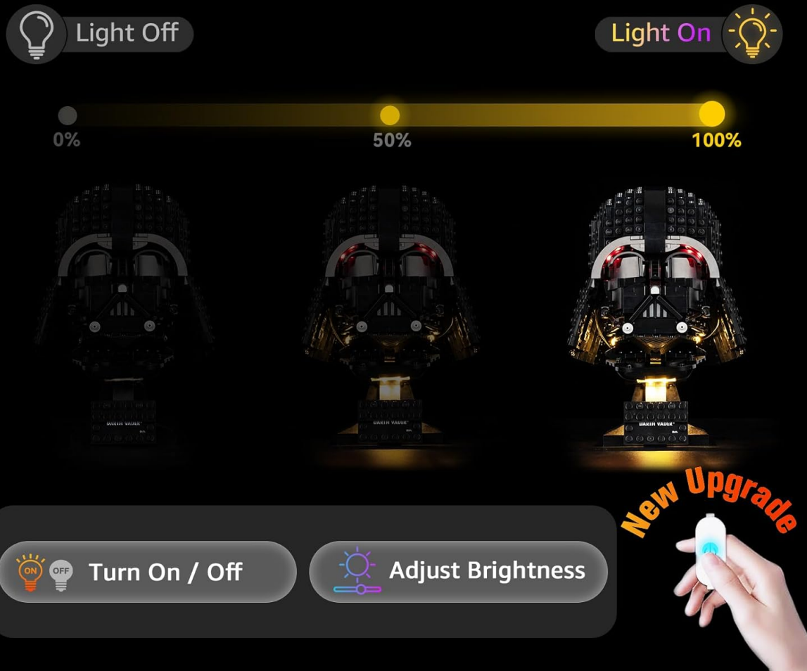
Figure 4.1: Illustration of the one-touch brightness control feature, demonstrating how to turn lights on/off and adjust intensity using the USB button.