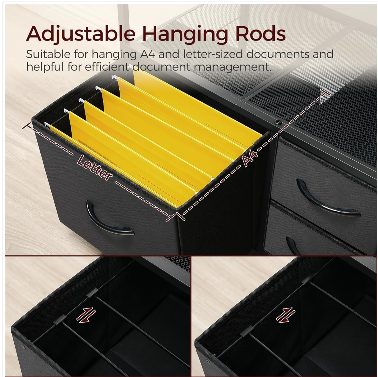
Image 5.1.1: The adjustable hanging rods within a drawer, illustrating compatibility with both A4 and Letter-sized documents for efficient organization.