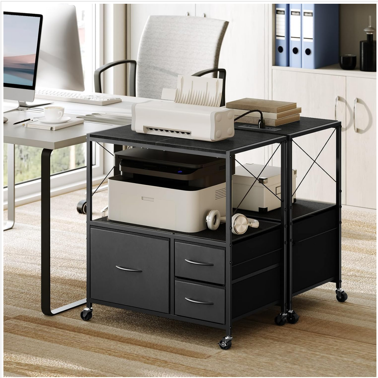
Image 1.1: The MAHANCRIIS File Cabinet and Printer Stand in a typical office environment, showcasing its functionality next to a desk.