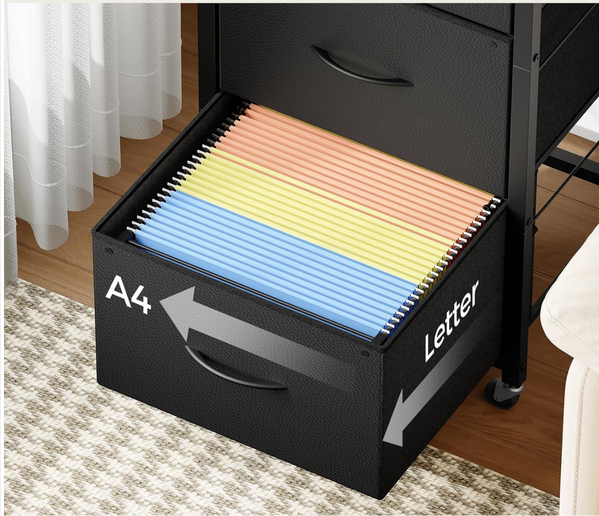
Image 5.1.2: An illustration demonstrating how both A4 and Letter-sized files fit securely within the drawer, highlighting the anti-fall design.

Adjustable hanging rods fit both Letter and A4-sized files.