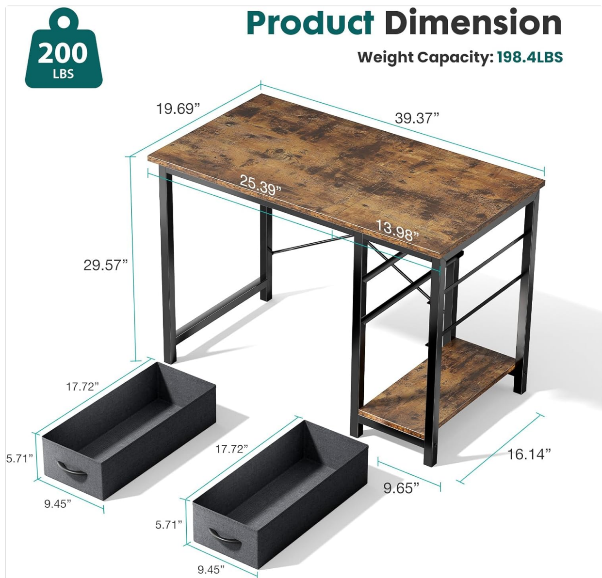
Image 1: Product Dimensions. This diagram illustrates the overall dimensions of the desk (39.4"L x 19.7"W x 29.6"H) and the individual measurements of the fabric drawers and storage shelf, crucial for planning your space and assembly.