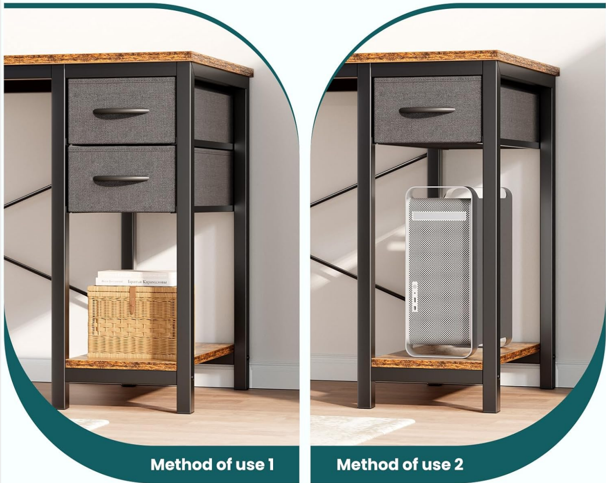
Image 3: Removable Drawer Feature. This illustration demonstrates two configurations for the storage unit. Method 1 shows the two fabric drawers and the lower shelf in place. Method 2 shows one drawer removed to create space for a larger item, such as a computer tower, highlighting the adjustable nature of the storage.