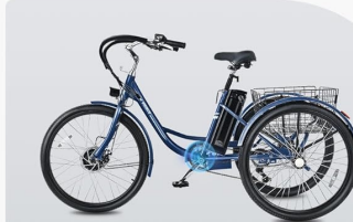
Image: Illustration of the three riding modes: Manual, Pedal Assist, and Throttle, highlighting the versatility of the tricycle.