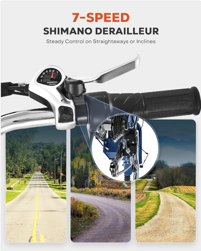
Image: Close-up of the 7-speed Shimano derailleur, indicating its function for adapting to different riding conditions.

The 7-speed Shimano derailleur allows for smooth gear changes, providing steady control on various terrains, including straightaways and inclines.