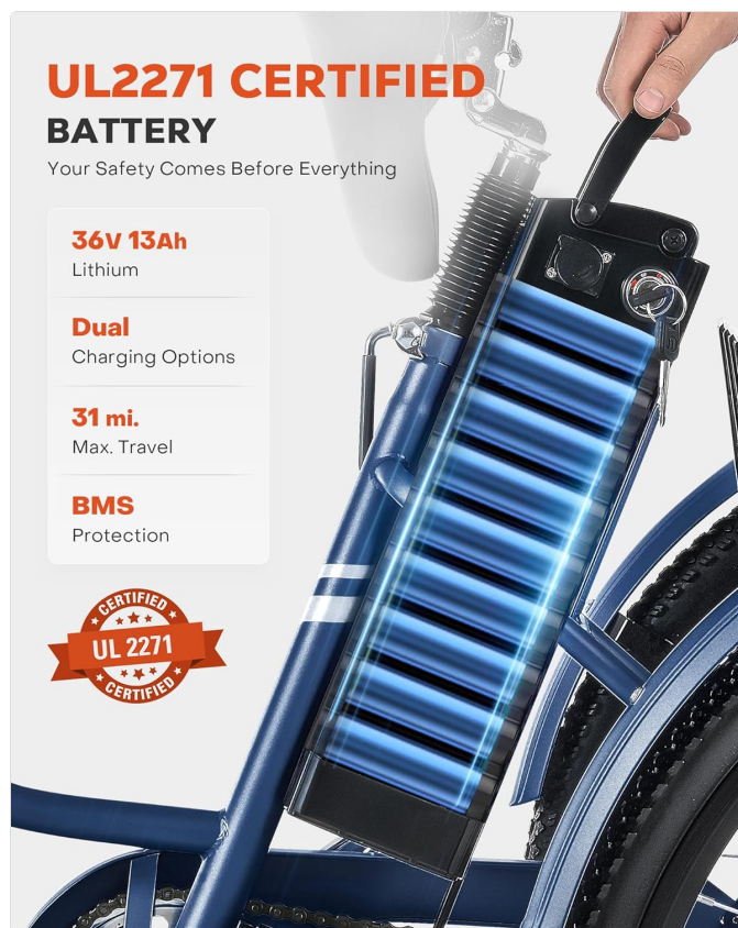
Image: The removable 468Wh battery, UL certified for safety, is easily installed and secured to the tricycle frame.