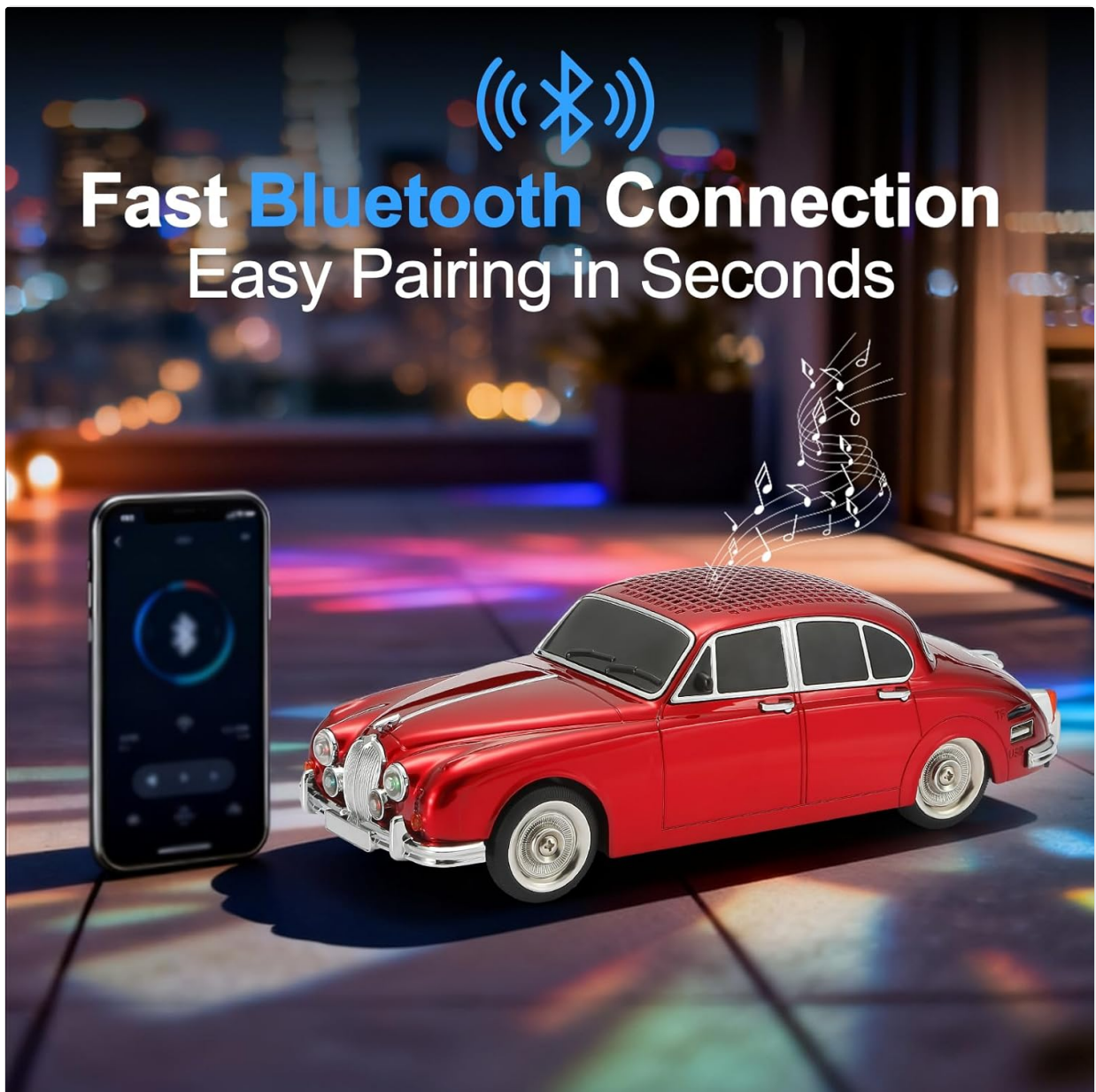
Image: A smartphone displaying Bluetooth settings next to the WS-596 speaker, illustrating the connection process.