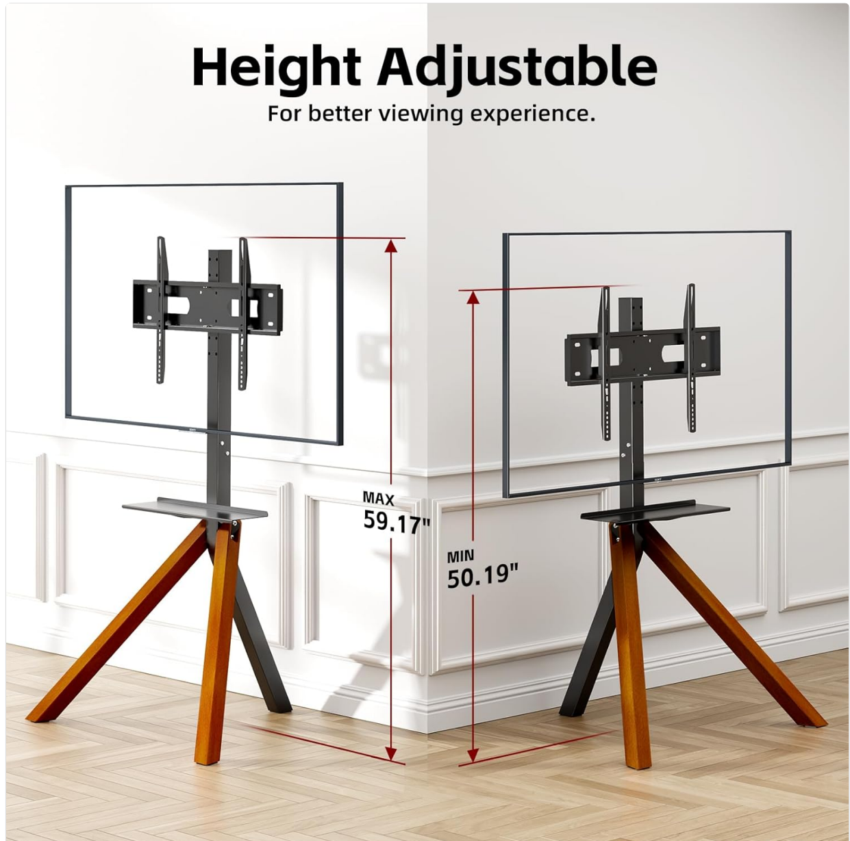
Image: A visual representation showing the minimum (50.19 inches) and maximum (59.17 inches) height adjustments for the TV screen on the stand.

The TV mounting brackets can be adjusted vertically along the central column to achieve your preferred viewing height. Loosen the securing screws on the brackets, slide the TV to the desired position, and then re-tighten the screws firmly.