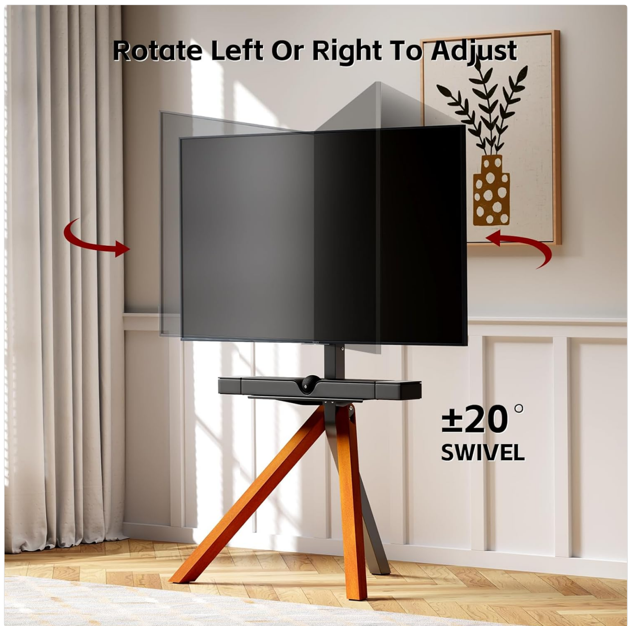
Image: The TV stand allows for a \pm 20^\circ swivel, enabling flexible viewing angles to suit different seating arrangements.