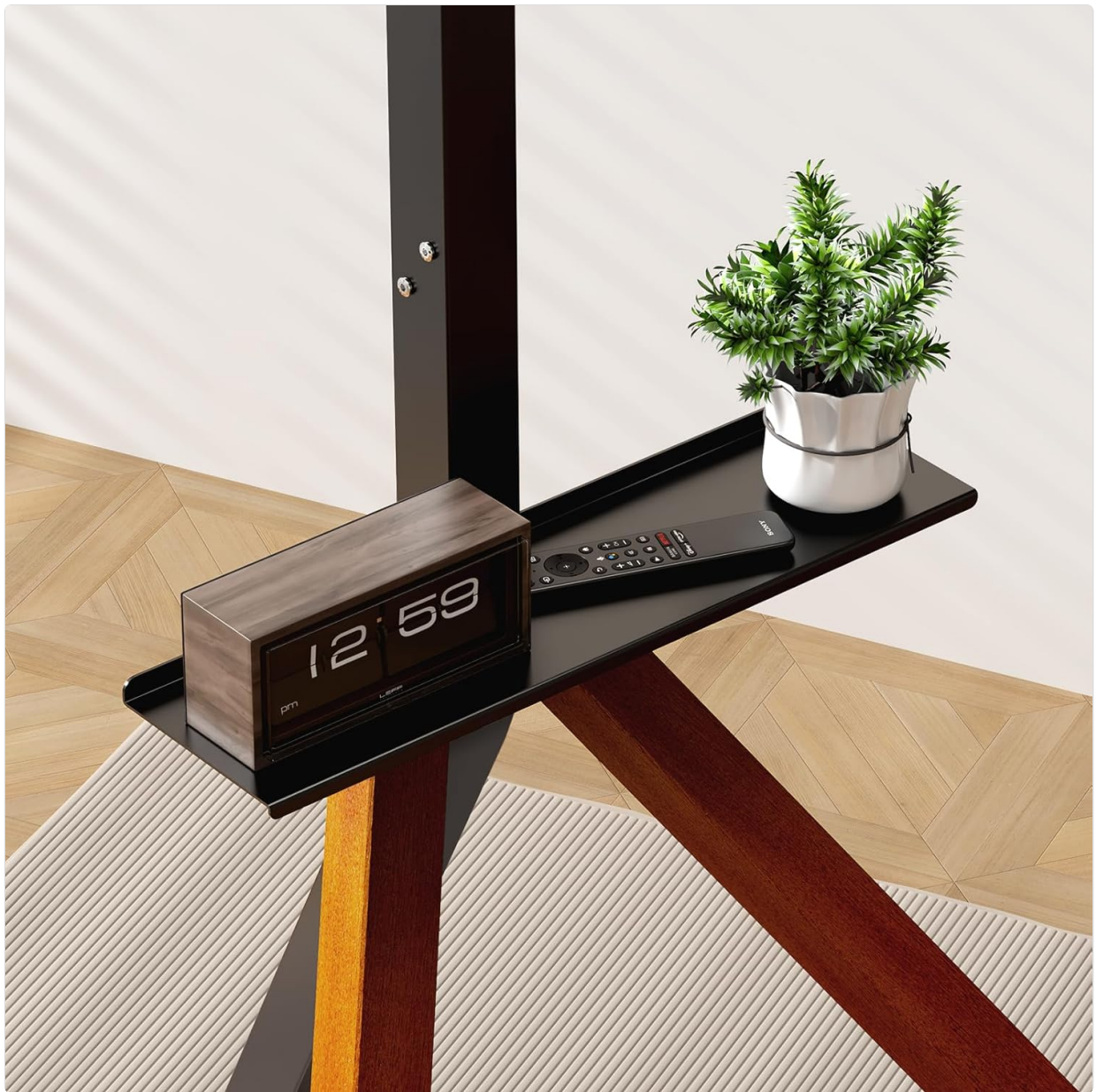
Image: The soundbar shelf is securely attached to the central column, providing a stable platform for media devices.