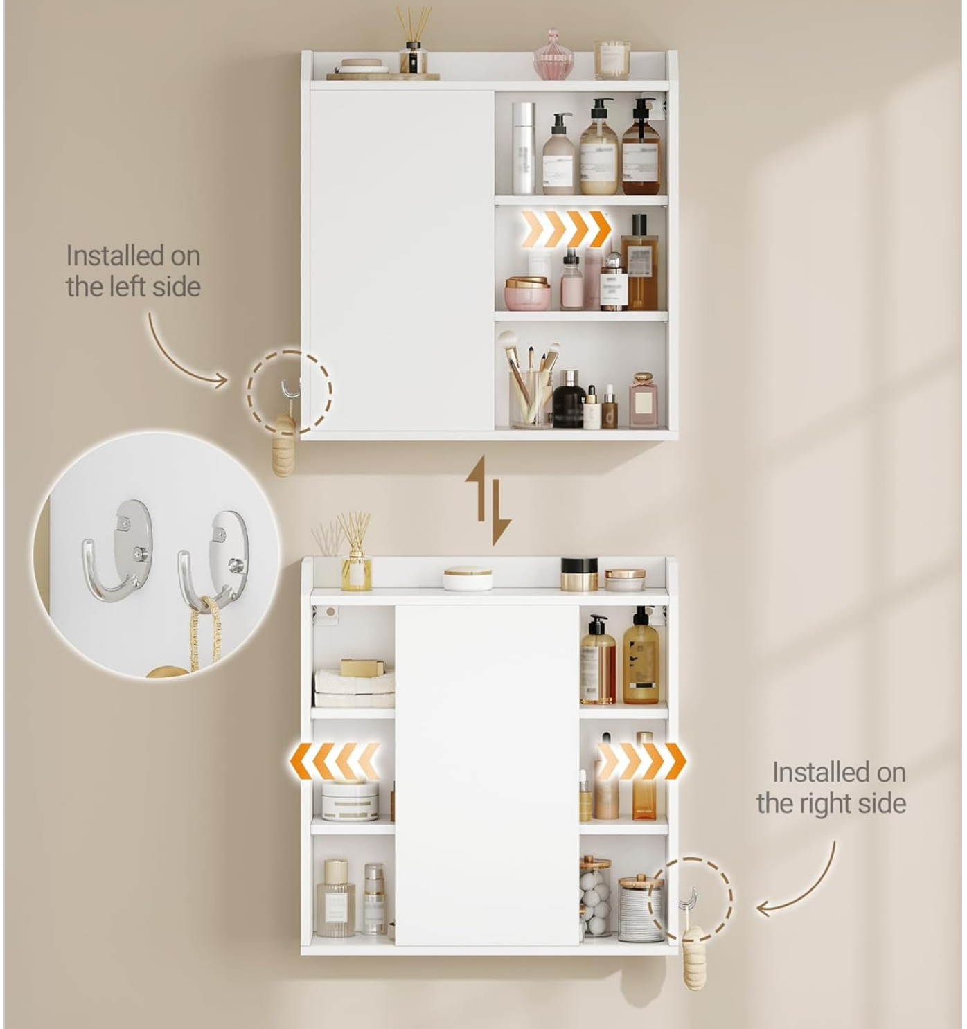
Figure 4: Adjustable Shelf Positions

Swap left-right layout for sliding doors