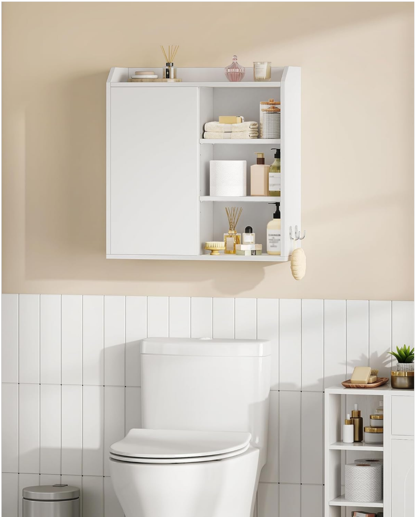
Figure 1: Product Dimensions (60 x 20 x 60 cm)