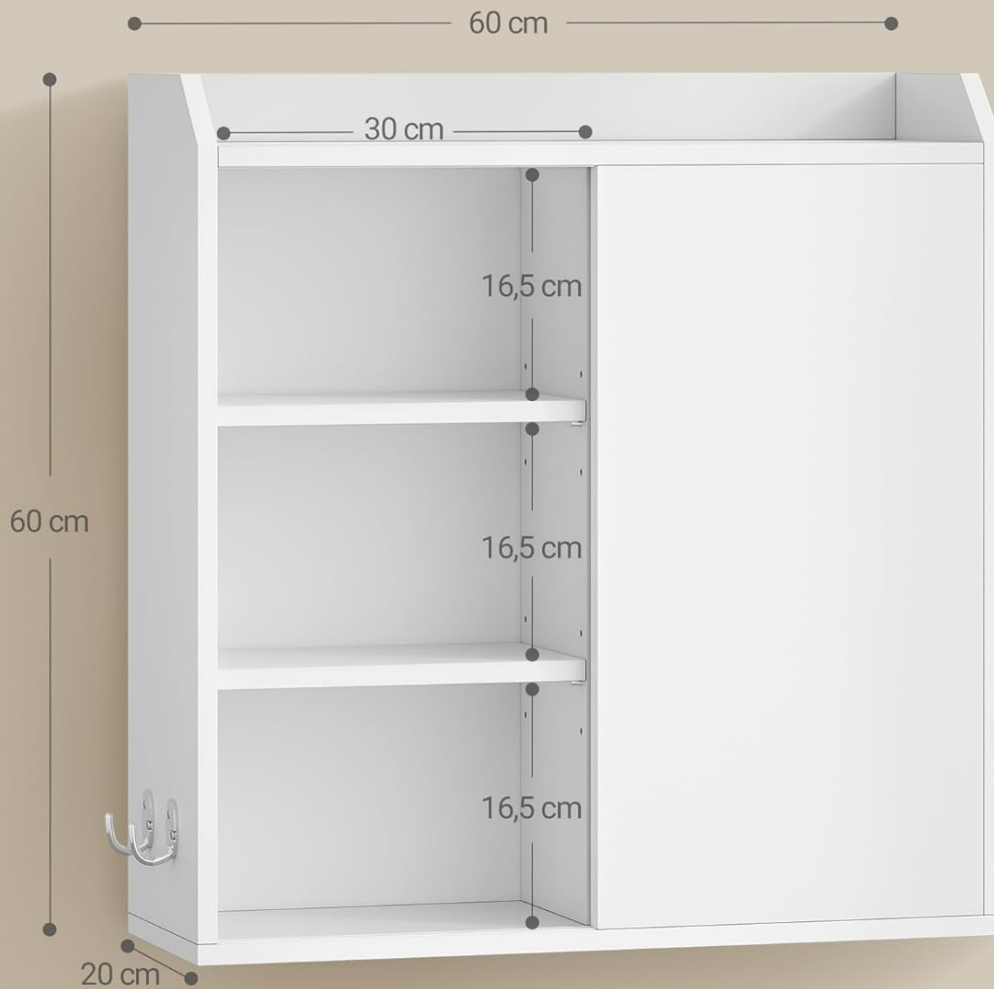
Figure 3: Flexible Sliding Door Placement