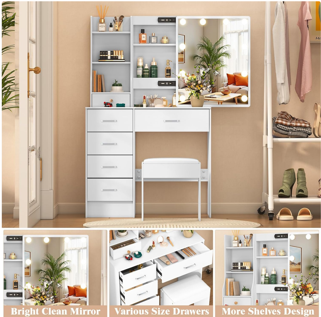
Image 5.2: Vanity desk showcasing open mirror and drawers for smart storage.

Utilize the 6 spacious drawers and 6 open shelves to organize your cosmetics, skincare products, jewelry, and other items. The drawers are equipped with smooth-gliding mechanisms for easy access.