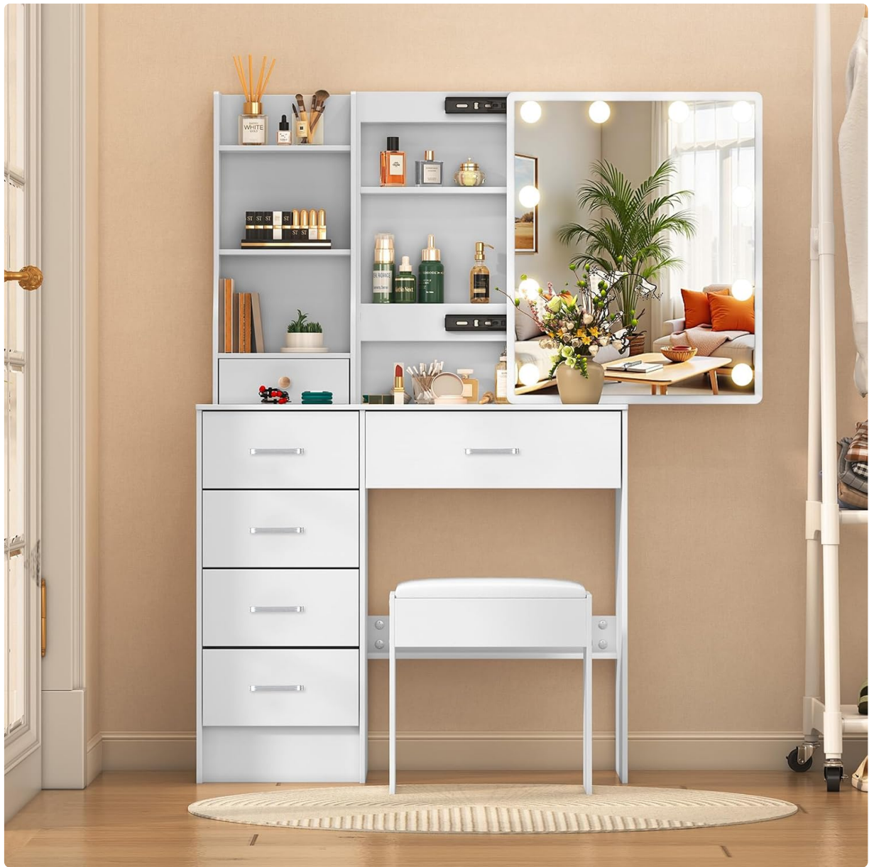
Image 1.1: Guanglai H1907-AB Vanity Desk with sliding mirror, lights, and chair.