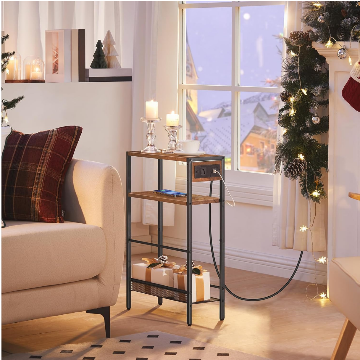
Image: The HOOBRO narrow side table with charging station, showcasing its compact design and functionality in a living room setting.