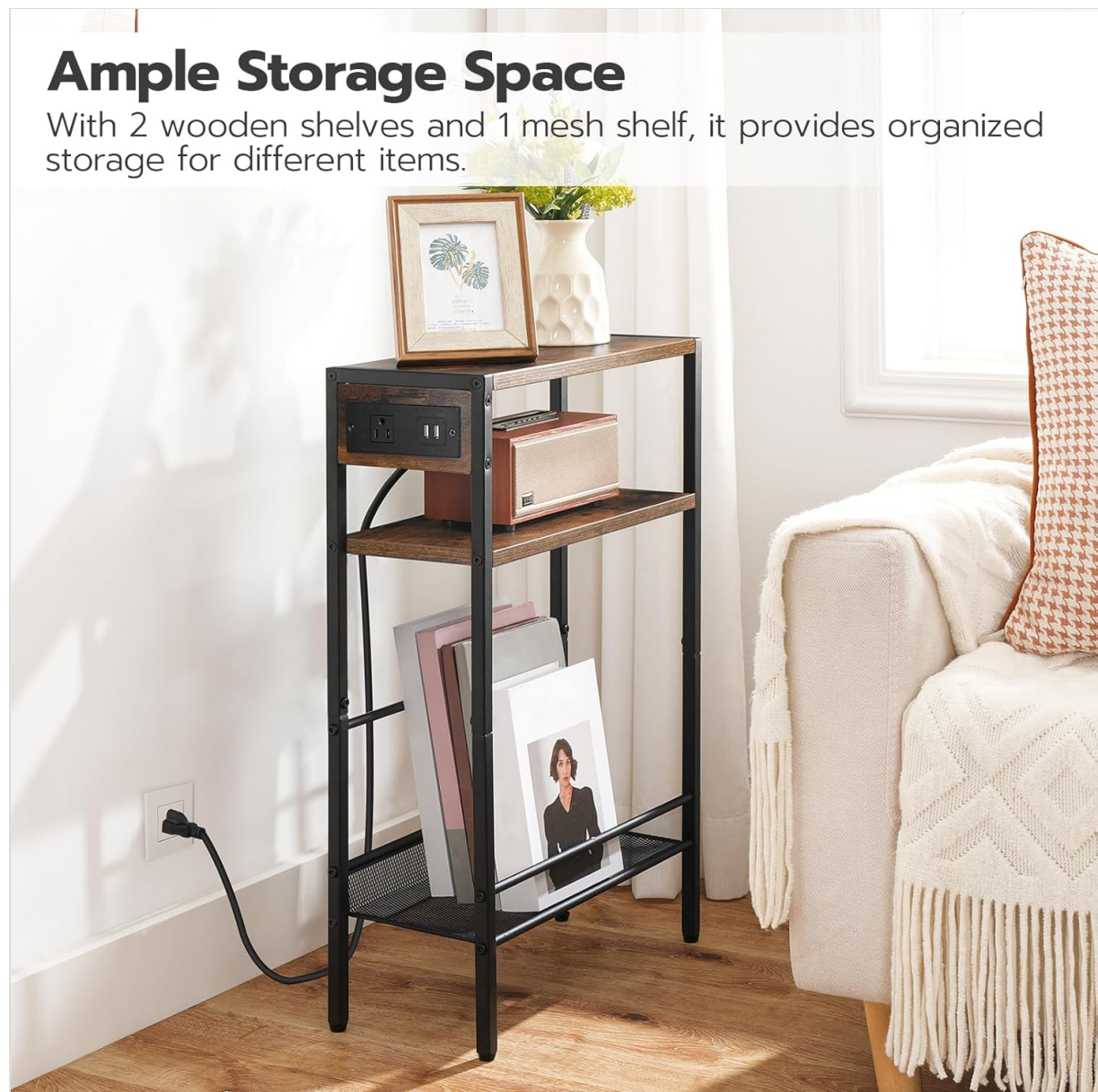
Image: The side table demonstrating its ample storage capacity with various items neatly organized on its shelves.