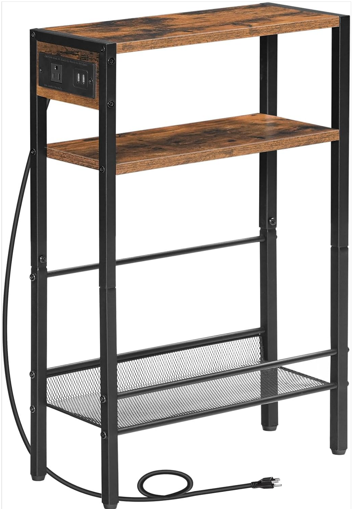
Image: A detailed view of the side table's structure, highlighting the integrated charging station and shelf design.