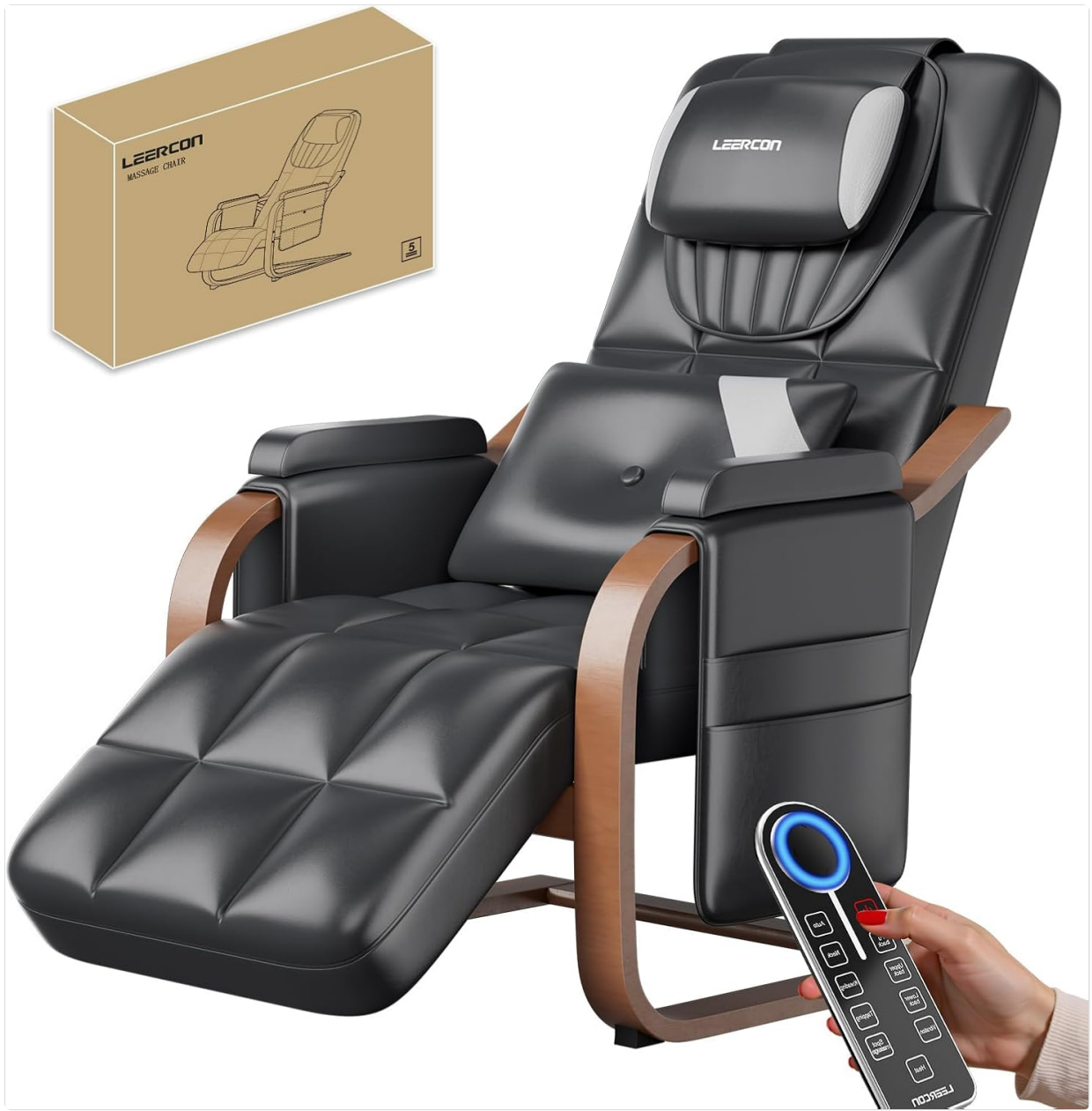
Figure 1: LEERCON Massage Chair with remote control.