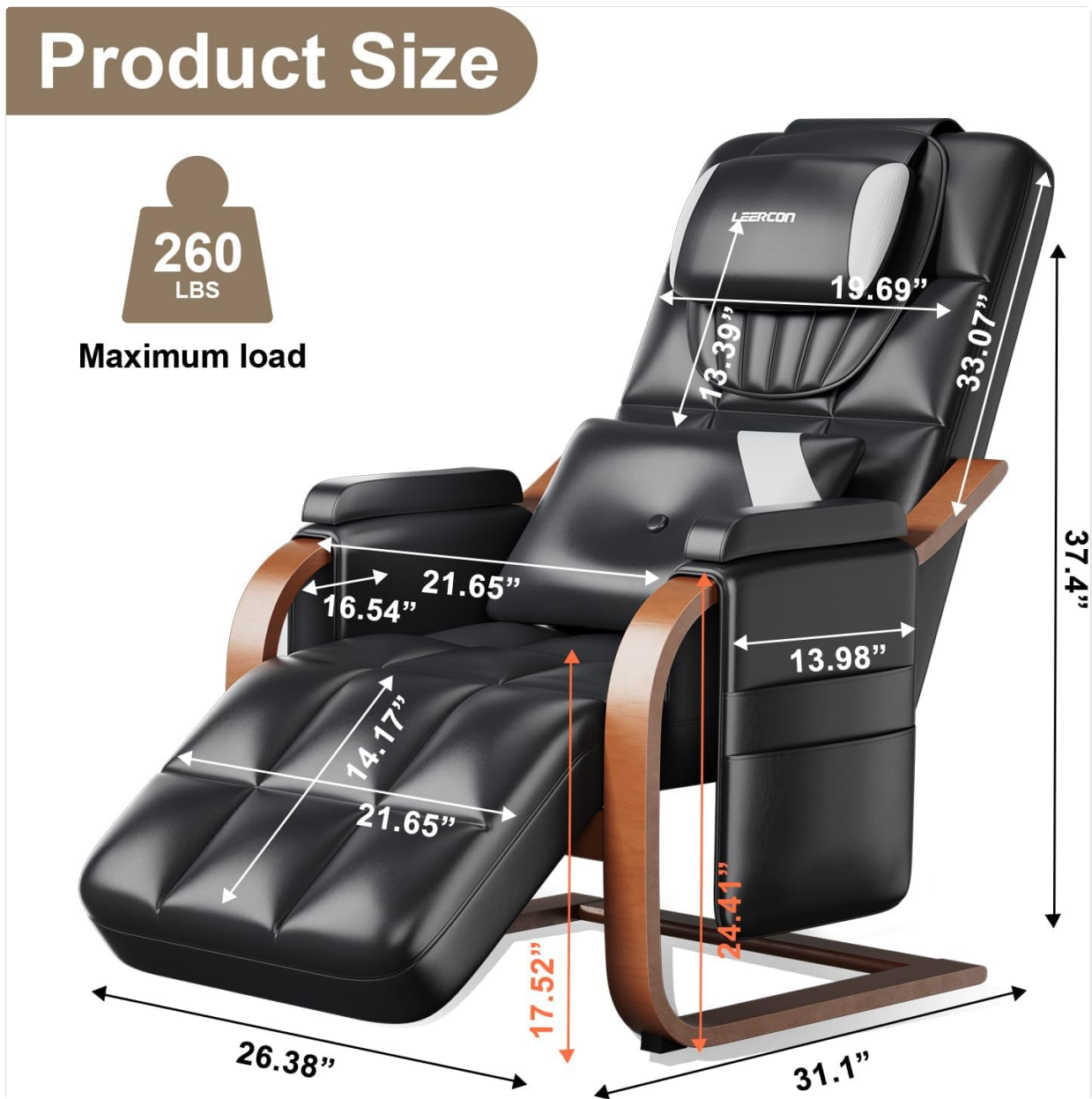
Figure 2: Product dimensions and maximum load capacity (260 lbs).