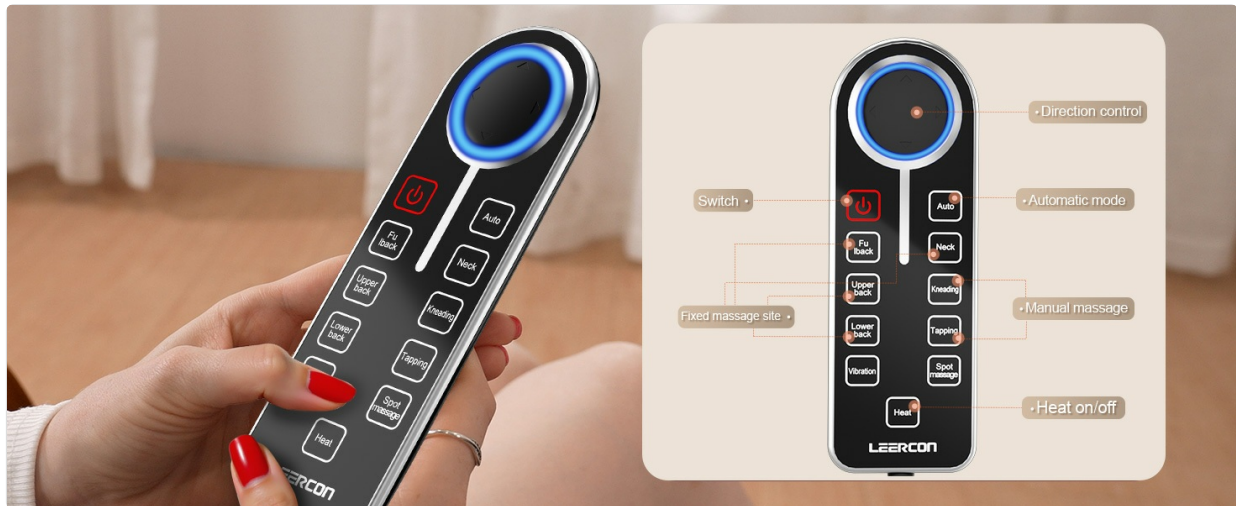
Figure 6: Intelligent Controller layout and functions.

The remote control allows you to select various massage modes, adjust intensity, and control reclining positions.