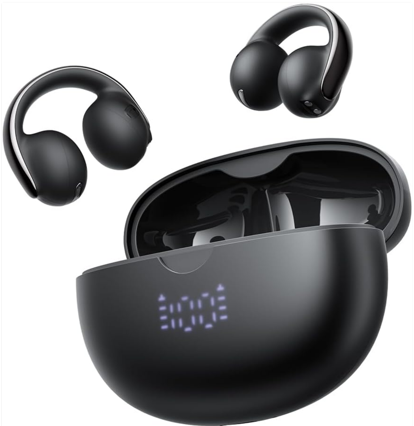
Image: Yamdrok Y1 Lite Open Ear Headphones shown with their charging case. The earbuds feature a unique open-ear design, and the case has a digital display for battery status.