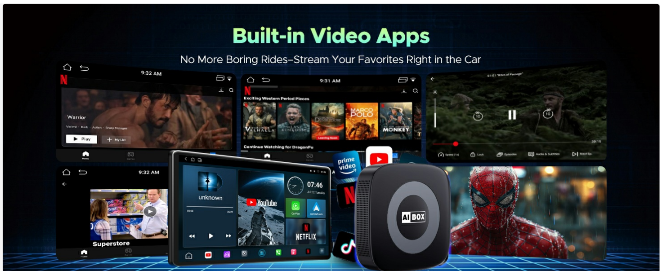
Figure 2.1: The WhyBox Wireless CarPlay AI Box interface, demonstrating access to multiple streaming applications.