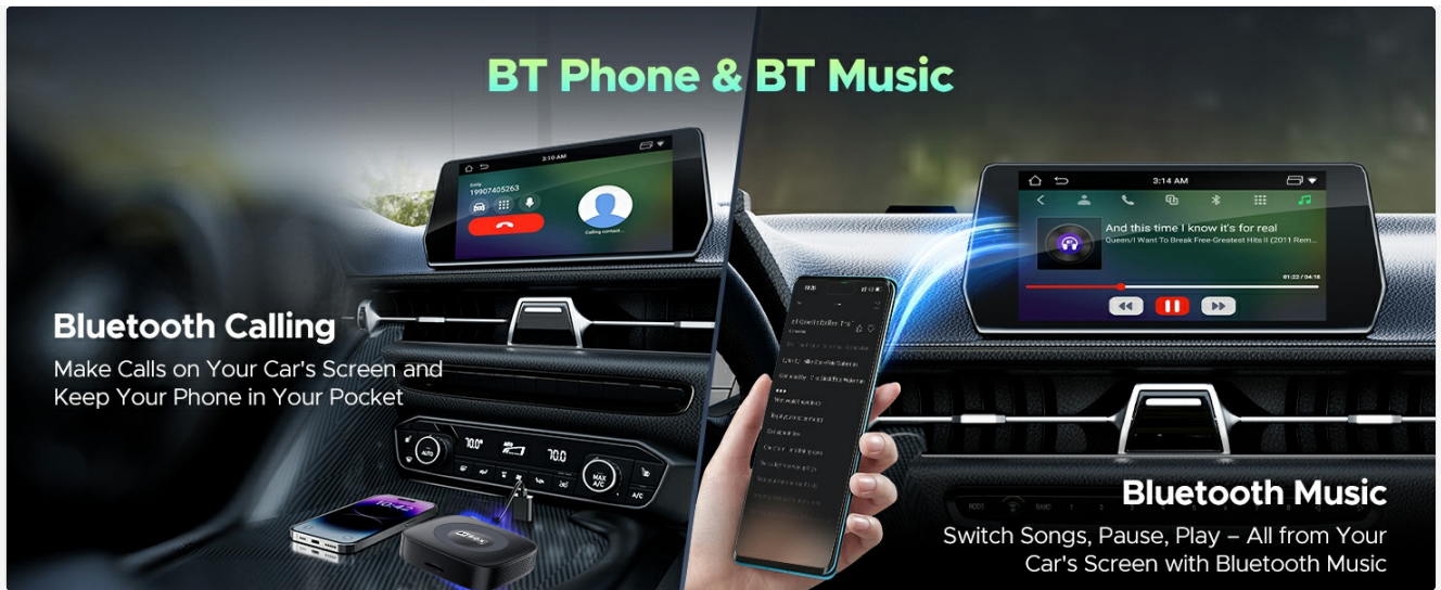
Figure 5.5: Bluetooth phone and music functionality through the AI Box.