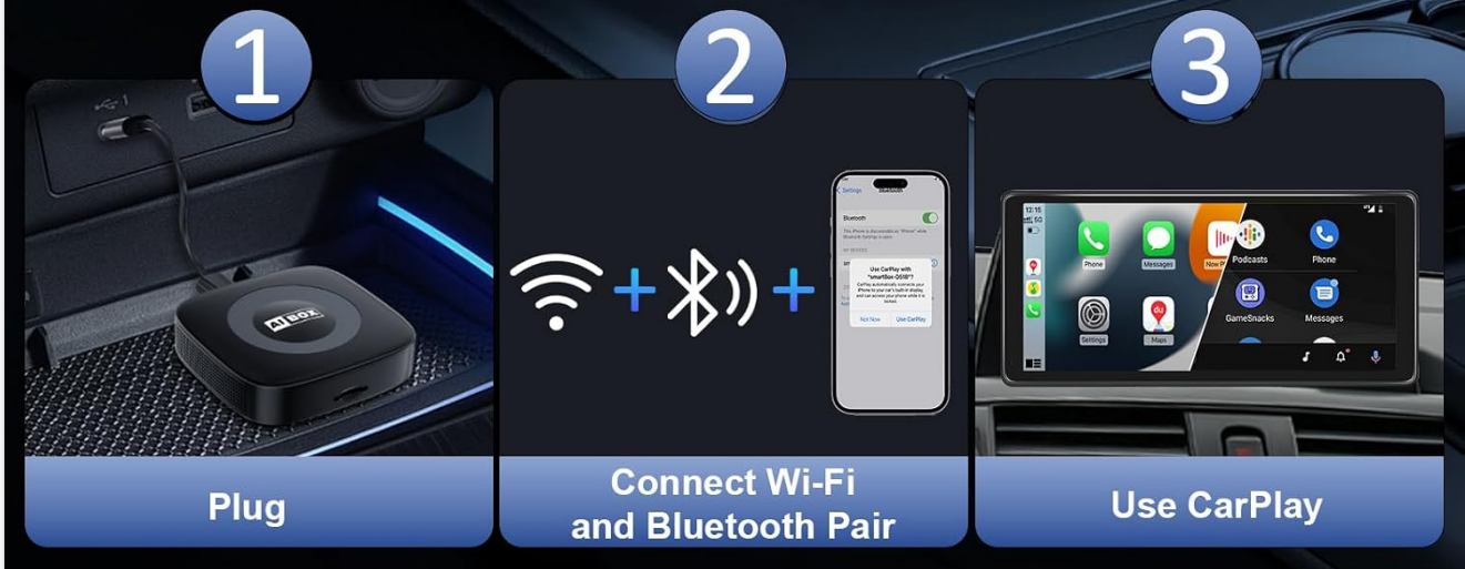
Figure 4.1: Step-by-step guide for connecting the WhyBox AI Box to your vehicle.