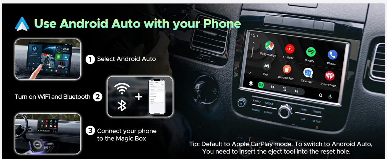
Figure 5.2: Steps for connecting and using Android Auto wirelessly.