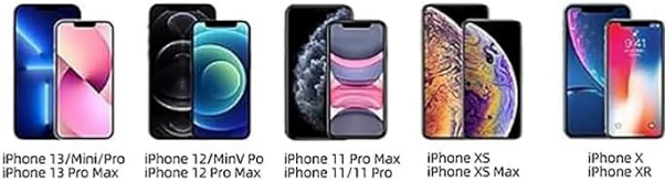
iPhone 13/Mini/Pro iPhone 13 Pro Max iPhone 12/Mini/Pro iPhone 12 Pro Max iPhone 11 Pro Max iPhone 11/11 Pro iPhone XS iPhone XS Max iPhone X iPhone XR

This product is suitable for 98% of the models in the market, and the mobile phone needs to be iPhone8 or above the system iOS 10.0 or above