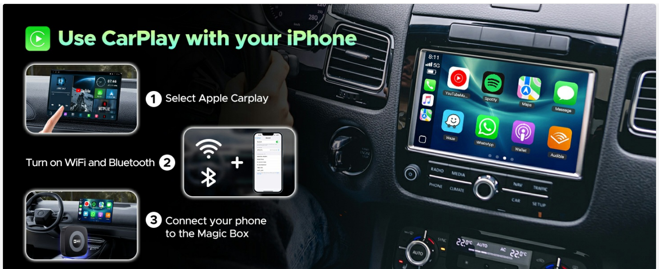
Figure 5.1: Steps for connecting and using Apple CarPlay wirelessly.