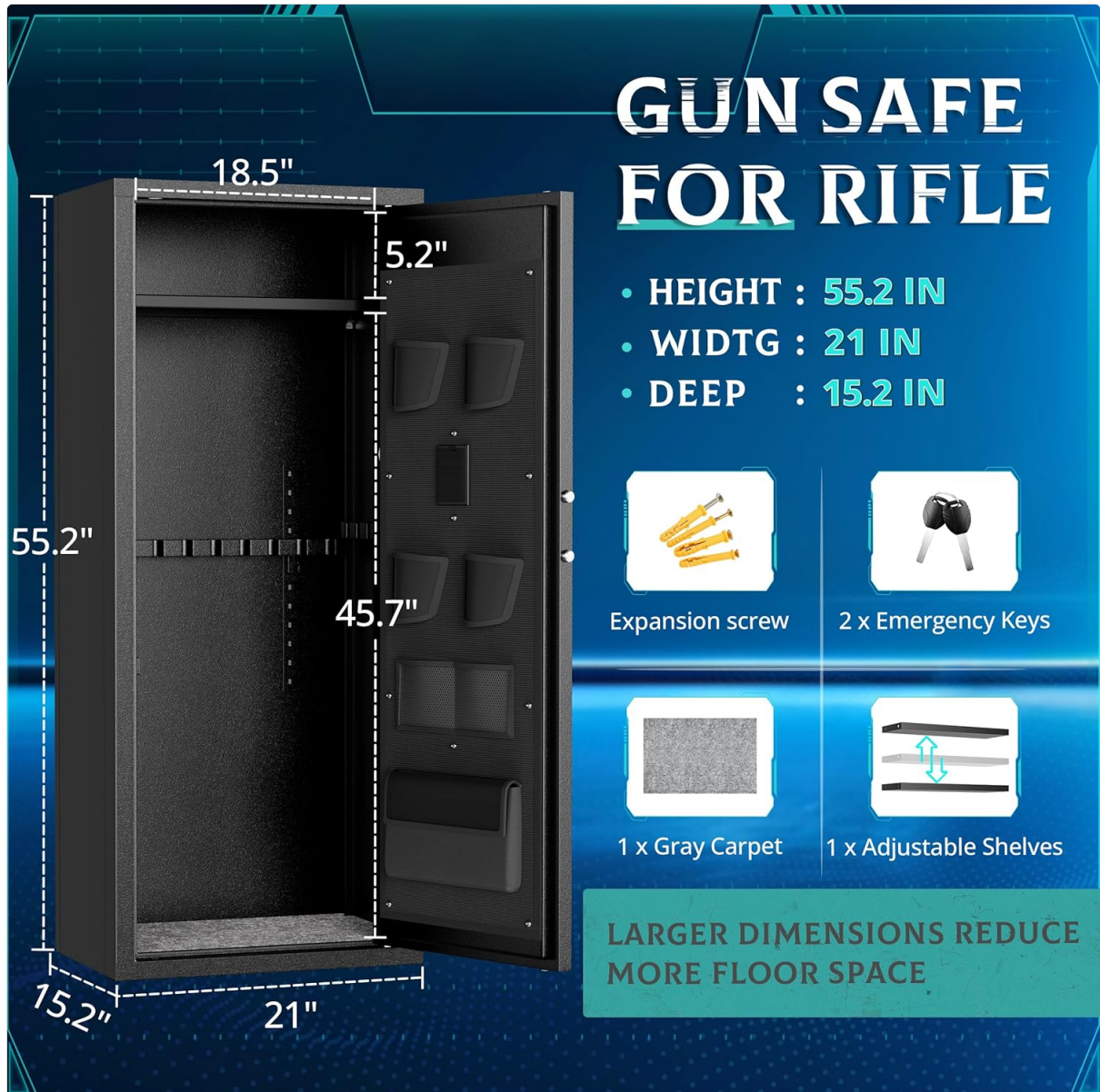
Image: Overview of the SUNCROWN Gun Safe, showing its dimensions and the included accessories such as expansion screws, emergency keys, gray carpet, and an adjustable shelf.