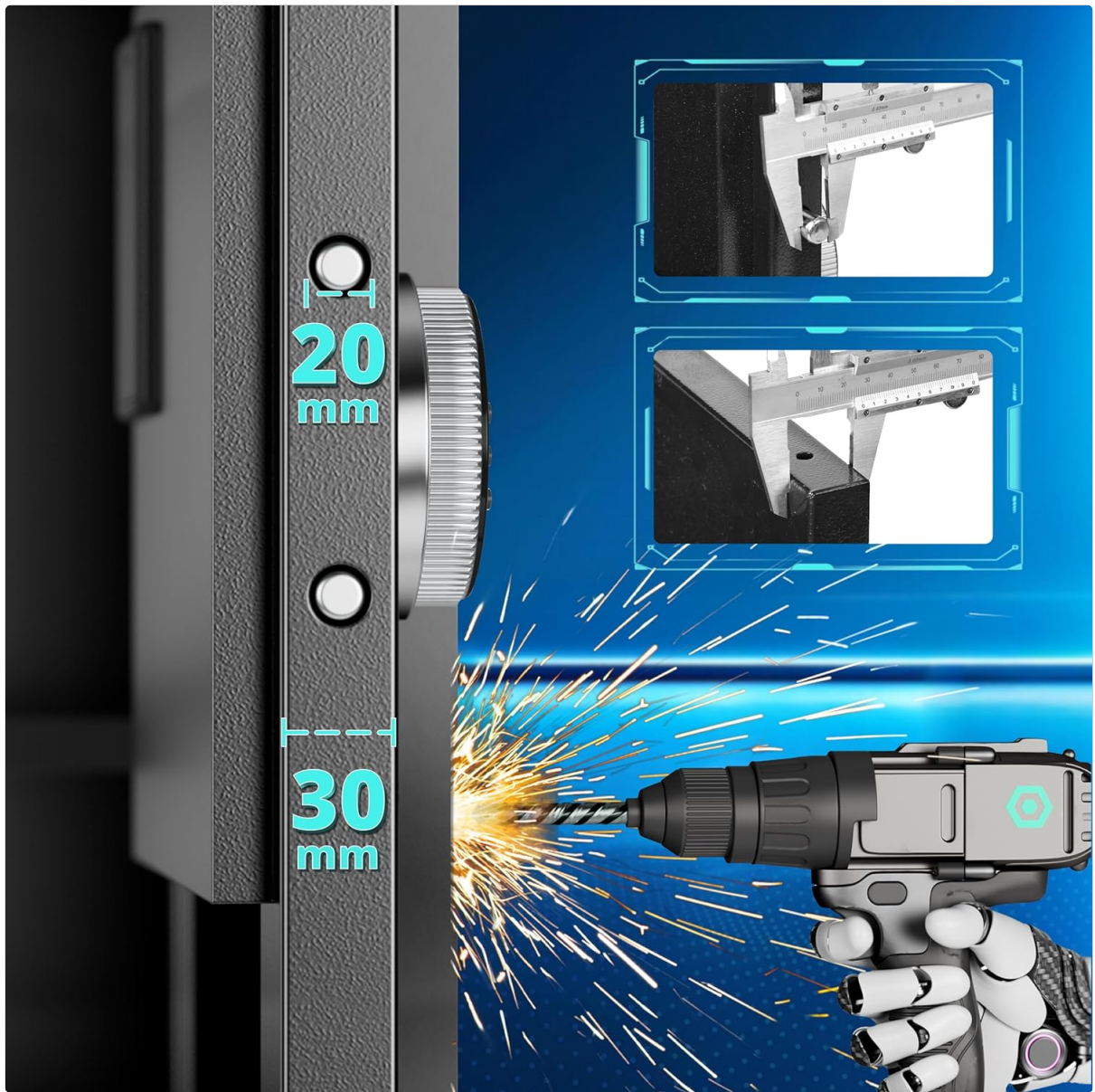
Image: A close-up view highlighting the robust door thickness (20mm and 30mm) of the SUNCROWN Gun Safe, demonstrating its drill-resistant construction.