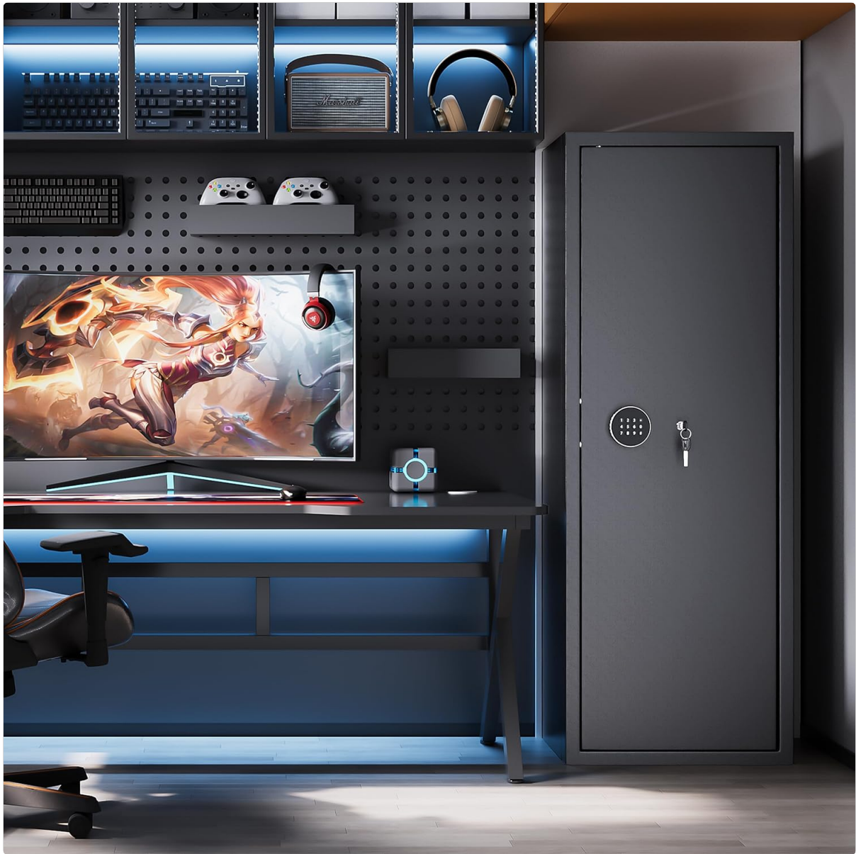
Image: The SUNCROWN Gun Safe positioned in a modern home office or gaming room, illustrating its compact design for various indoor environments.