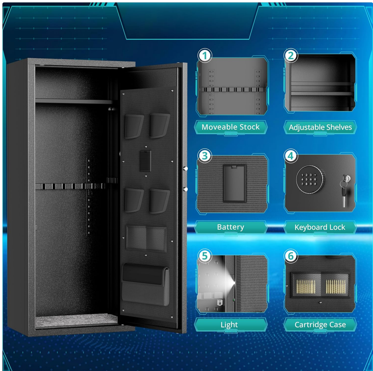
Image: A detailed view of the SUNCROWN Gun Safe's interior, labeling key components such as the moveable stock, adjustable shelves, battery compartment, keyboard lock, internal light, and cartridge case.