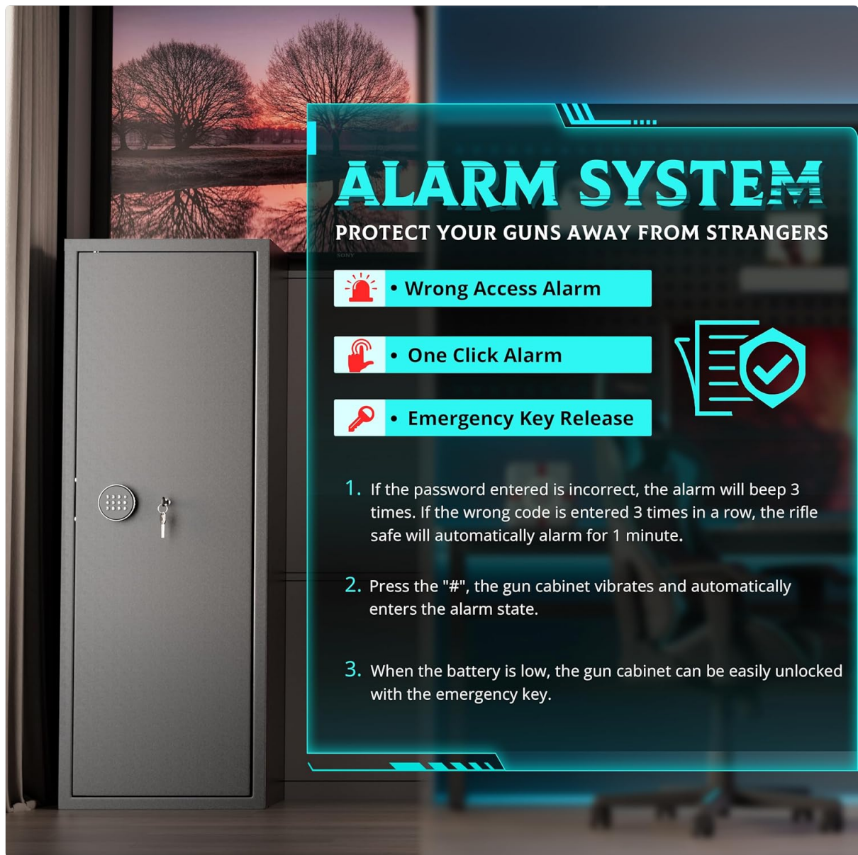
Image: A visual representation of the SUNCROWN Gun Safe's alarm system, detailing features like wrong access alarm, one-click alarm, and emergency key release.