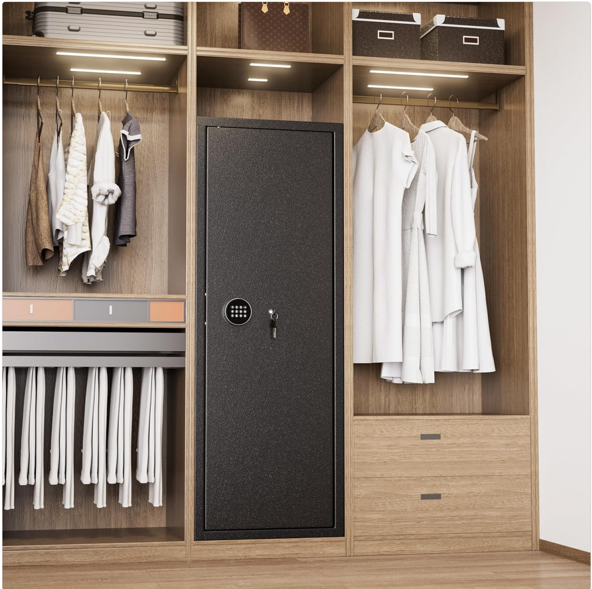
Image: The SUNCROWN Gun Safe discreetly placed inside a wooden closet, demonstrating a potential secure installation location.