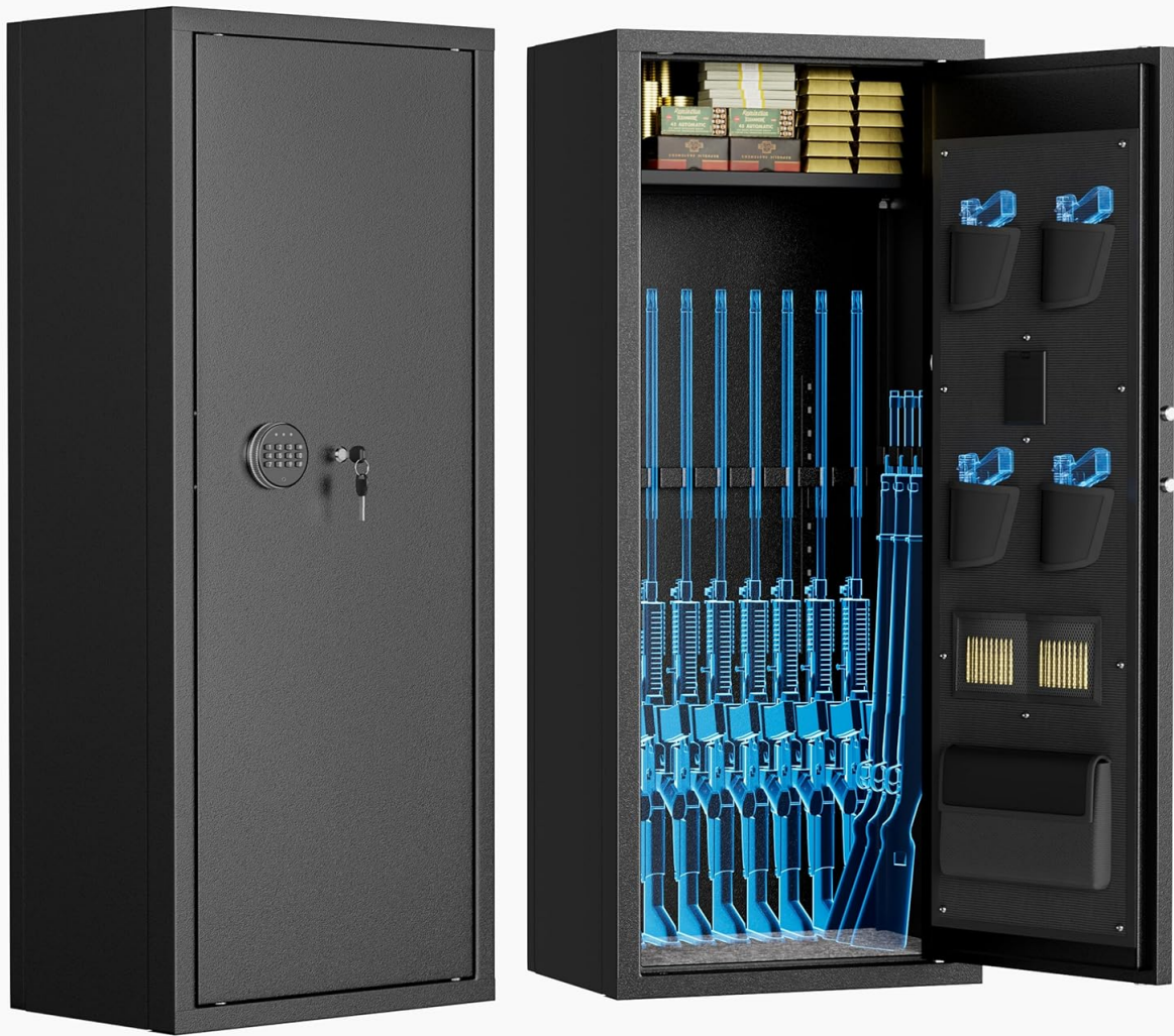
Image: The SUNCROWN Gun Safe shown from the exterior (closed) and with the door open, revealing the interior storage layout for rifles and pistols.