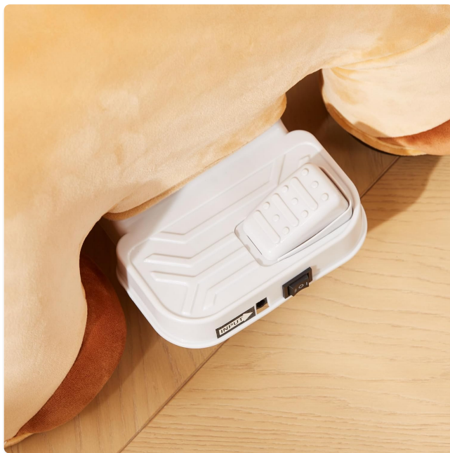
Figure 3: Pedal and control panel detail.