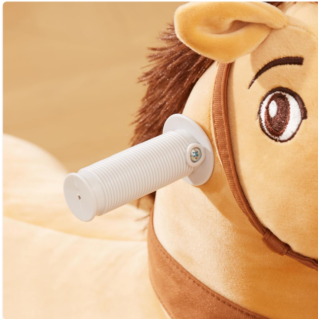
Figure 2: Handlebar attachment detail.