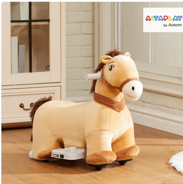
Figure 1: General view of the AIYAPLAY Electric Ride-On Horse.