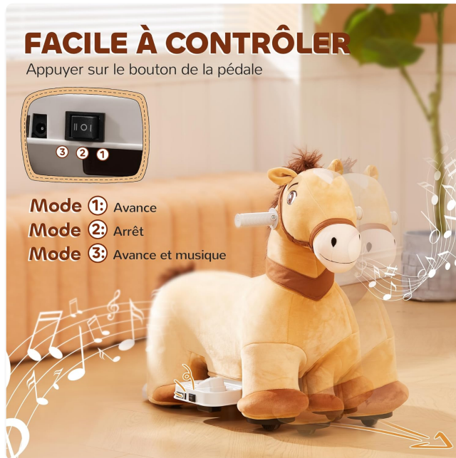
Figure 4: Control panel showing different modes (forward, stop, music).