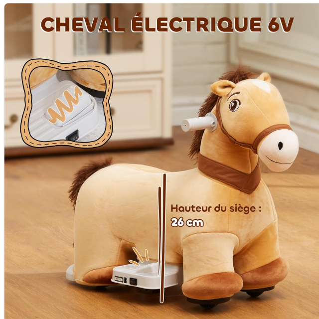
Figure 5: Seat height measurement.