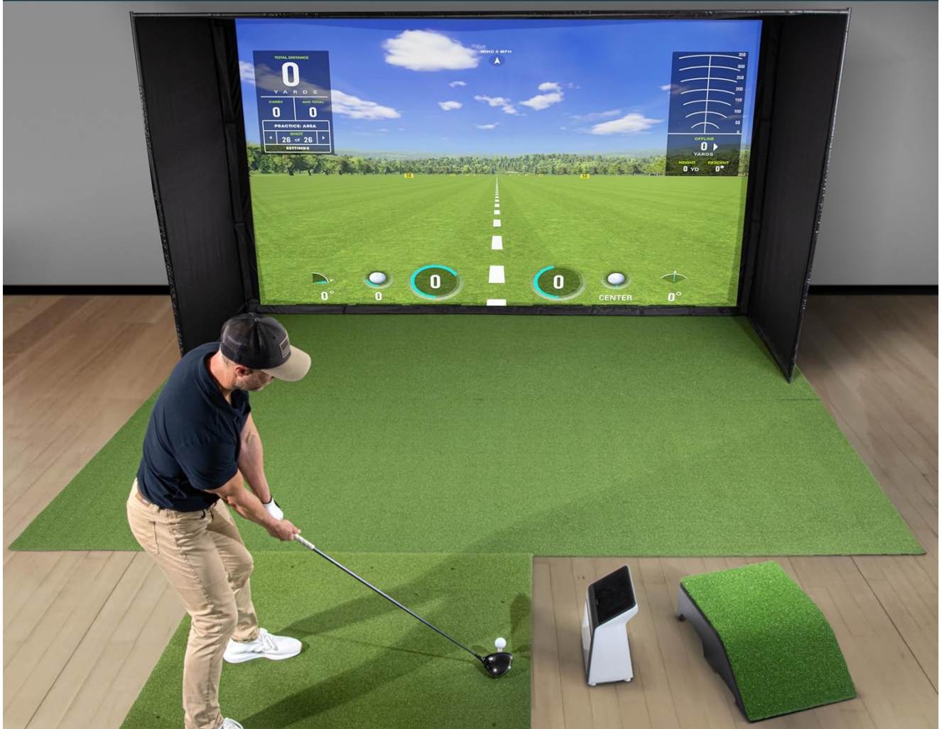
Image 5.1: Professional Practice Setup. This image features a golfer standing on the GoSports Golf Simulator Turf, positioned within a home golf simulator. The turf provides a clean, professional aesthetic to the practice area.