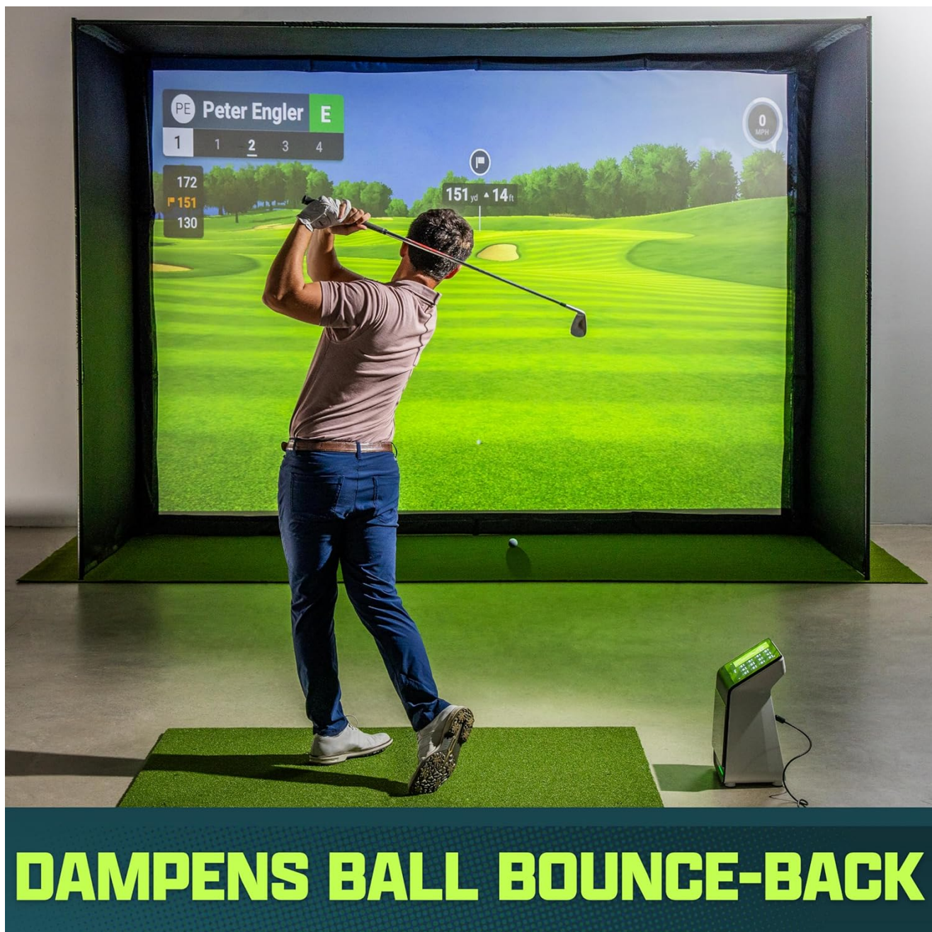
Image 5.2: Ball Dampening Feature. This image captures a golfer in the process of swinging a club on the GoSports Golf Simulator Turf. The turf is designed to absorb impact and reduce ball bounce-back, enhancing safety and realism during practice.