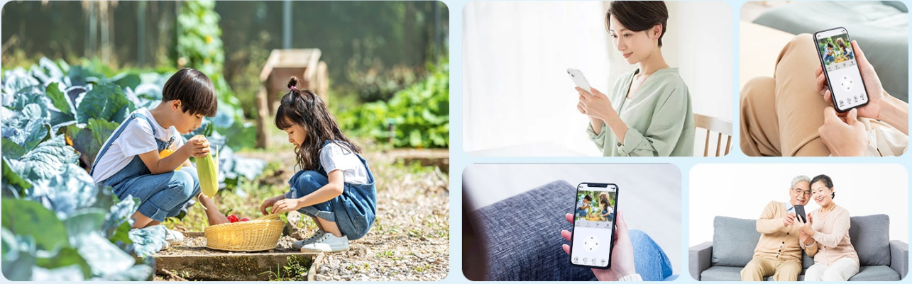
Image: A smartphone displaying the live camera feed with controls for 355° pan and 90° tilt.

いつでもどこでもカメラにアクセスし、家族と同時にリアルタイムビューを共有します。