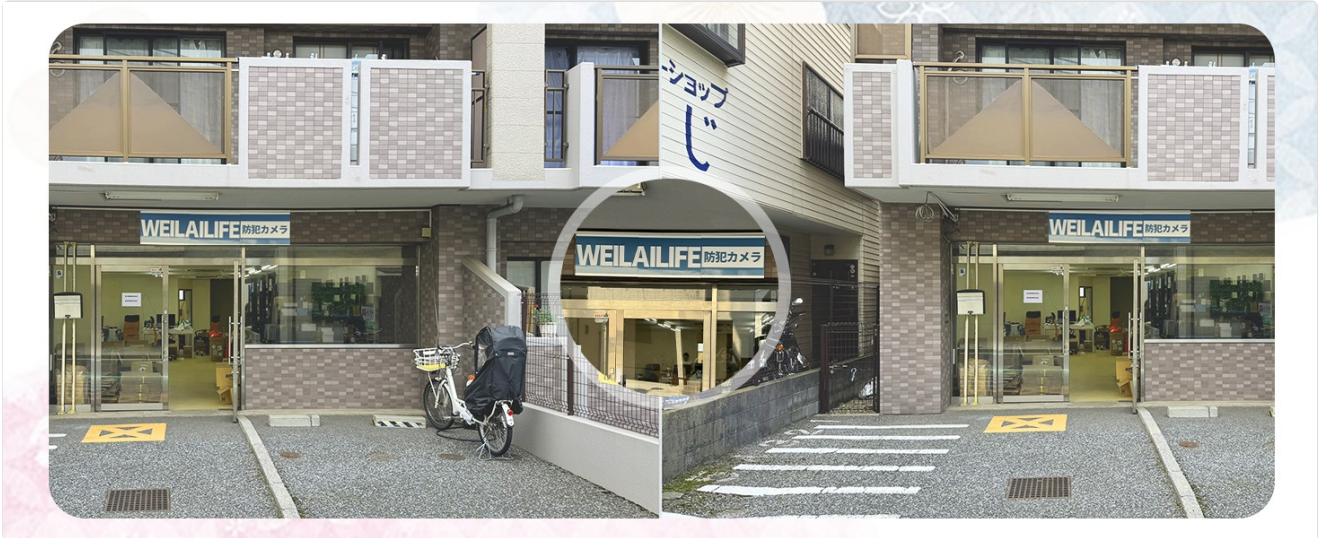
Image: Comparison illustrating the wider surveillance area of a dual-lens camera compared to a single-lens camera.