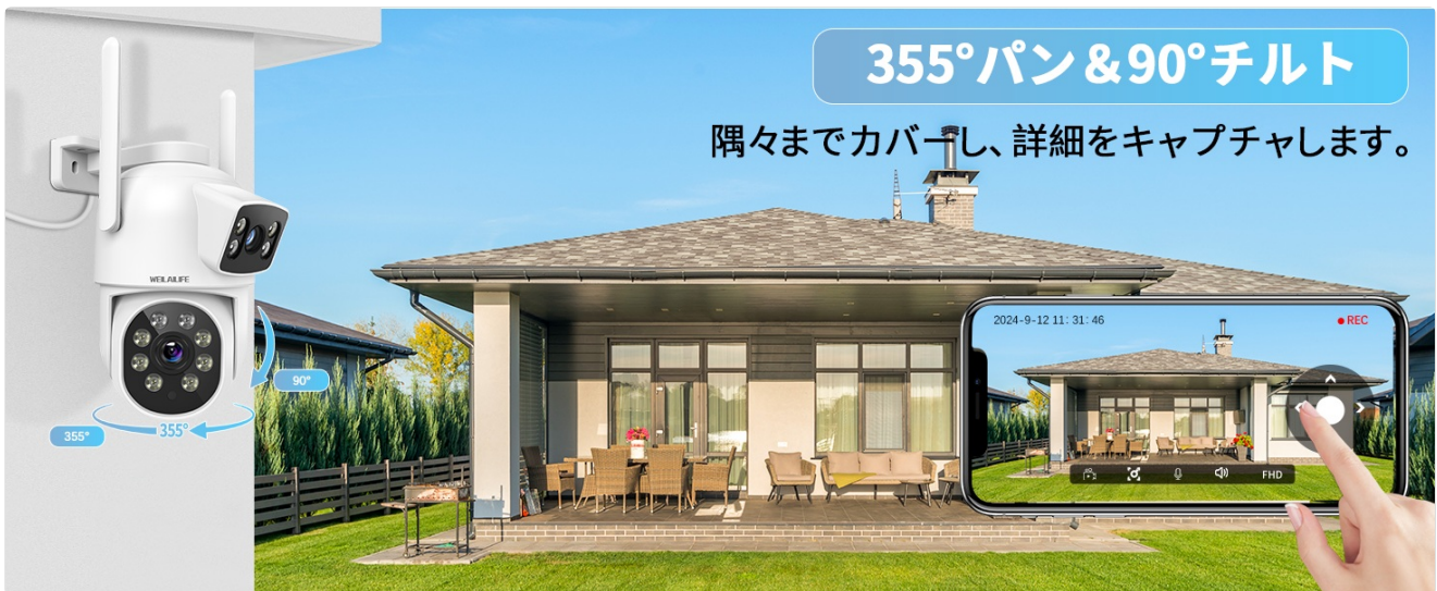
Image: The dual-lens camera demonstrating its 355-degree pan and 90-degree tilt capabilities.