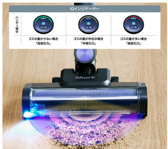
The iQ indicator on the vacuum head visually communicates the amount of dust detected, with different light patterns for low, medium, and high debris levels.