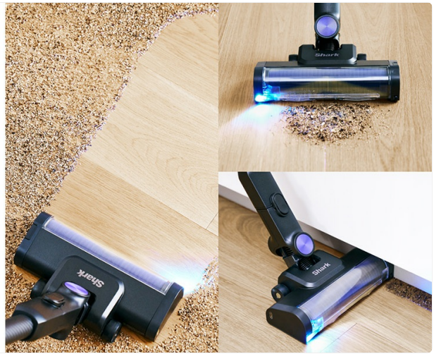
This image illustrates the vacuum's 360-degree cleaning capability, showing how it picks up debris from both forward and backward movements.