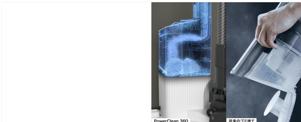
An internal diagram illustrating the automatic dust collection mechanism, showing how debris is efficiently transferred from the vacuum's dust cup to the sealed bag in the dock.