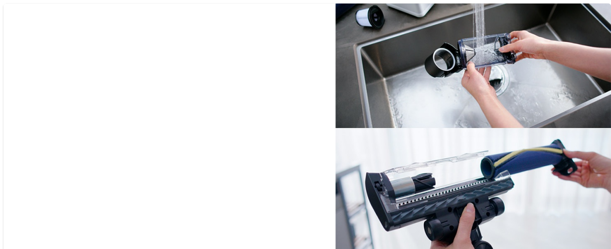
Instructions for cleaning: a person is shown rinsing the dust cup and filter under running water, and another image shows the easy removal of the brush roll for maintenance.