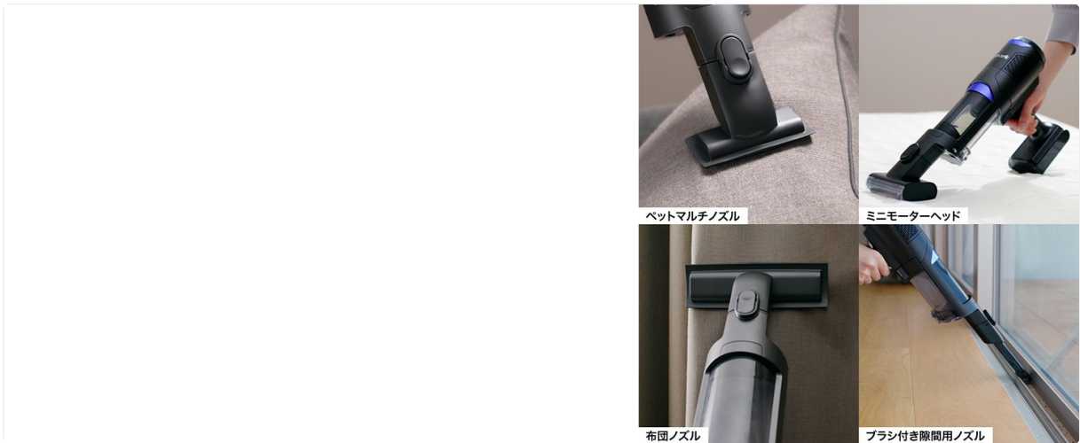
A collage showcasing the different accessories included: the pet multi-tool, mini motorhead, futon nozzle, and brush crevice tool, designed for versatile cleaning.