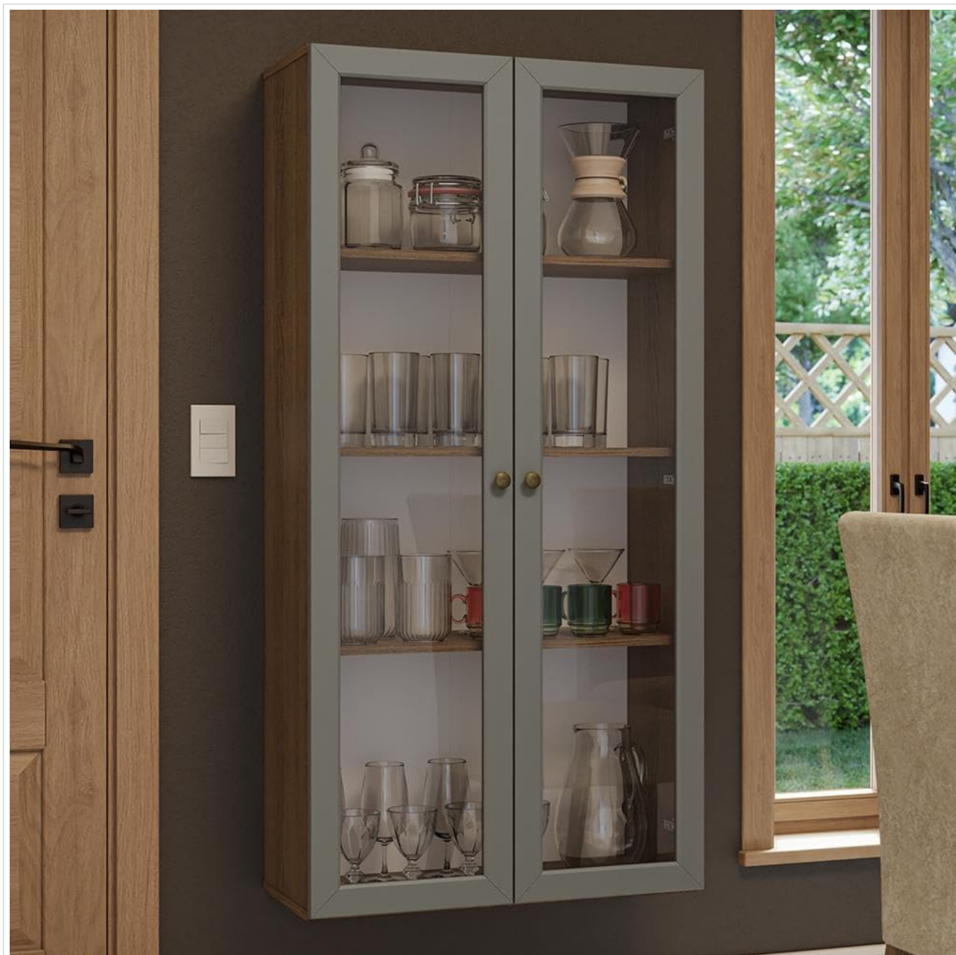
Image: The Madesa Vik 70cm 2-Door Wall-Mounted Display Cabinet, showcasing its rustic and gray finish with clear glass doors.