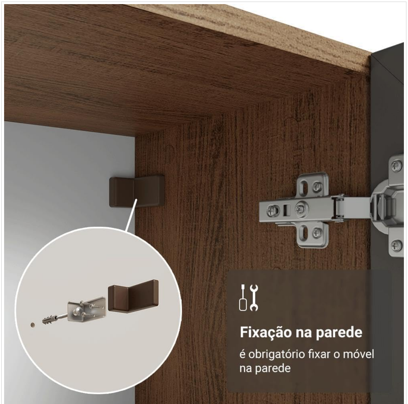
Image: Detail showing the wall fixation mechanism, emphasizing the mandatory wall attachment for stability.