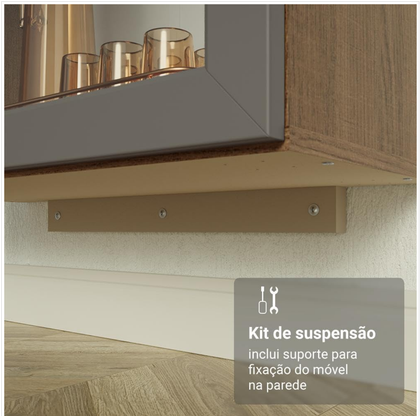
Image: Close-up of the suspension kit, which includes the support profile for fixing the furniture to the wall.

Important Note: Madesa does not provide assembly services. It is the responsibility of the customer to ensure proper and safe assembly and installation.