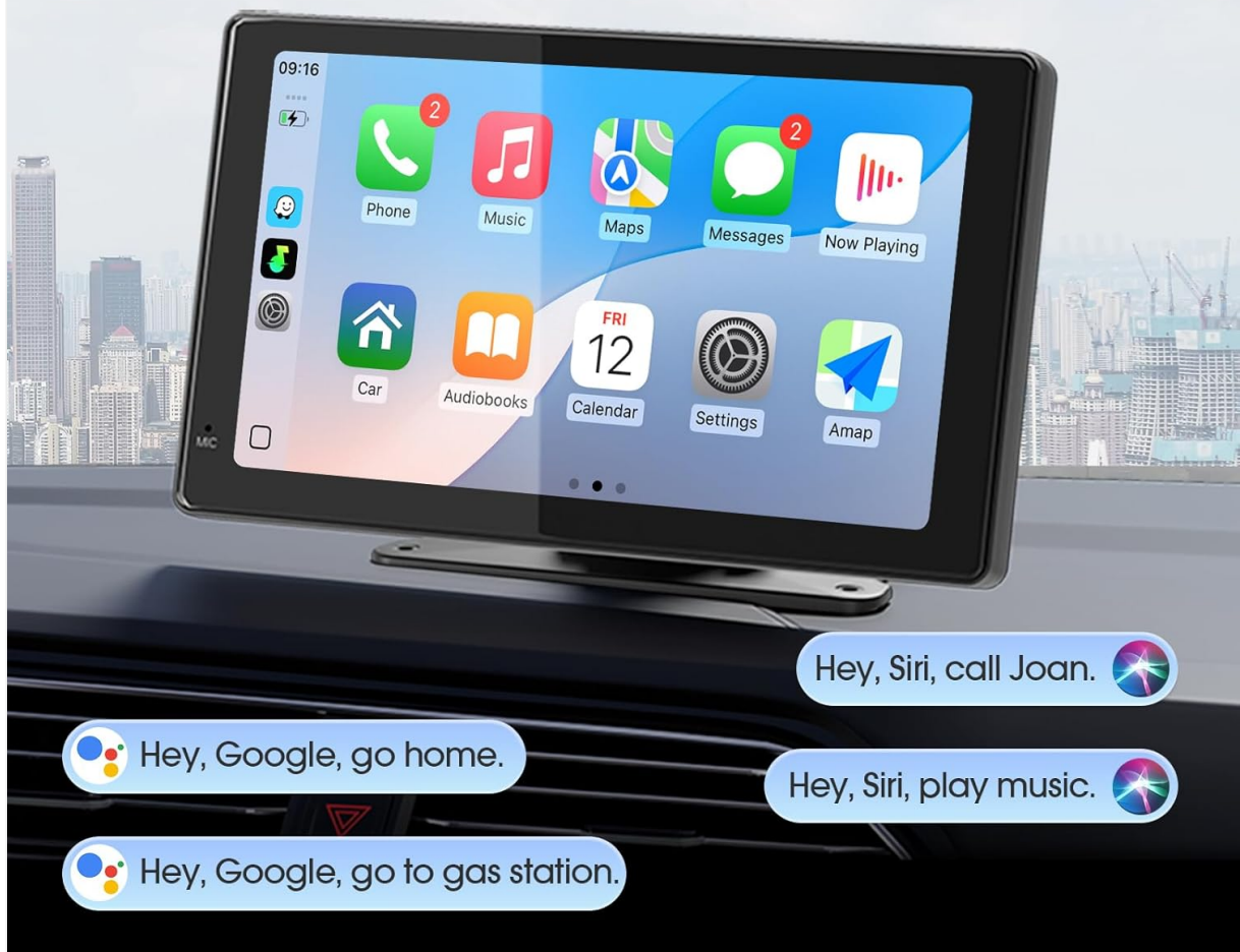
Image: CarPlay interface on the Haudio 7-inch car stereo.