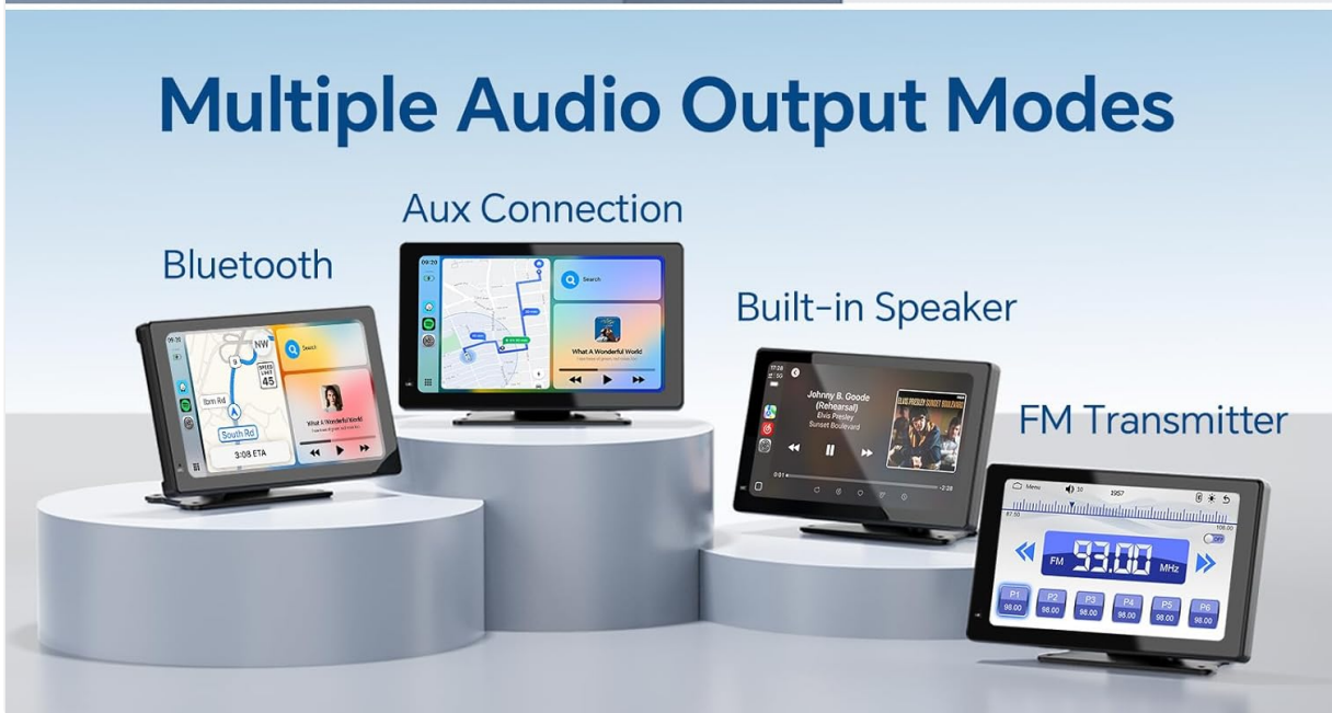
Image: Mirror Link function displaying smartphone apps on the car stereo.

Precision-designed for more penetrating sound