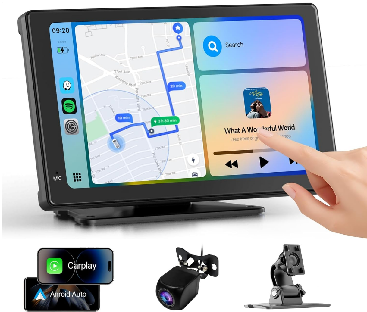
Image: Haudio 7-inch car stereo installed on a vehicle dashboard.