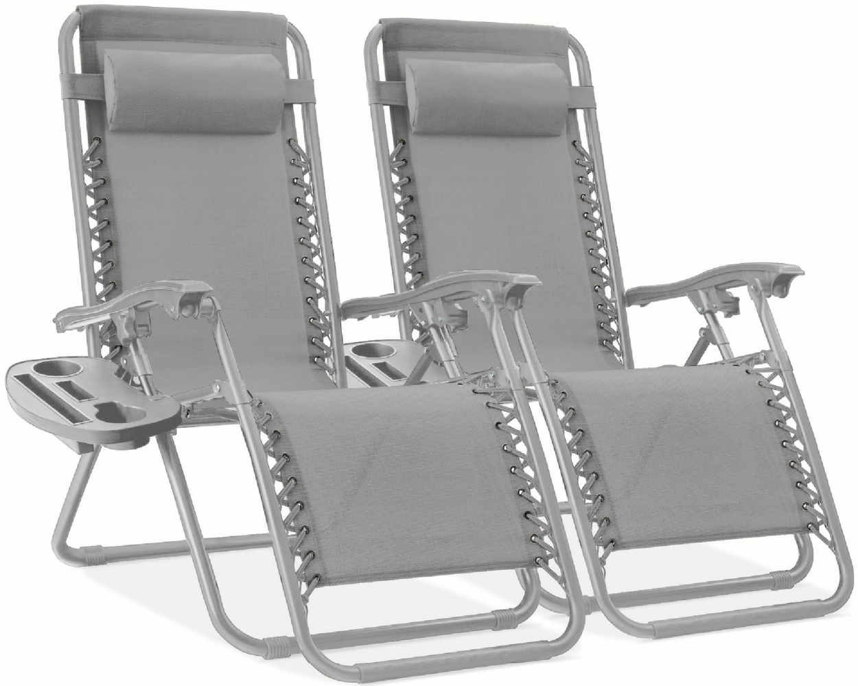
Image: Two Best Choice Products Zero Gravity Lounge Chairs in Dove Gray, set up on a patio.