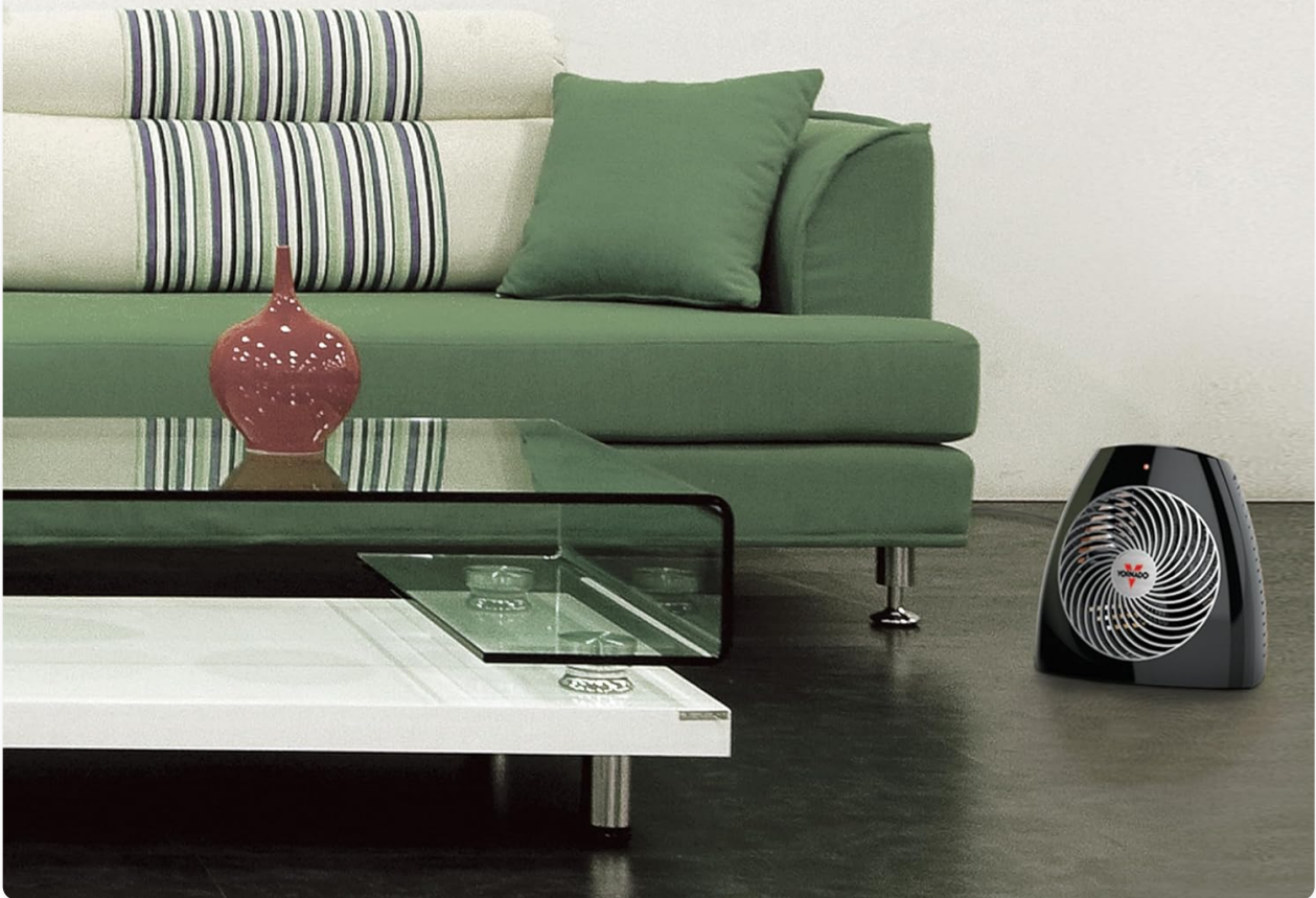
Image: The Vornado MVH (2025) Space Heater positioned in a living room, emphasizing its ability to provide customized comfort with 3 heat settings.