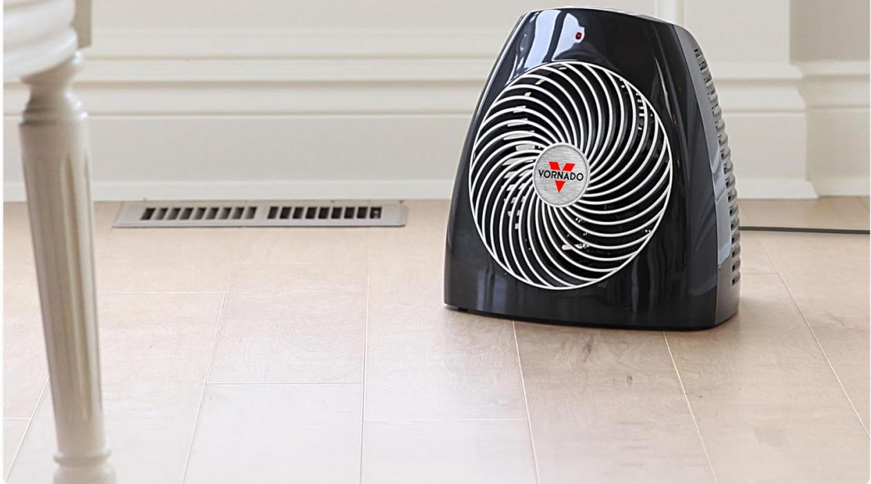
Image: The Vornado MVH (2025) Space Heater on a wooden floor near a white wall, accompanied by icons highlighting its 5-year guarantee, ETL listing, and origin in Kansas, USA since 1945.