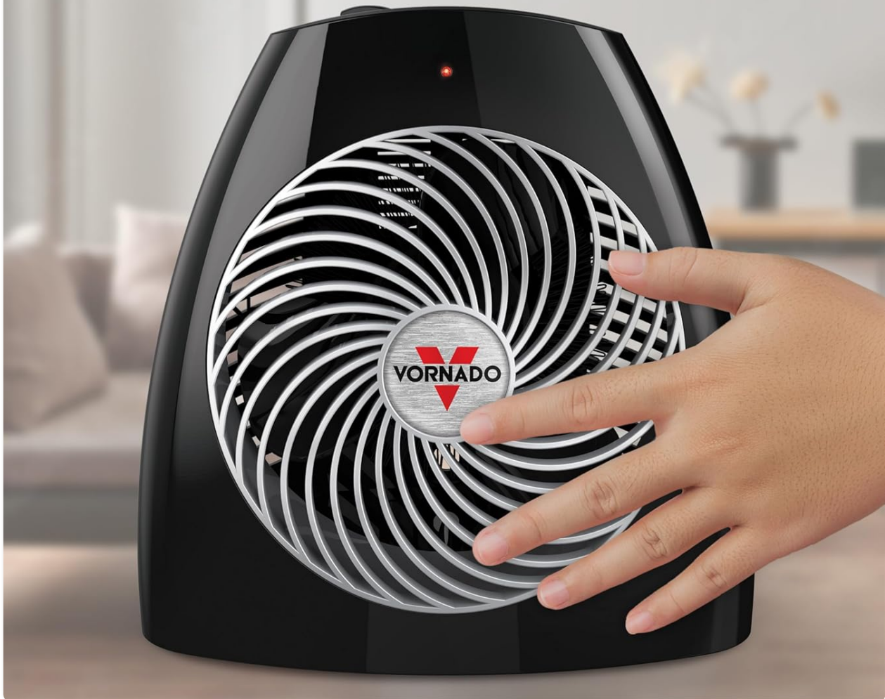
Image: A hand touching the cool-touch exterior of the Vornado MVH (2025) Space Heater, with icons indicating tip-over protection, overheat shut-off, and V-0 flame retardant materials.