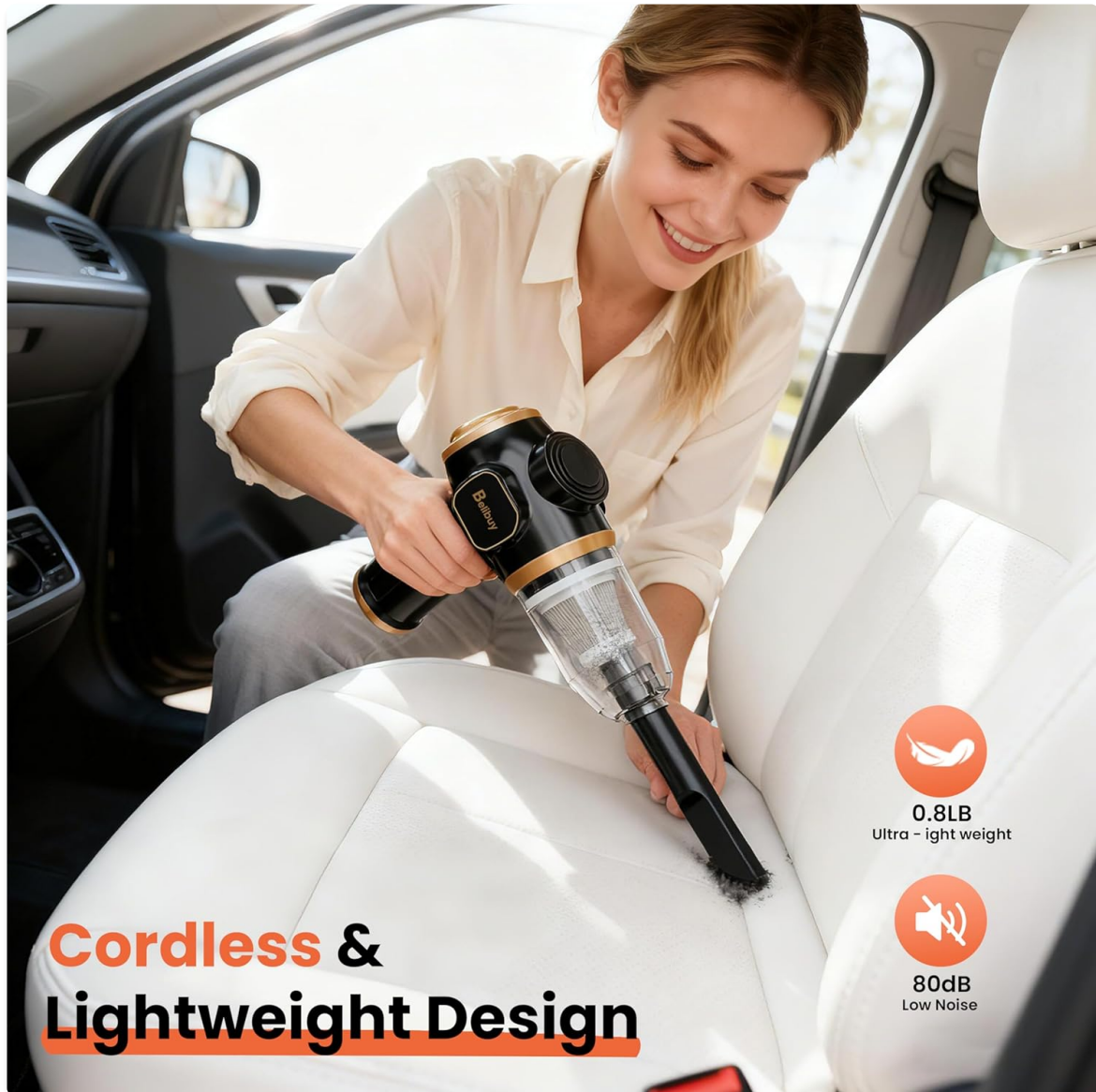
Image: The compact and portable design of the vacuum cleaner, illustrating its small size and ease of storage in a car or drawer.

Technical details of the BELIBUY Brushless Motor Portable Cordless Car Vacuum Cleaner: