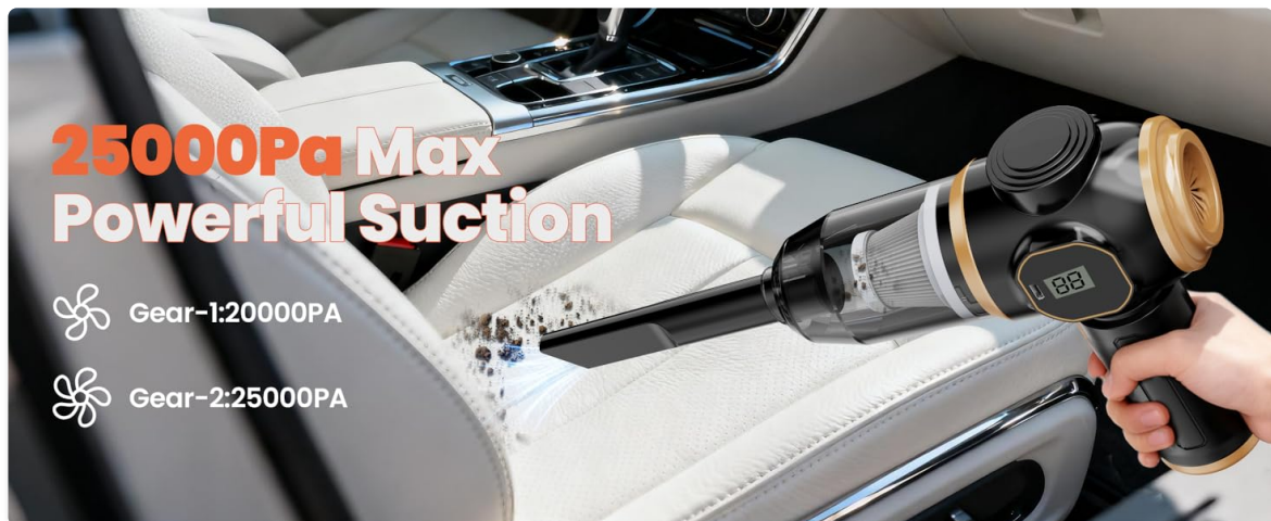
Image: The vacuum cleaner displaying its two suction modes, 20,000 Pa and 25,000 Pa, for different cleaning needs.