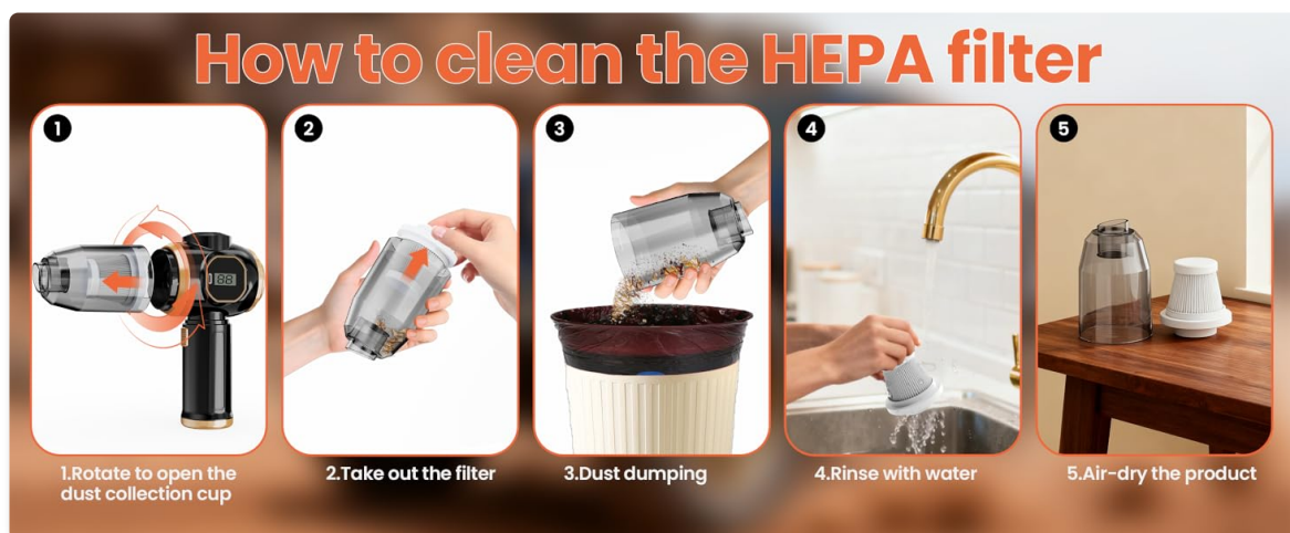
Image: The washable HEPA filter and dust cup being rinsed under running water, demonstrating the ease of cleaning.

The HEPA filter is washable and reusable. Clean it regularly to maintain strong suction and prevent clogging.