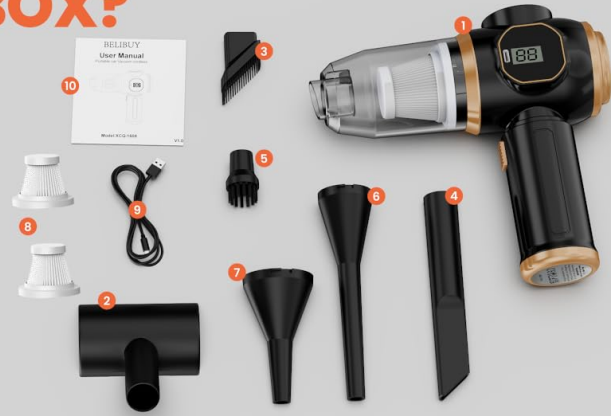
Image: All components included in the box, such as the vacuum cleaner, various nozzles, HEPA filters, Type-C cable, and user manual.