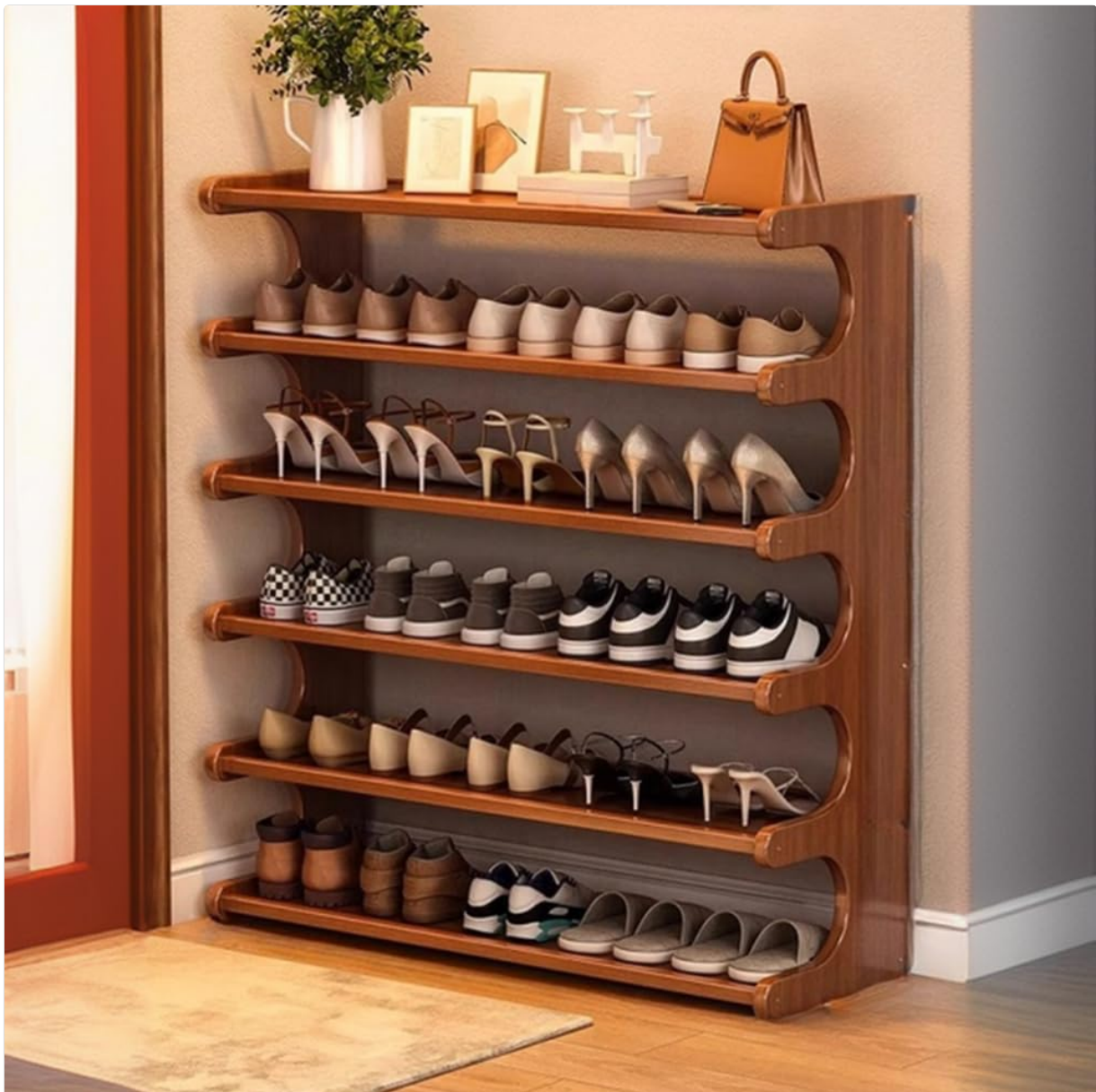
Image 1: Fully assembled LITFAD 6-Shelf Bamboo Shoe Rack, showcasing its capacity and design.