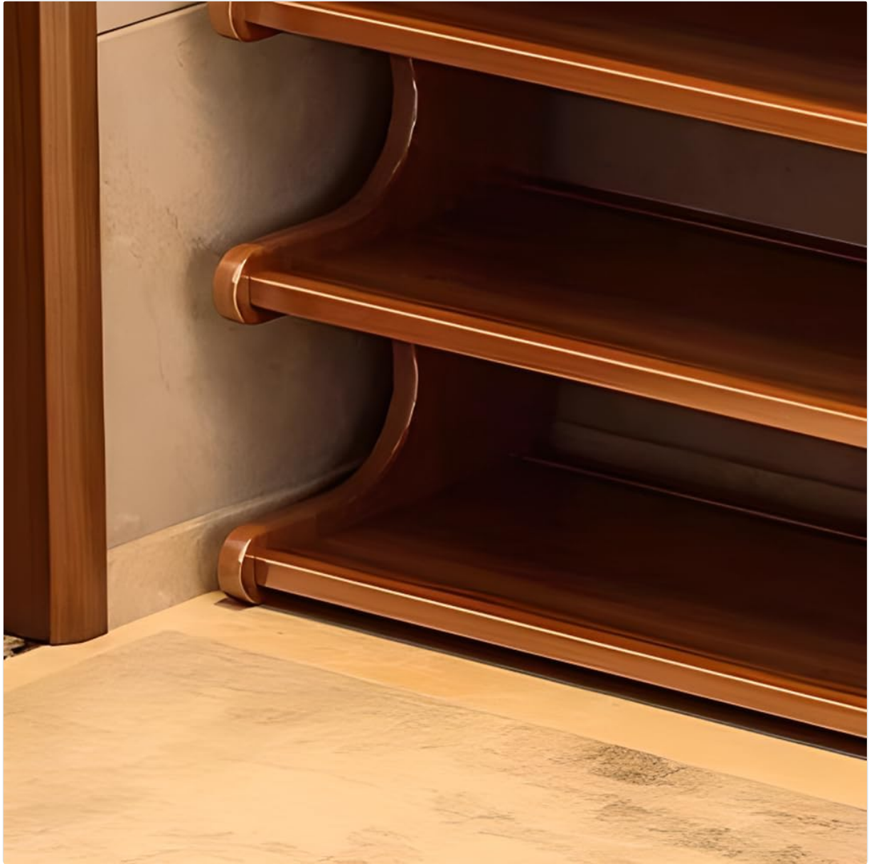
Image 2: Detail of the empty shelves and the distinctive curved side panel design, illustrating how shelves are integrated.