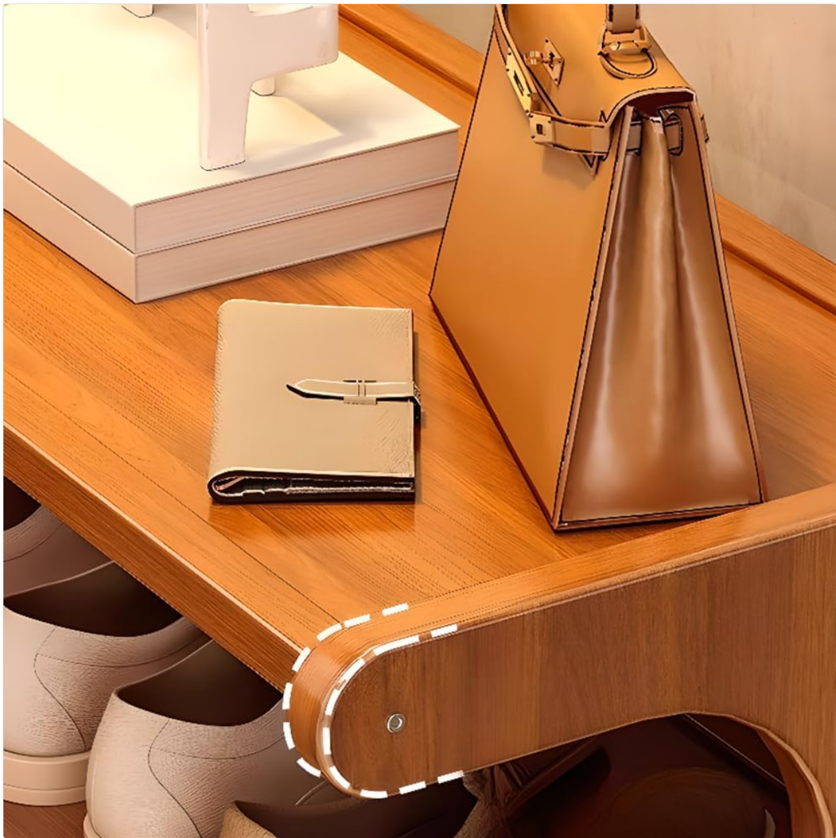
Image 3: The top shelf in use, demonstrating its capacity for small items and highlighting the rounded, safe edges.