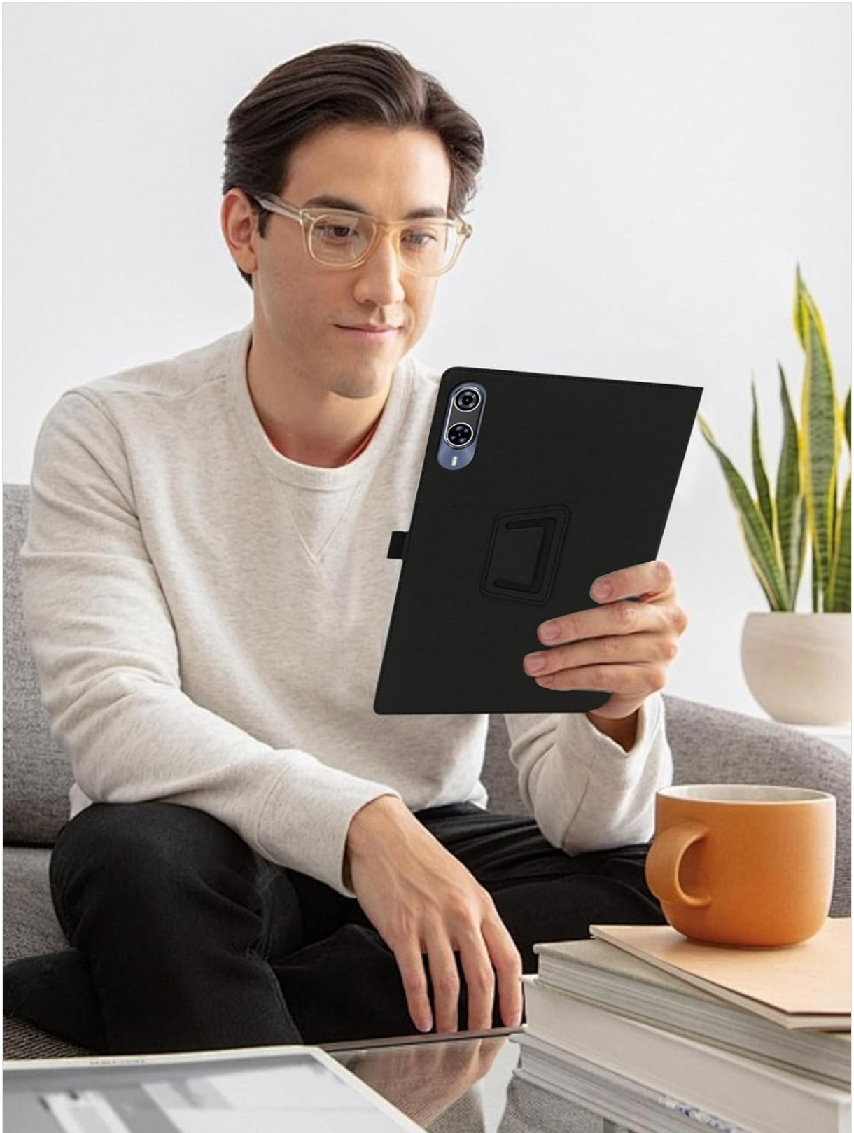
Image: Close-up of the case highlighting accurate cutouts for tablet features.