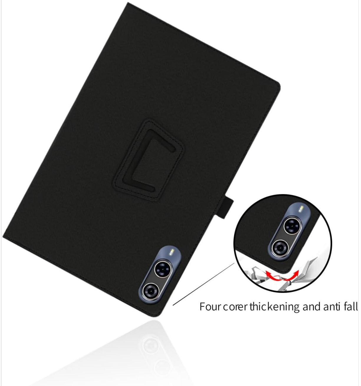
Image: Visual demonstration of the case's protective design, including reinforced corners.