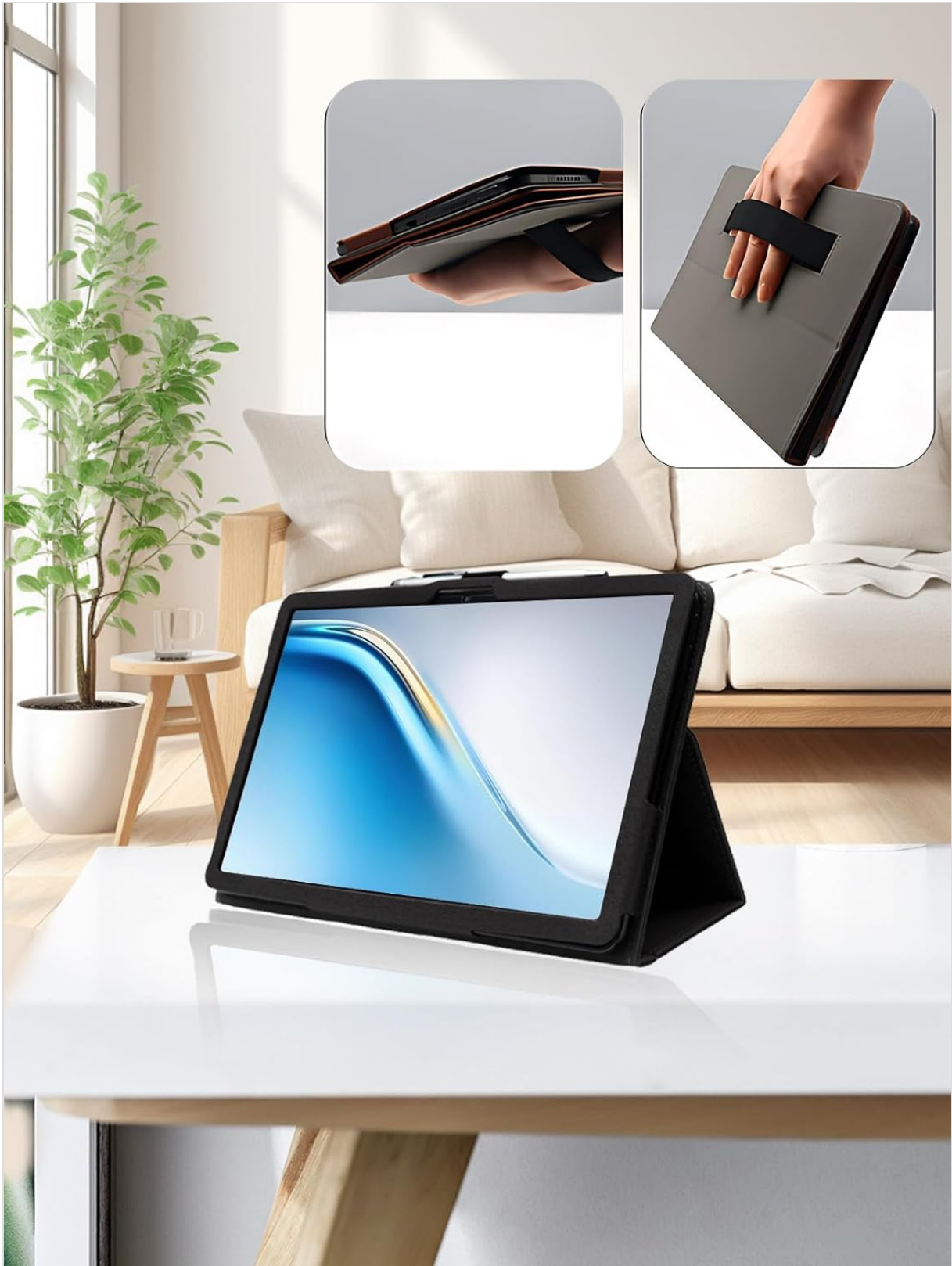
Image: Demonstrating the use of the integrated wrist strap for secure handling.