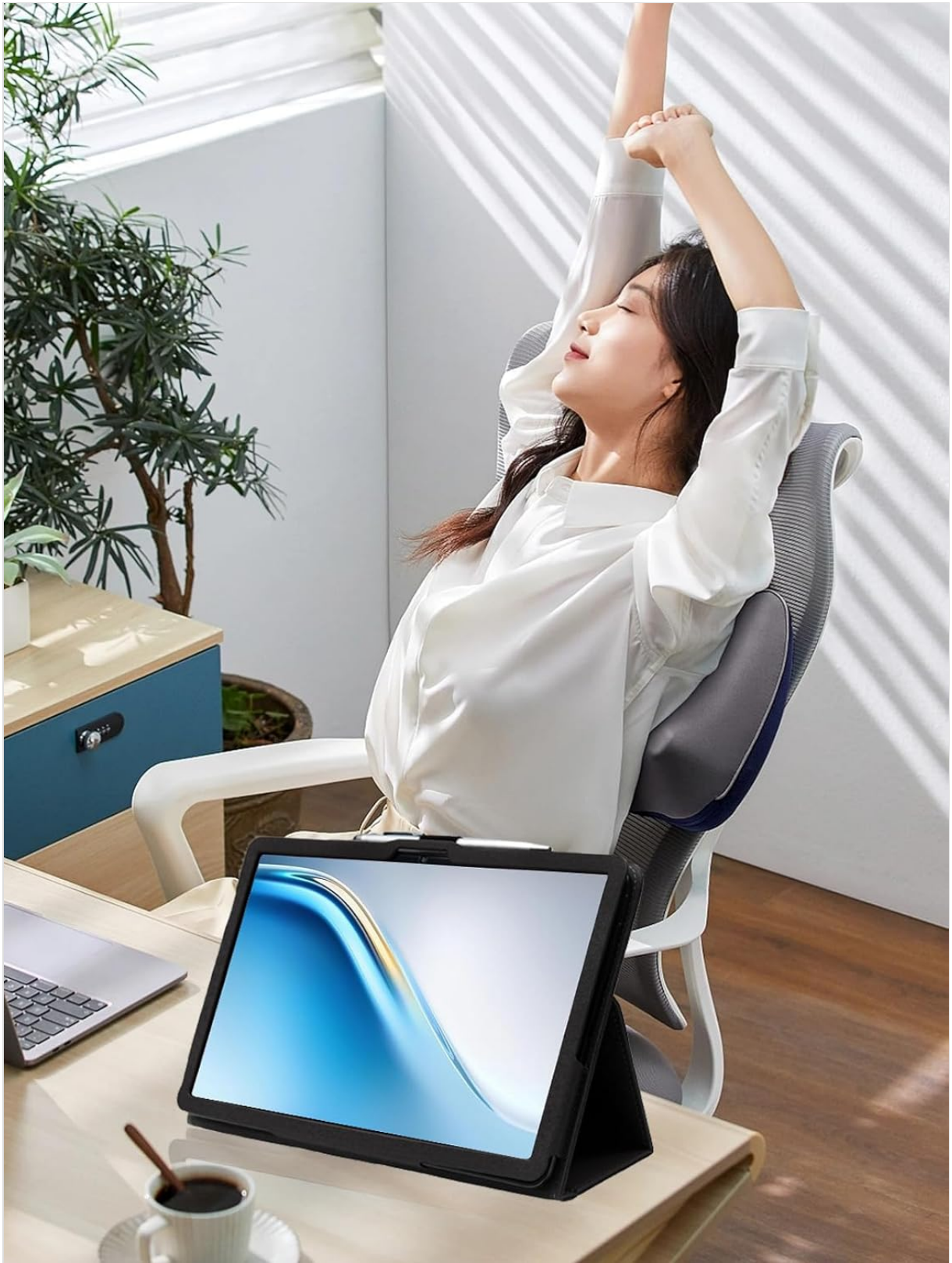
Image: Tablet installed in the protective cover, ready for use.