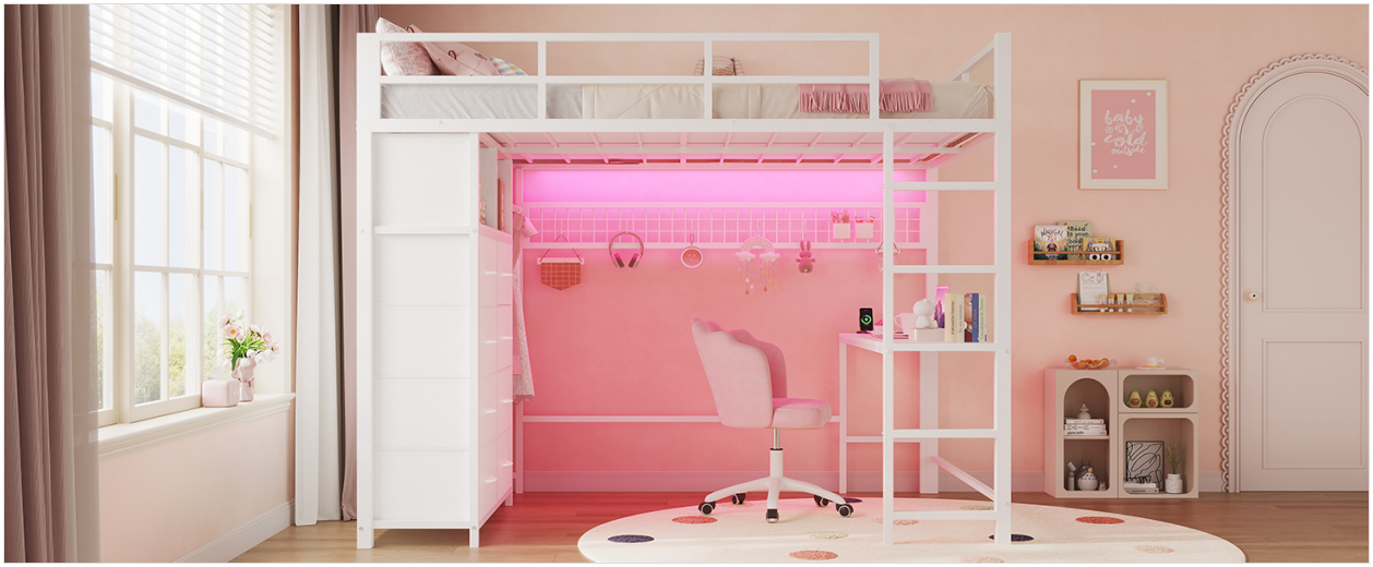
Image: Detailed view of the metal loft bed frame, highlighting the heavy-coated steel tube construction and no-assembly frustration design.