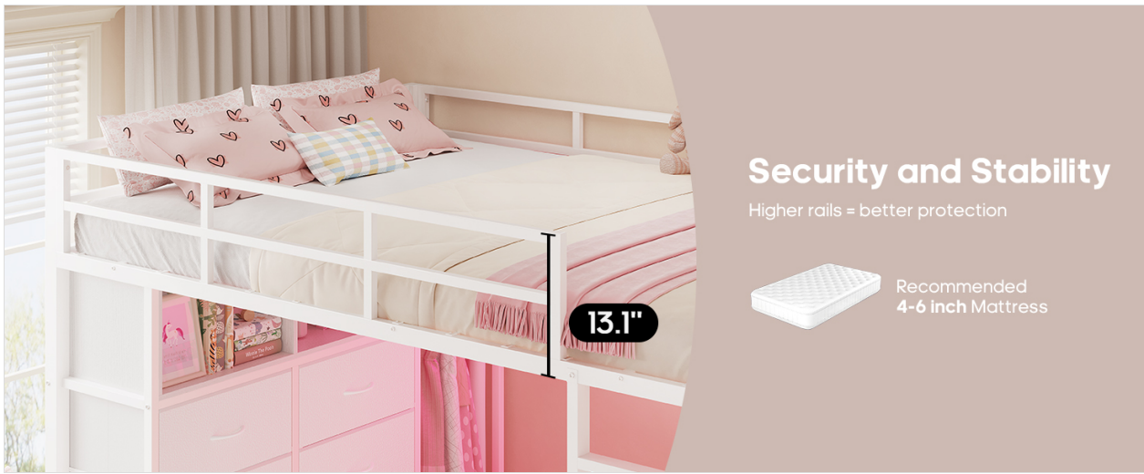
Image: Close-up of the safety guardrail on the loft bed, highlighting its height for user protection.