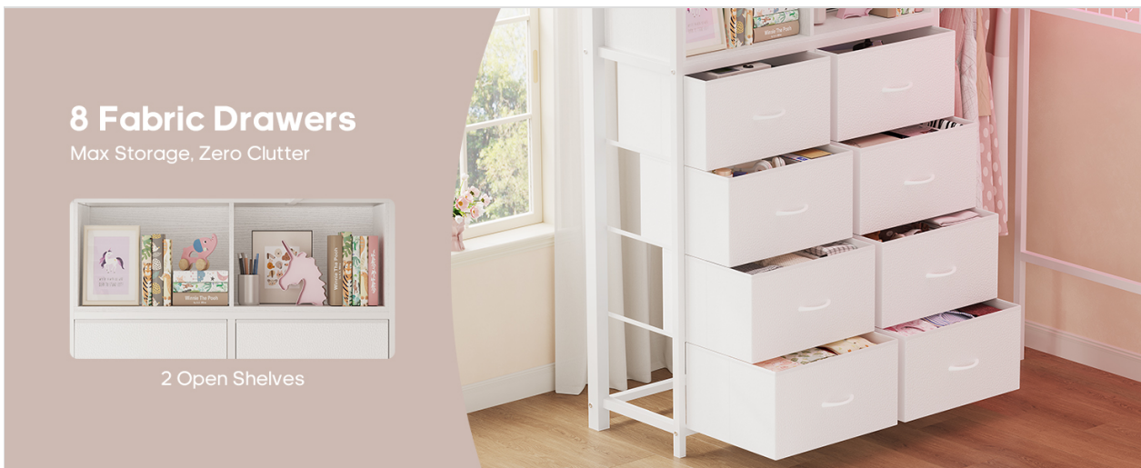
Image: The loft bed's integrated dresser with eight fabric drawers and two open shelves, demonstrating storage capacity.