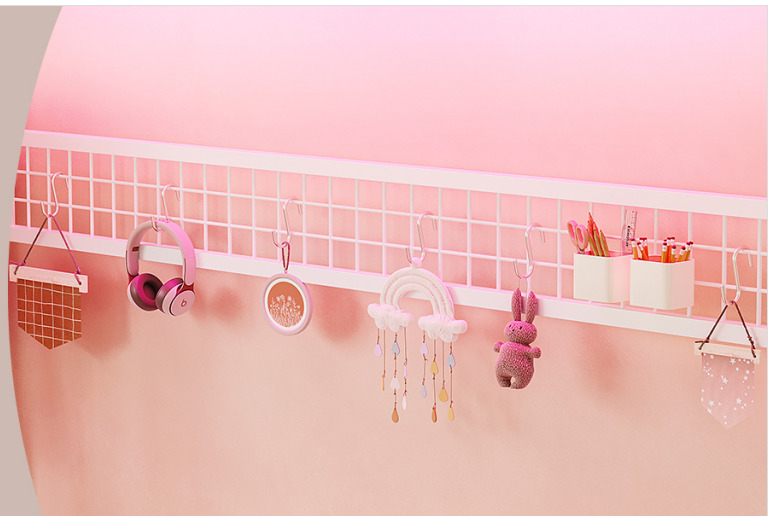
Image: The versatile mesh panel with seven S-hooks for organizing and personalizing the workspace.