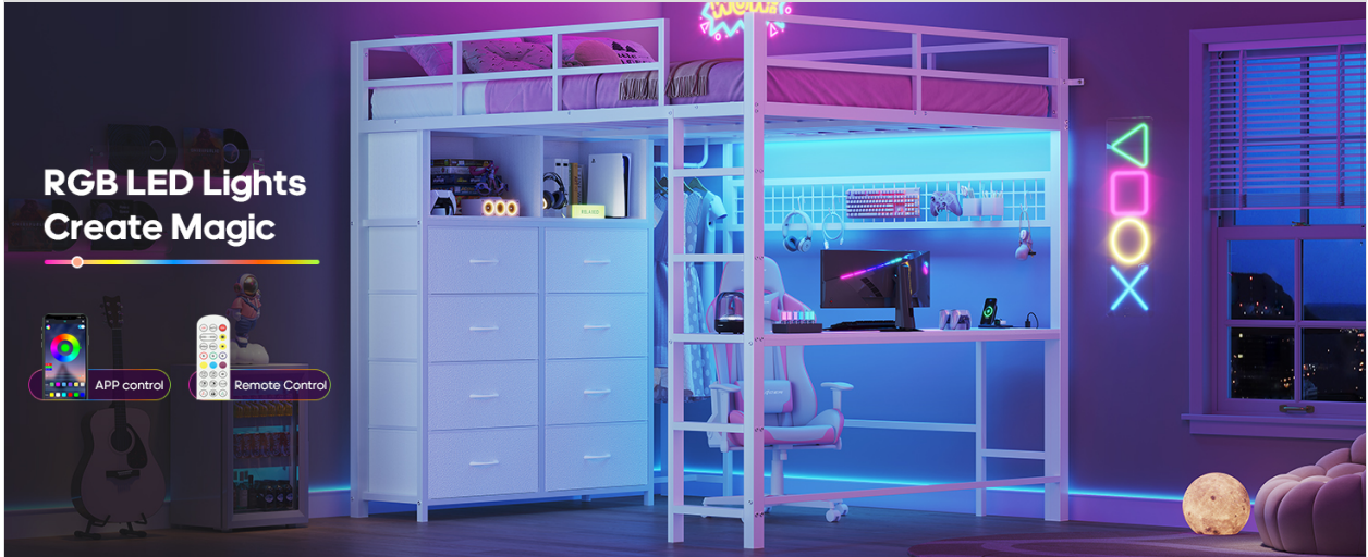
Image: The loft bed illuminated with dynamic RGB LED lighting, showcasing various color options and effects.

The integrated RGB LED lights offer over 60,000 color options and music sync capabilities. Control the lights via a dedicated app or remote to create your desired ambiance.