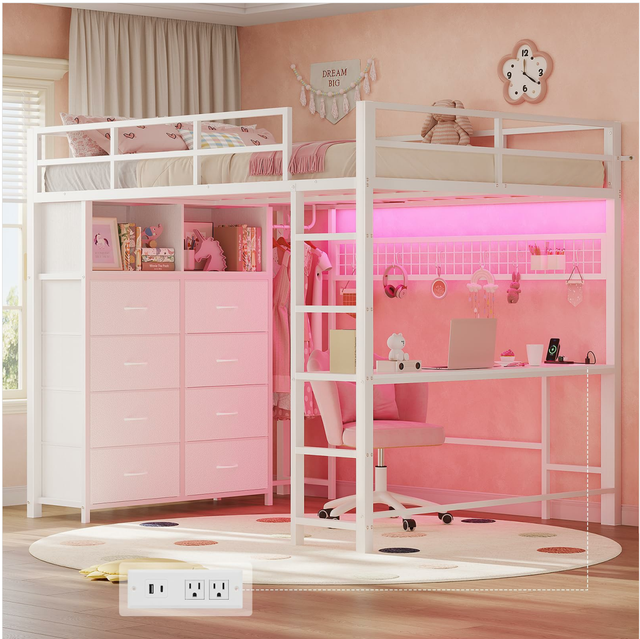
Image: The ADORNEVE Full Size Loft Bed in white, showcasing the elevated bed, integrated desk, and storage unit.