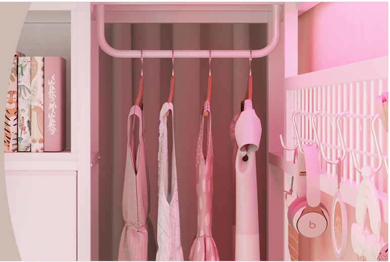
Image: Close-up of the clothing rack integrated into the loft bed structure.