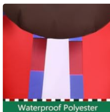
Image: A close-up view of the waterproof polyester fabric used in the inflatable's construction.