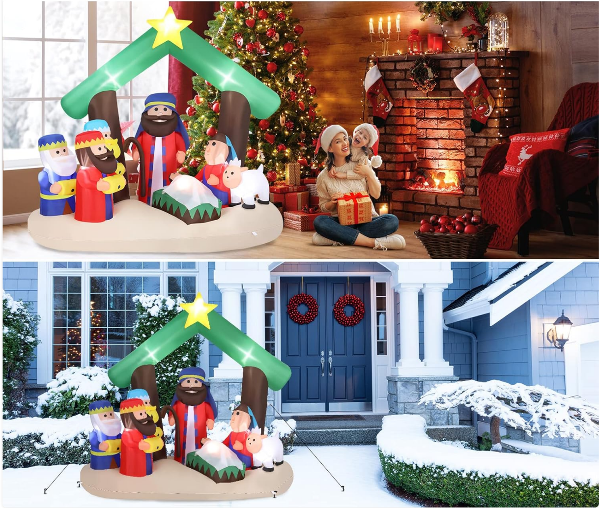
Image: The inflatable nativity scene displayed in both an indoor setting with a Christmas tree and an outdoor snowy yard.