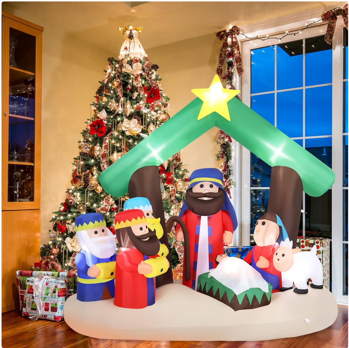
Image: The VINGLI 7FT Lighted Inflatable Christmas Nativity Decoration, fully inflated and illuminated.