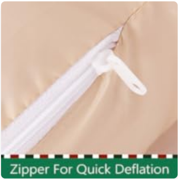
Image: A close-up of the zipper mechanism designed for quick and efficient deflation of the inflatable.