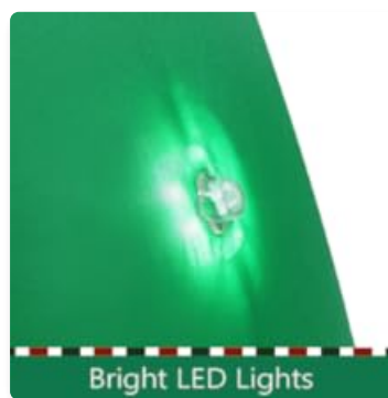
Image: A close-up view highlighting the bright LED lights that illuminate the inflatable decoration.