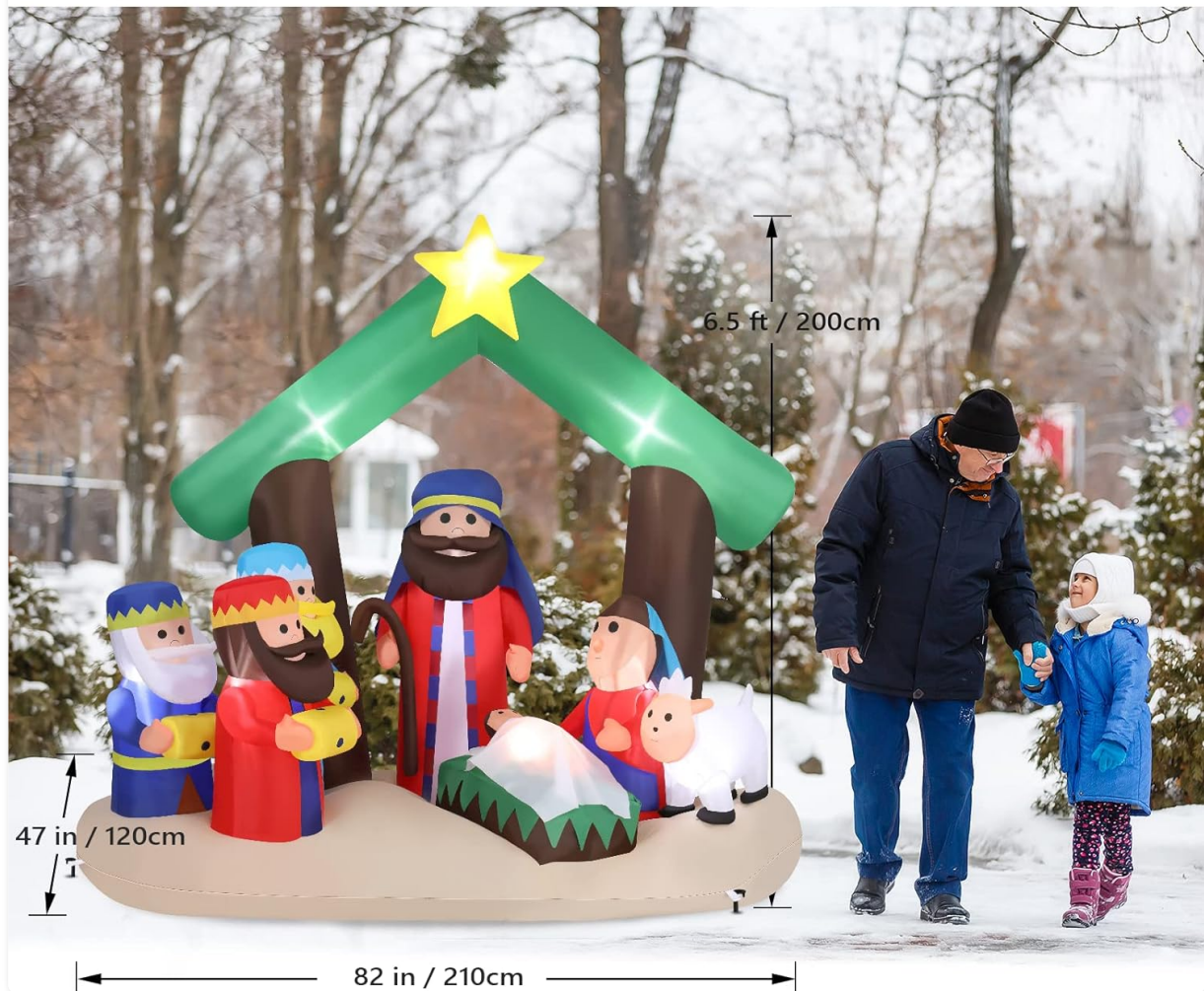
Image: The inflatable nativity scene with its approximate dimensions (height, length, width) indicated.