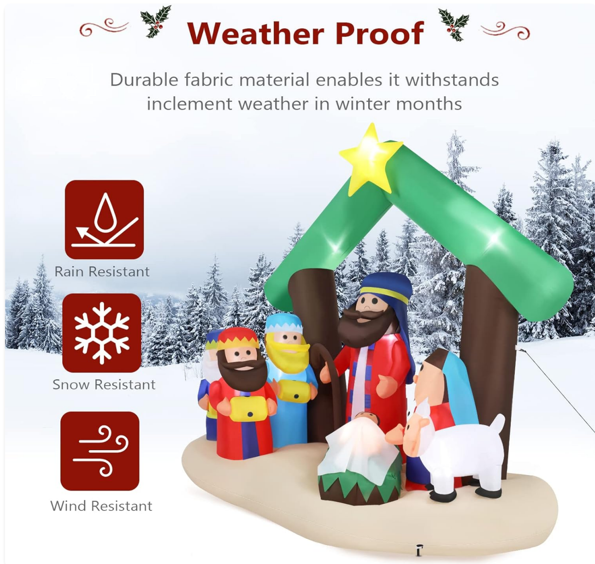
Image: The inflatable nativity scene with icons indicating its resistance to rain, snow, and wind.