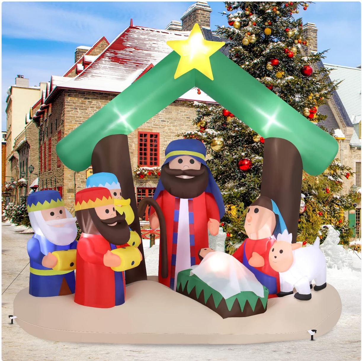
Image: The inflatable nativity scene brightly lit at night, showcasing its integrated LED lights in a winter environment.