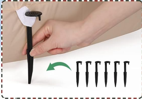
6 Stakes To Fix

Stakes together with bulid-in sandbag secure it to stand steady