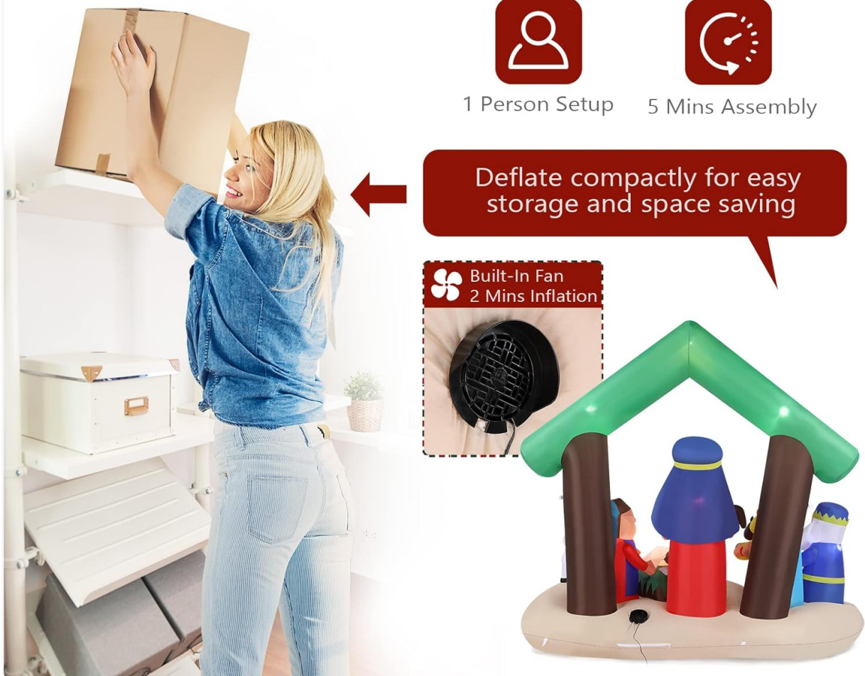
Image: Visual guide illustrating the simple 1-person, 5-minute assembly process and compact deflation for storage.