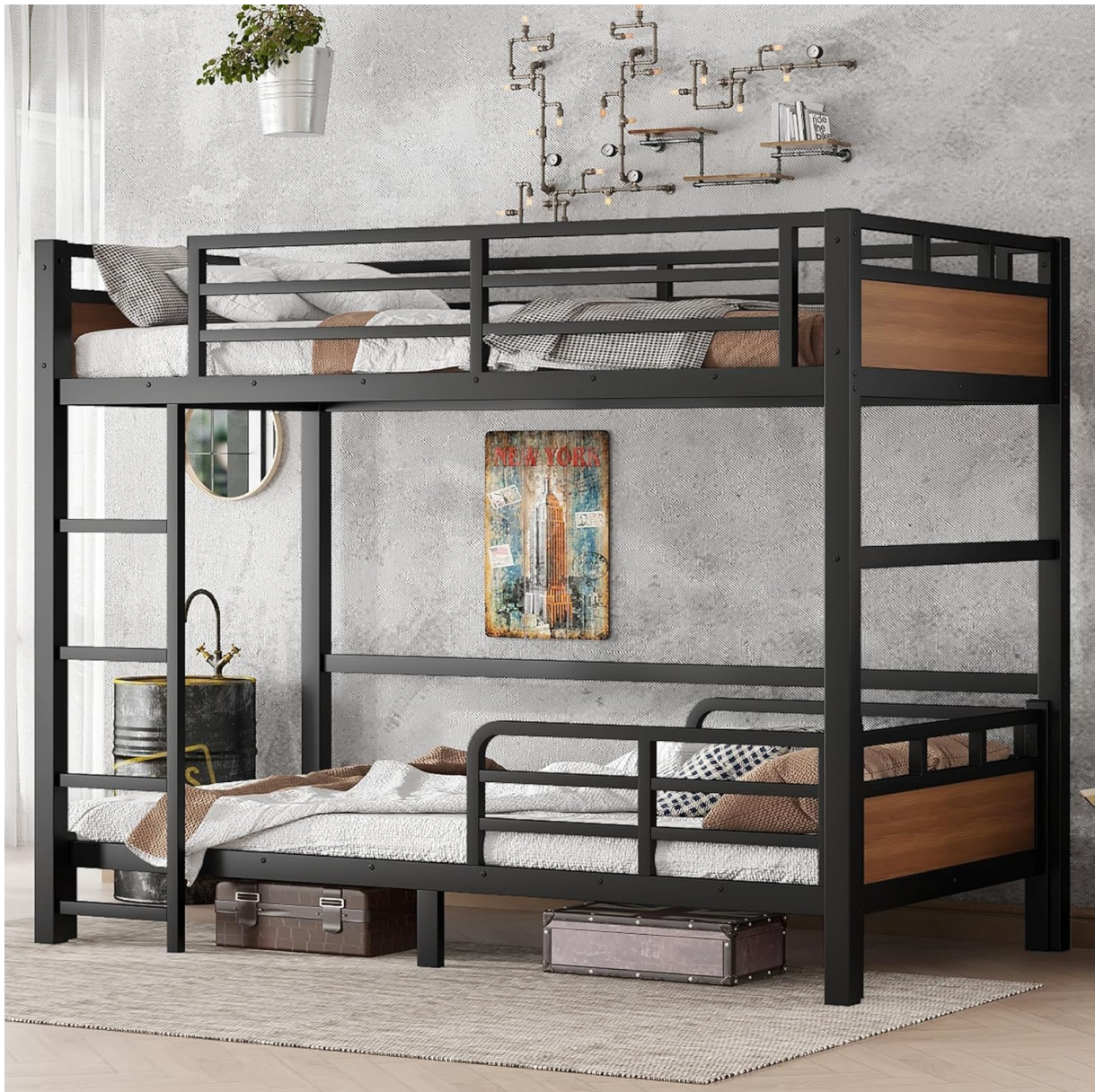
Image: The Bellemave Twin XL Over Twin XL Bunk Bed fully assembled in a bedroom, showcasing its sturdy metal frame and wooden headboard accents.