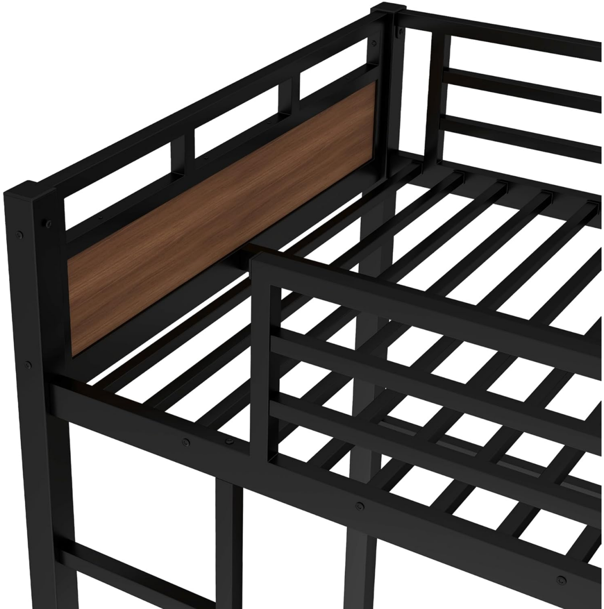
Image: A detailed view of the sturdy metal guardrails and the walnut-finished headboard, highlighting the secure construction.

Video: A general installation guide for heavy-duty bunk beds, showing the step-by-step assembly process.