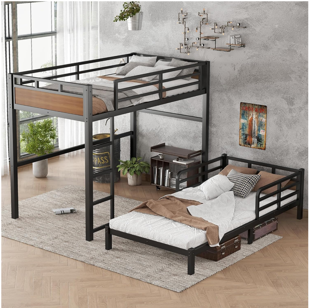
Image: The bunk bed reconfigured into a high loft bed and a separate, lower platform bed, demonstrating its versatility.