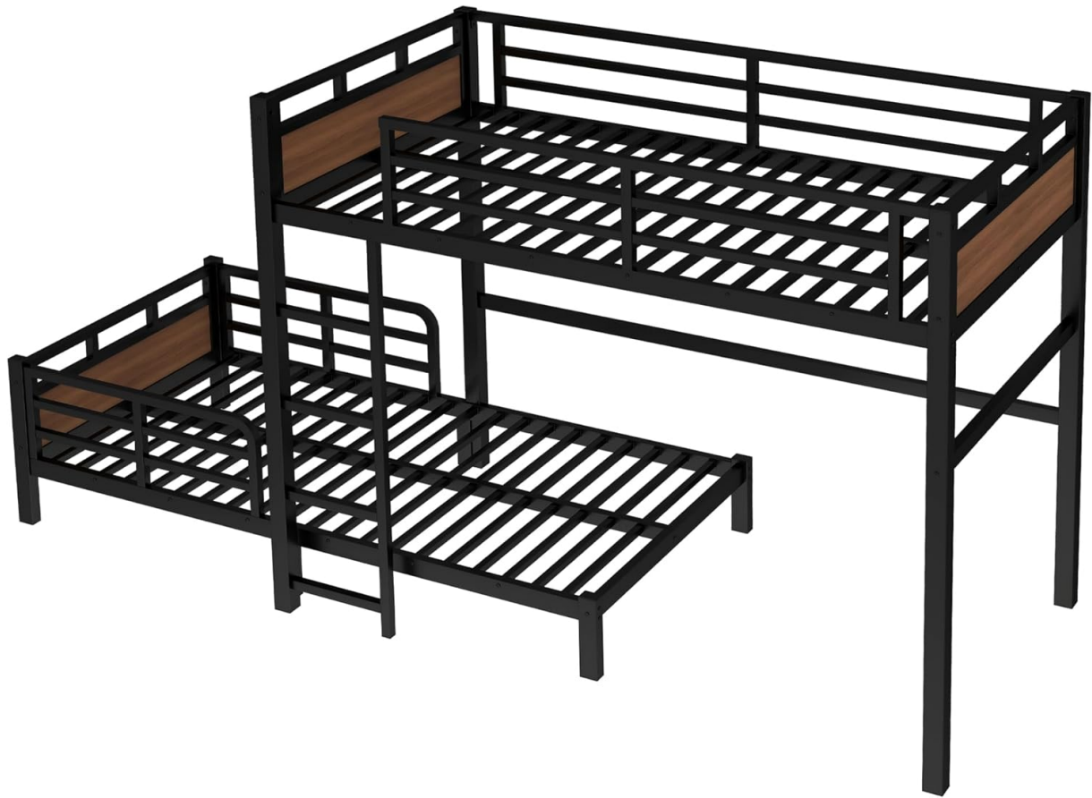
Image: A view of the bunk bed with the lower Twin XL bed detached and positioned as a standalone bed, separate from the upper loft bed.