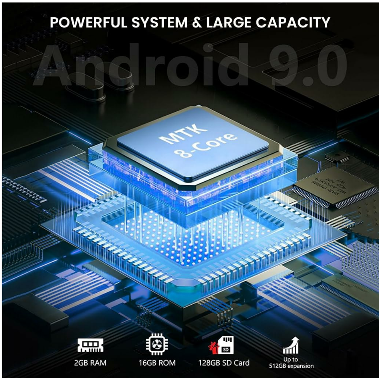
Image 8.1: Internal components and system architecture of the M302 player.