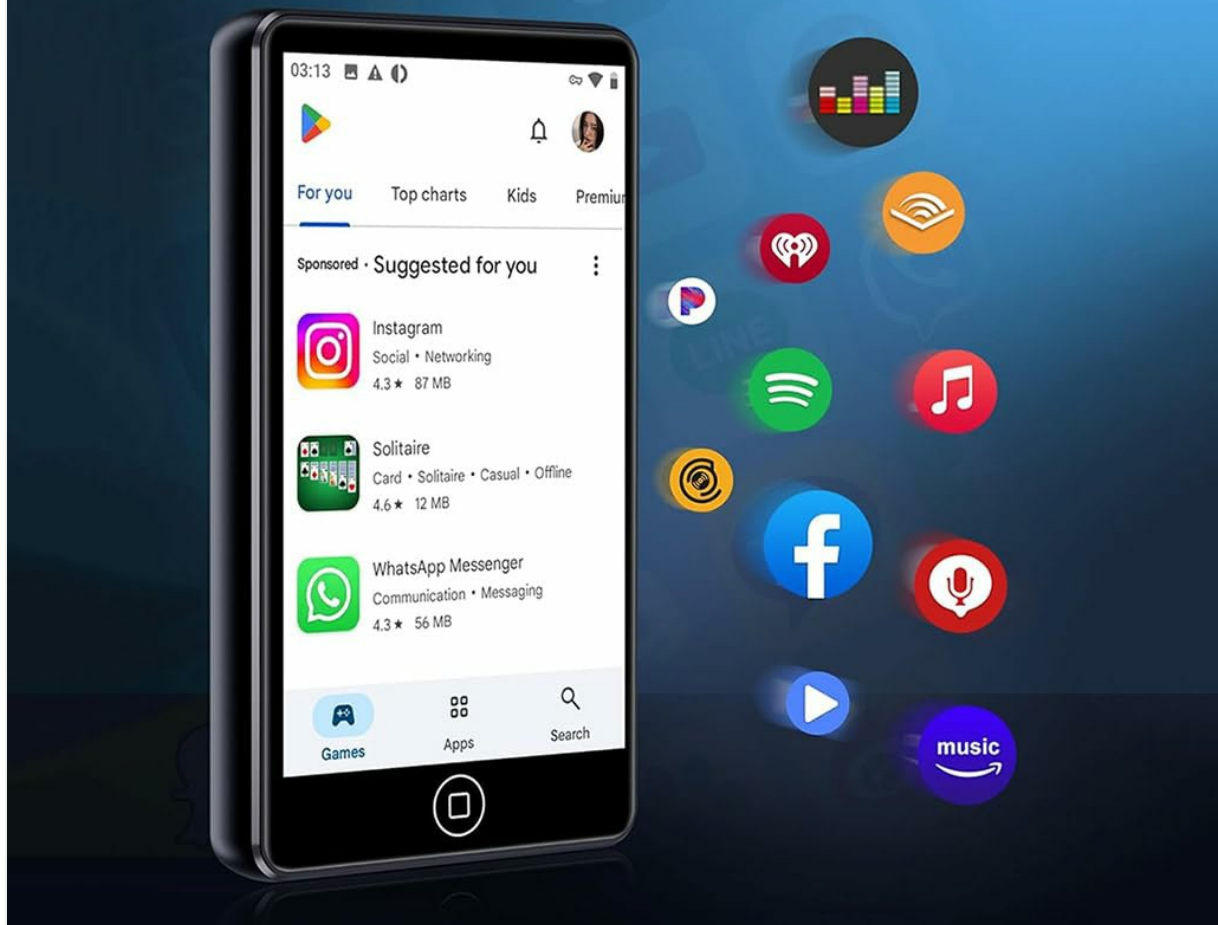
Image 3.1: Front view of the M302 player, highlighting the touchscreen display.

Combine music player, video player, FM radio, voice recording, Ebook, and more in a compact and portable form factor.