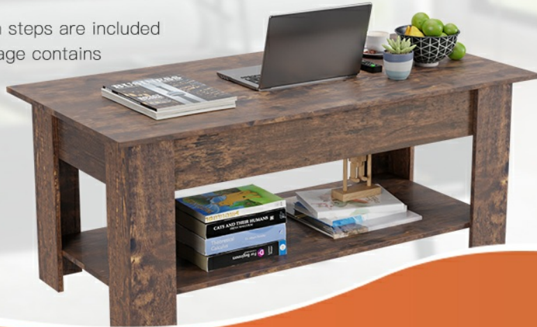
Image 4.1: The coffee table in a living room setting, emphasizing ease of installation with included tools and instructions.