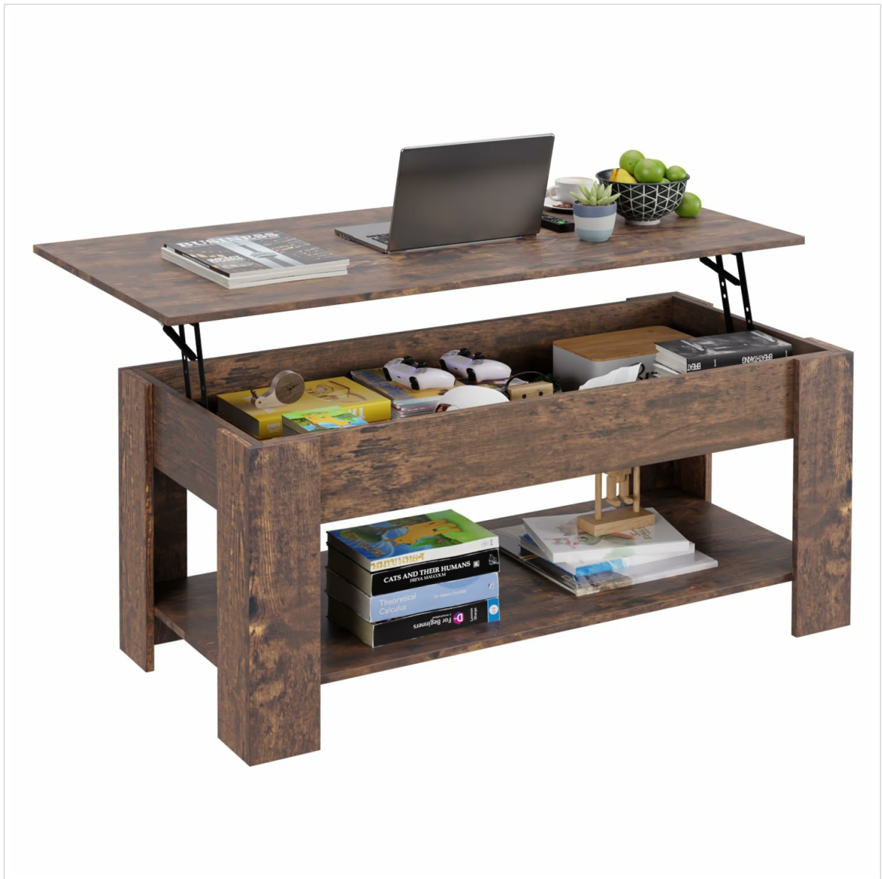
Image 1.1: The FDW Lift Top Coffee Table with its top raised, showcasing the hidden compartment and open shelf. A laptop is placed on the lifted surface.