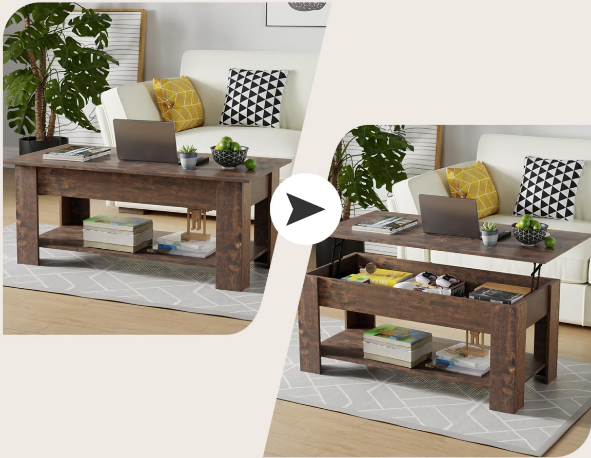
Image 5.1: Illustration of the lift-top design, showing the table in both closed and open positions.

The tabletop can be easily lifted up or lowered down to create a workstation