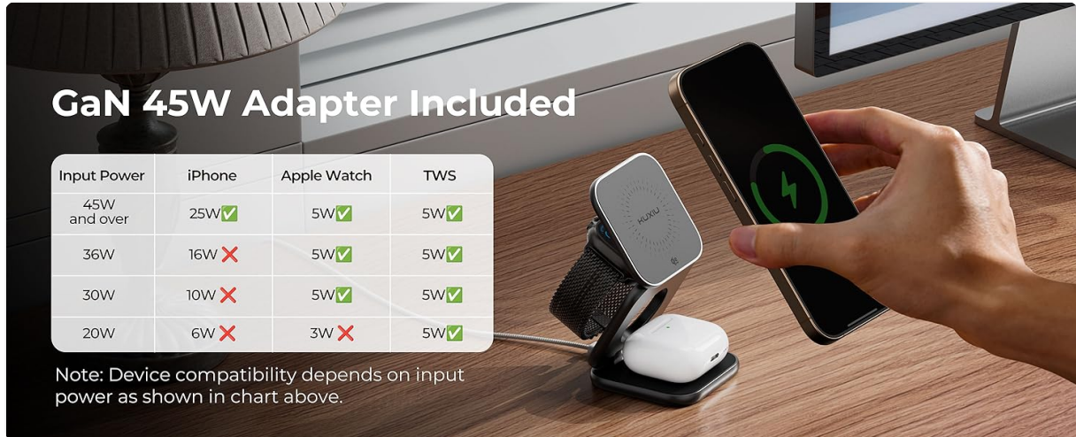
Image: The 3-in-1 charging station actively charging an iPhone, Apple Watch, and AirPods.

The included 45W GaN adapter ensures maximum efficiency for all three devices. Note that multi-device charging may intelligently distribute power; single-device charging will be faster.