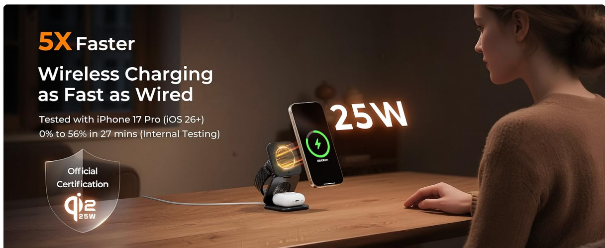
Image: The charging station showcasing its flexibility in different operational modes.