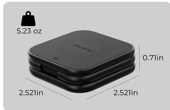
Image: The charging station shown folded for portability and unfolded for use.