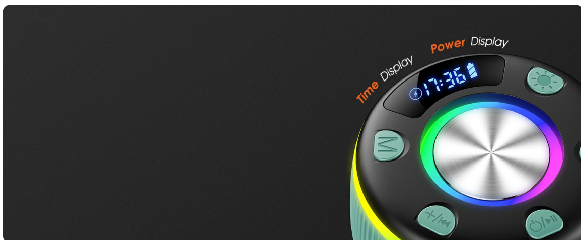
Image: Close-up of the PRSCFUM Q90 speaker's digital display showing the time and battery power indicator.

The integrated digital display shows the current time. This feature is active when the speaker is powered on.