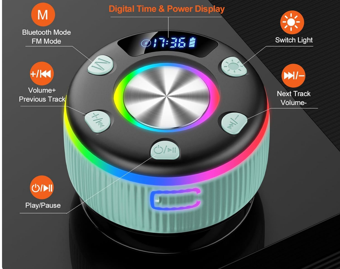
Image: Diagram of the PRSCFUM Q90 speaker's multi-function buttons, including Bluetooth/FM mode, volume/track controls, light switch, and play/pause. A digital display shows time and power.

Easily identify all physical buttons, and control the functions freely.