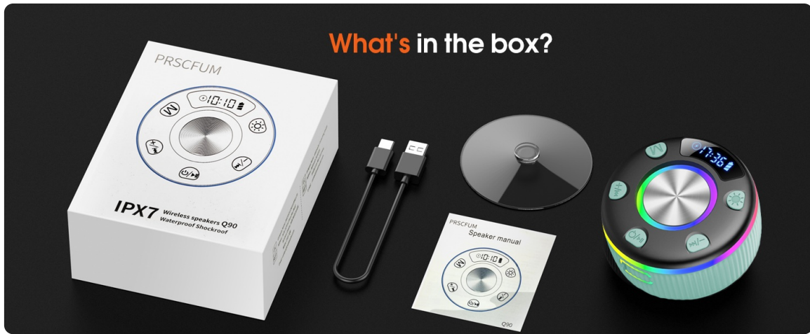
Image: Contents of the PRSCFUM Q90 speaker box, including the speaker, charging cable, and user manual.