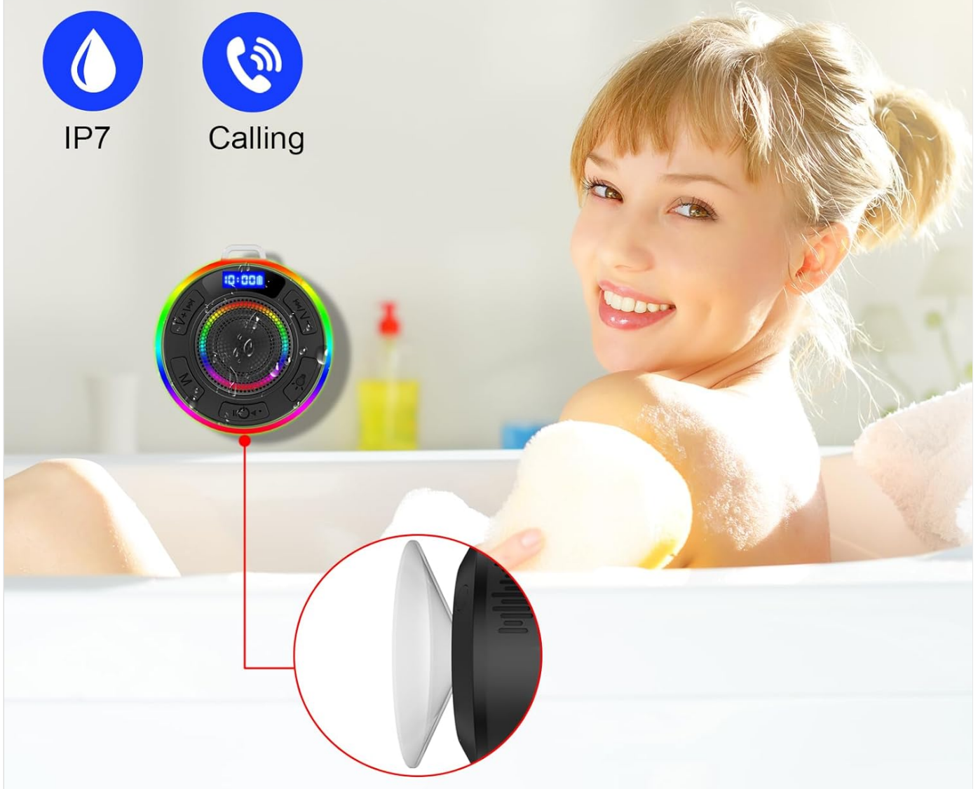
Image 3.2: Speaker attached to a shower wall using the suction cup.