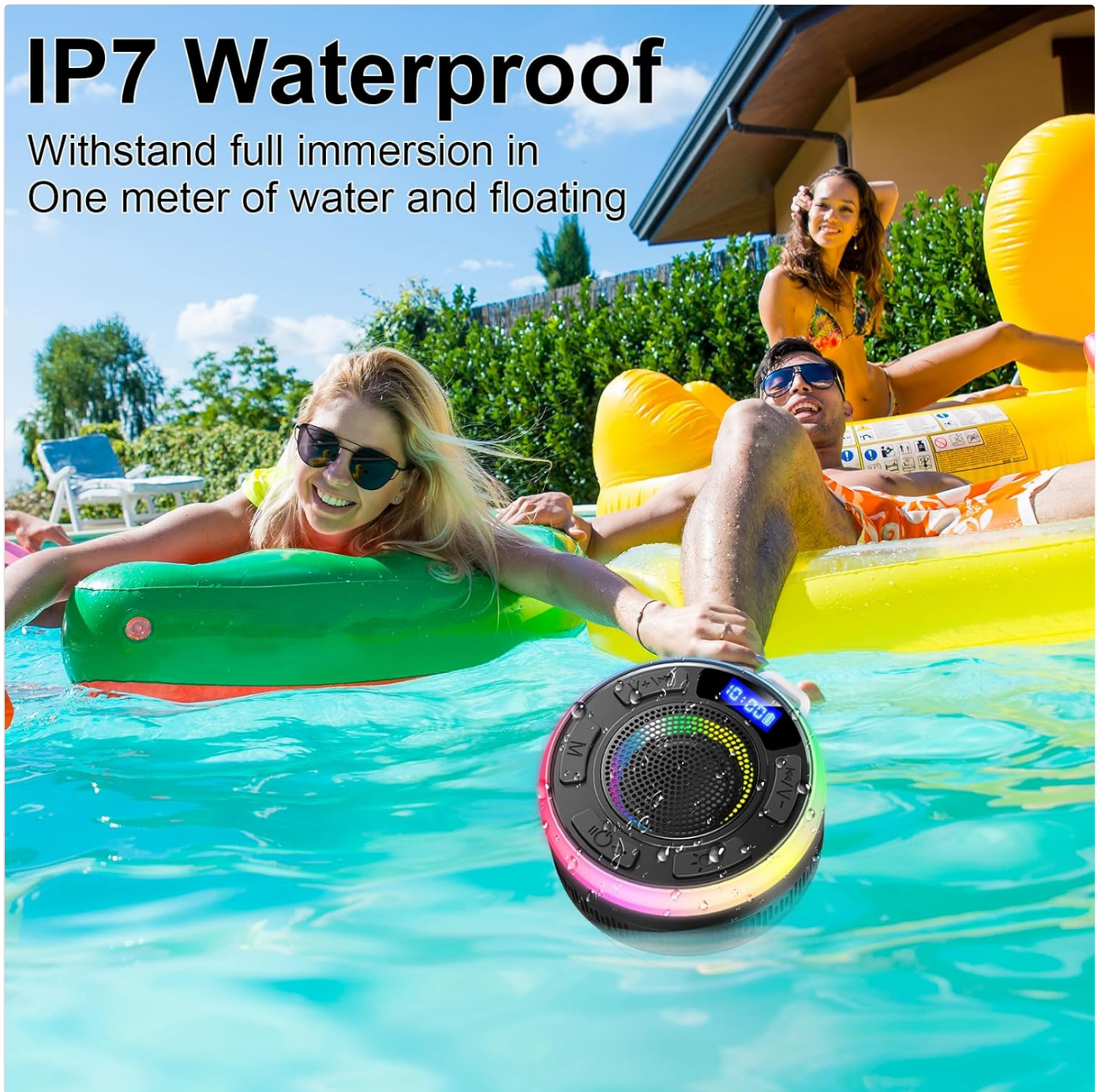
Image 4.3: Speaker demonstrating IPX7 waterproof capability in a pool.

Withstand full immersion in One meter of water and floating