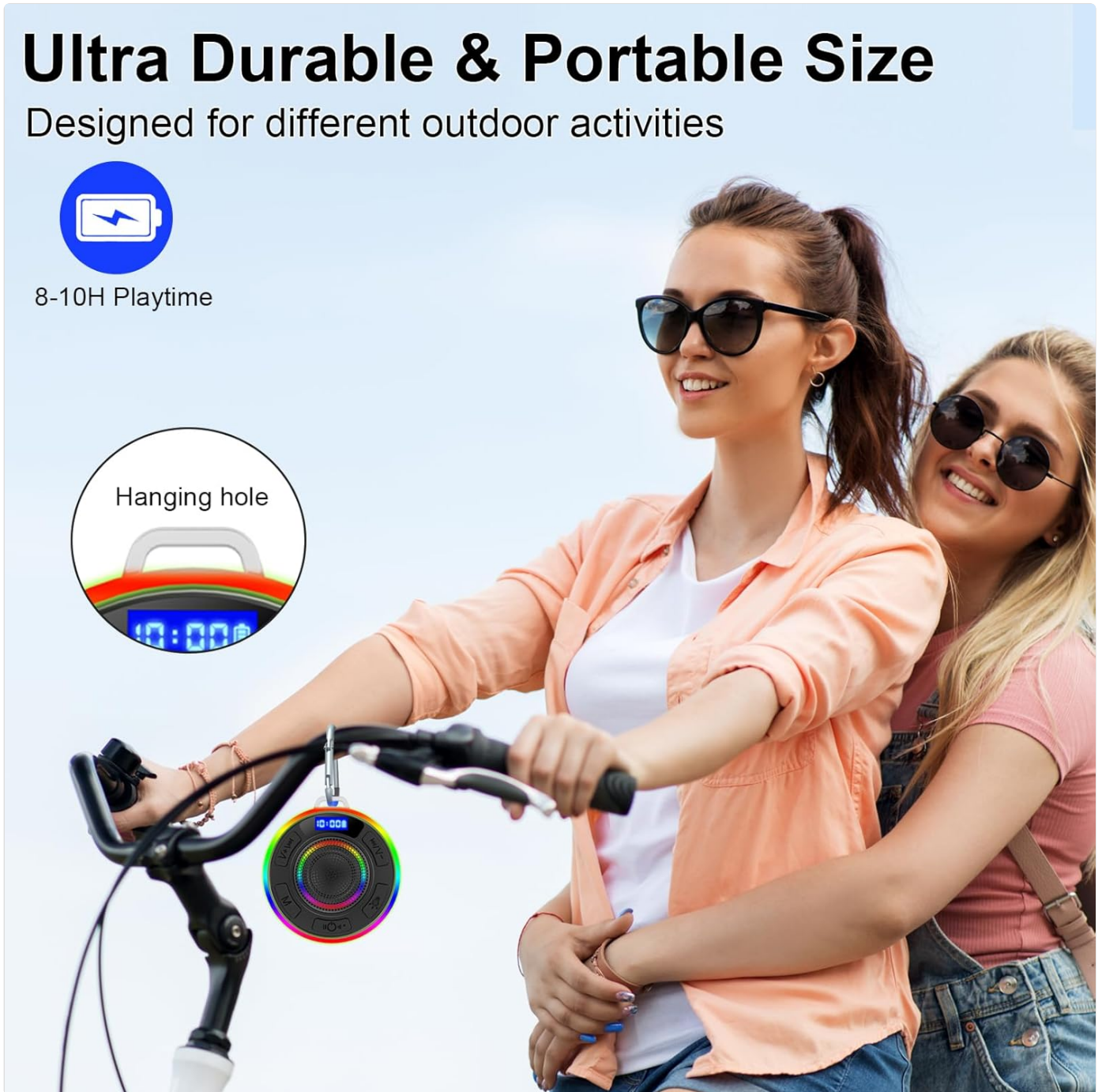
Image 4.5: Speaker attached to a bicycle, showcasing its portability.