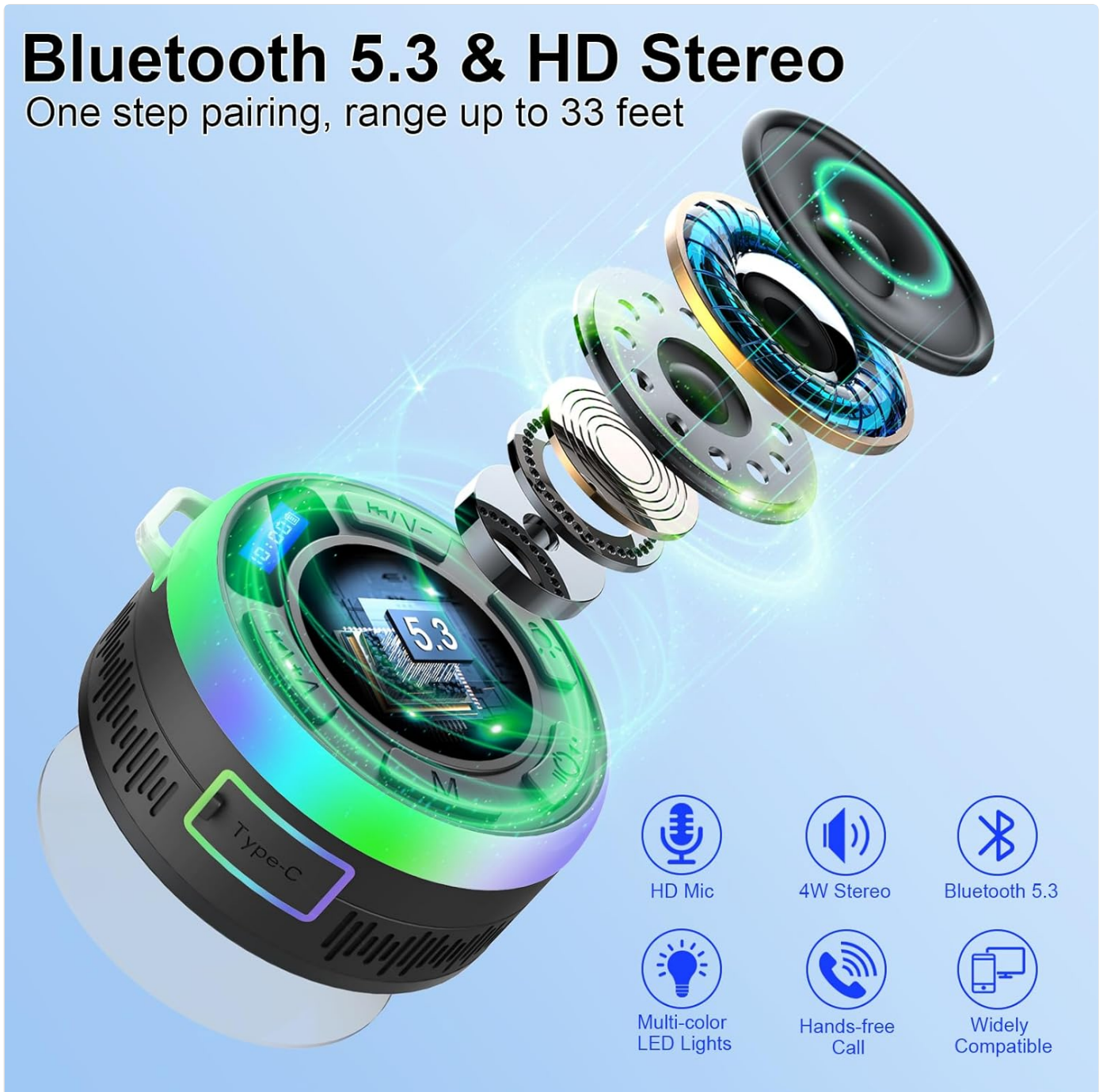
Image 3.1: Internal components highlighting Bluetooth 5.3 technology.